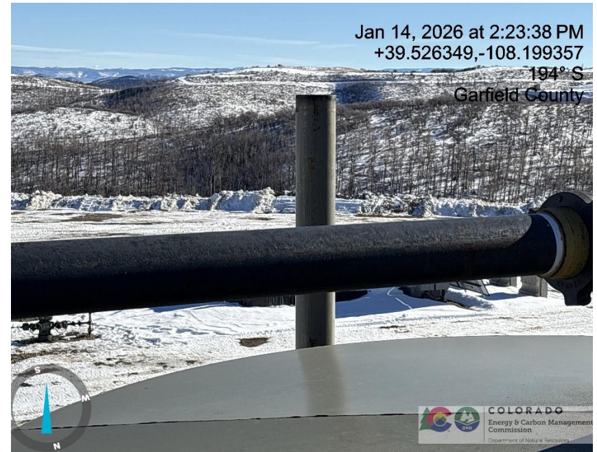
Photo # 1286 Burner exhaust stack on heated 400 bbl condensate tank lacks bird protection/wildlife hazard