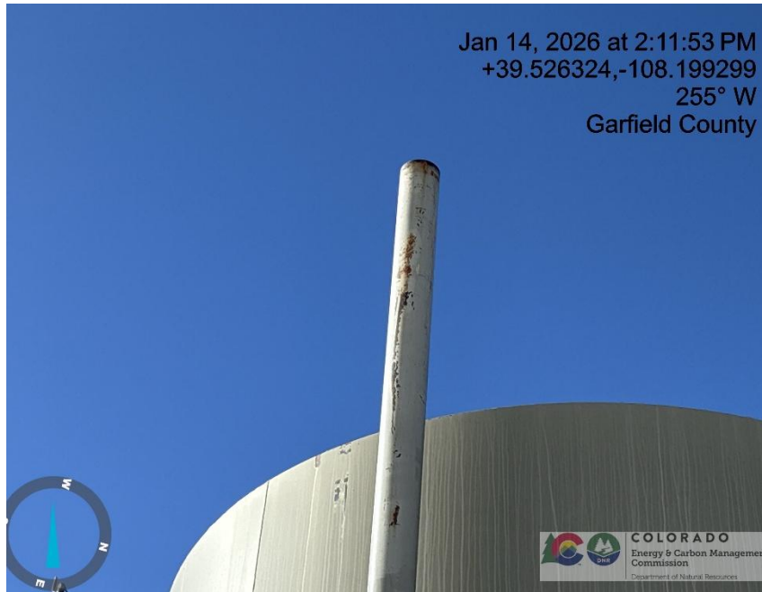
Photo # 1285 Burner exhaust stack on heated 400 bbl condensate tank lacks bird protection/wildlife hazard