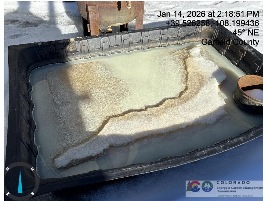
Photo # 1293 Plastic containment containing unknown fluid lacks wildlife protection/wildlife hazard