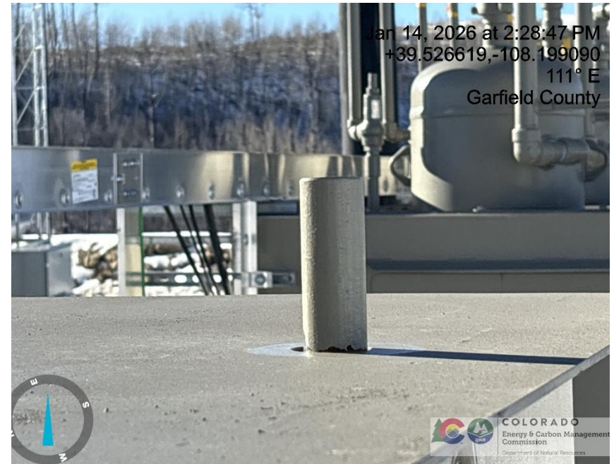
Photo # 1290 PRV vent line does not comply with CECMC pressure safety device rules (fuel gas supply pot on separator unit)