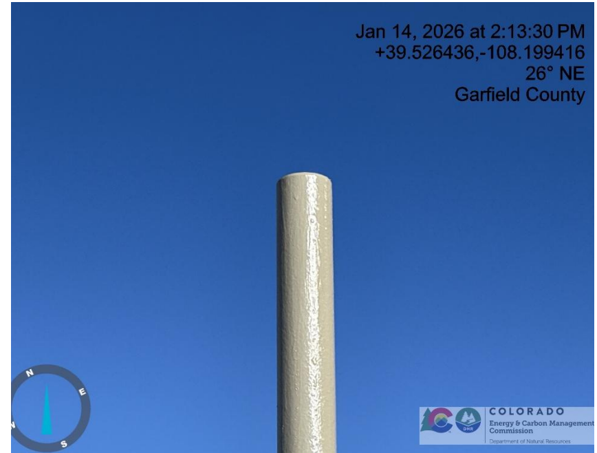
Photo # 1292 PRV vent line does not comply with CECMC pressure safety device rules