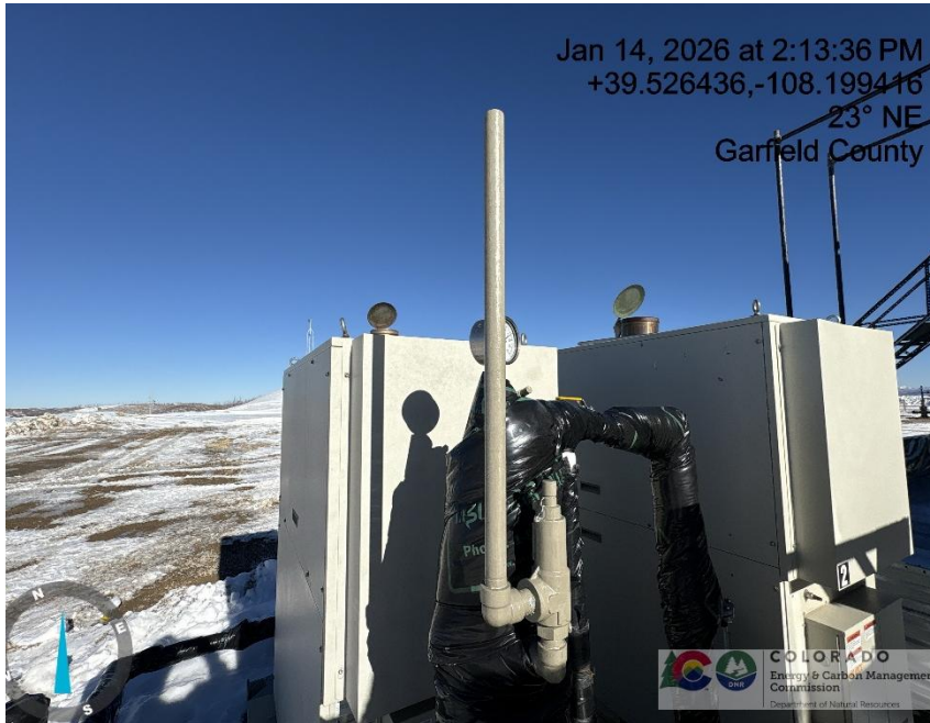
Photo # 1291 PRV vent line does not comply with CECMC pressure safety device rules