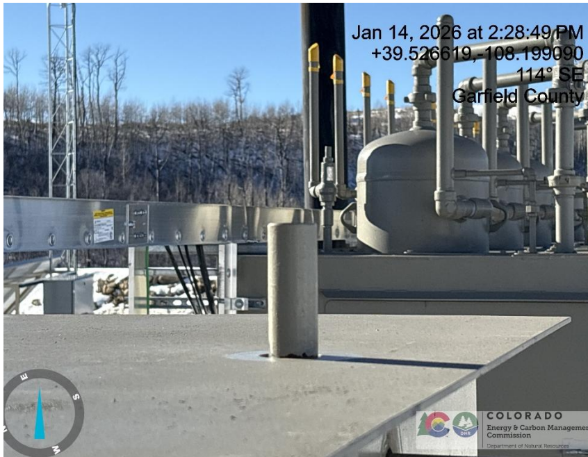
Photo # 1289 PRV vent line does not comply with CECMC pressure safety device rules (fuel gas supply pot on separator unit)