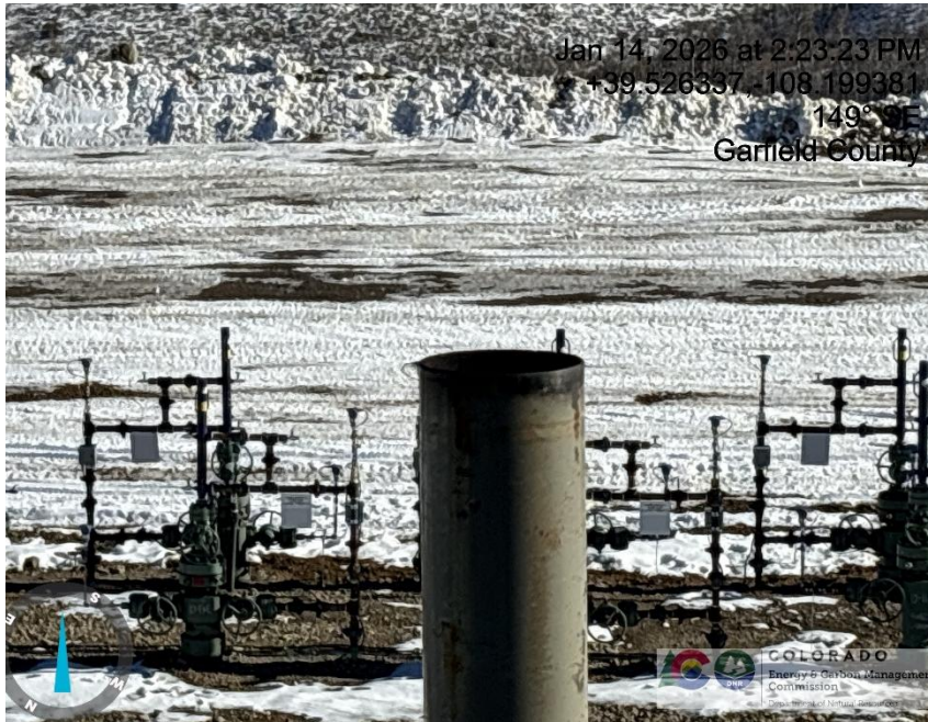
Photo # 1287 Burner exhaust stack on heated 400 bbl condensate tank lacks bird protection/wildlife hazard