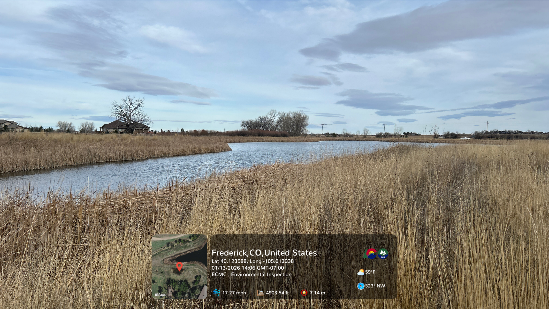
Looking at the pond adjacent to the location.