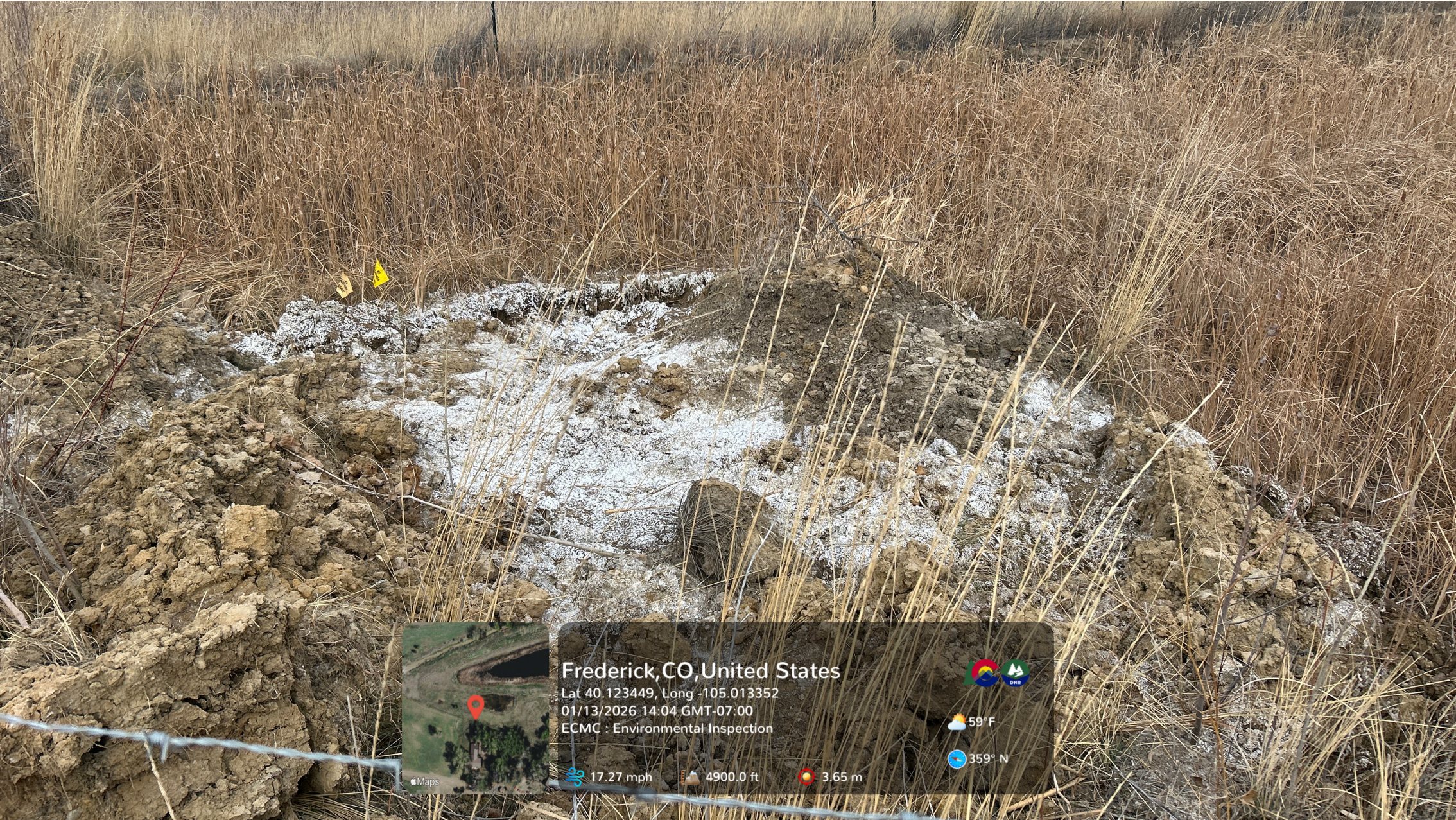
Salt crusting is visible within the excavation.