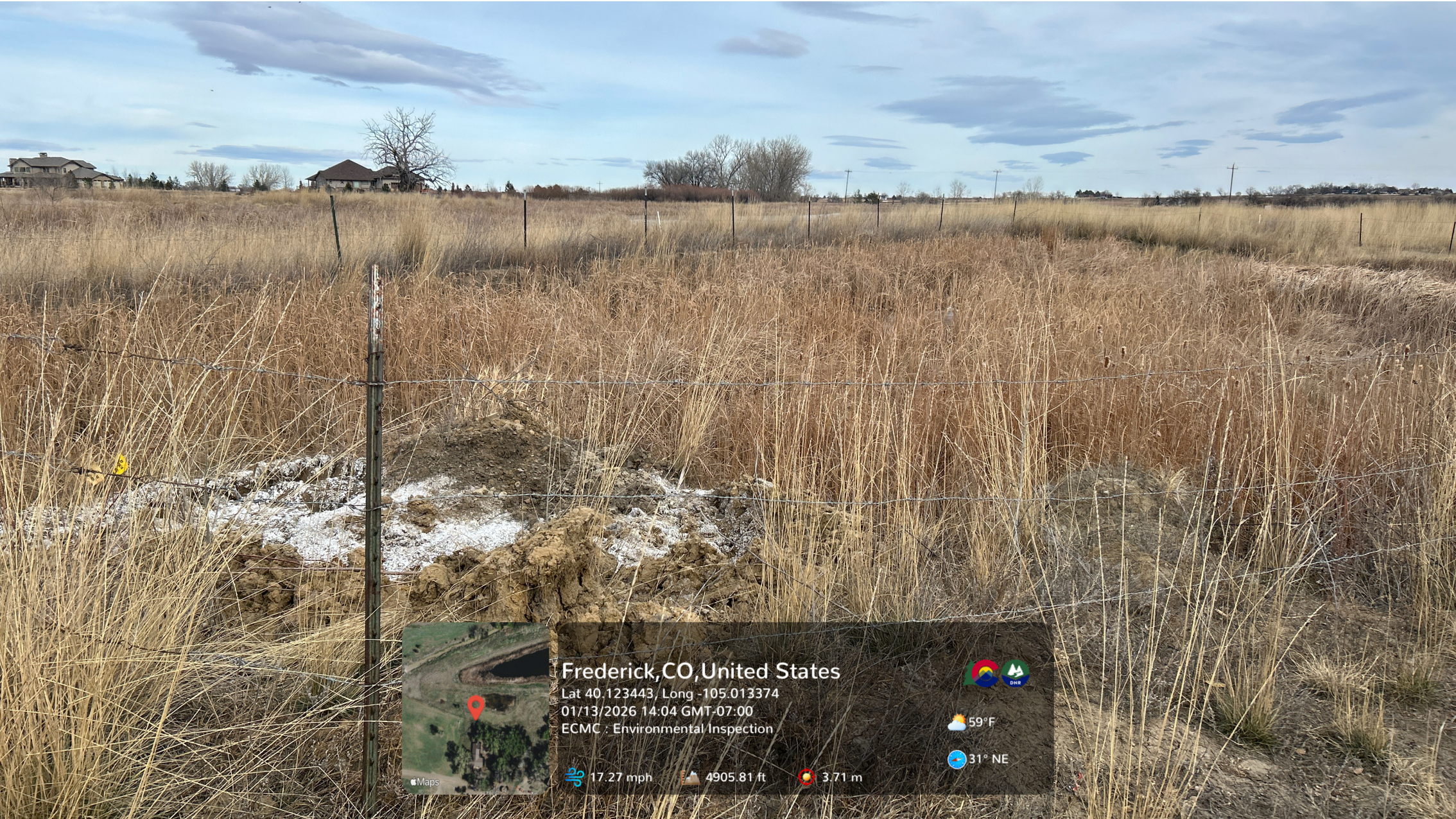
Looking at an open excavation at the location of Spill/Release Point ID 482194. Barbed wire fencing surrounds the excavation.