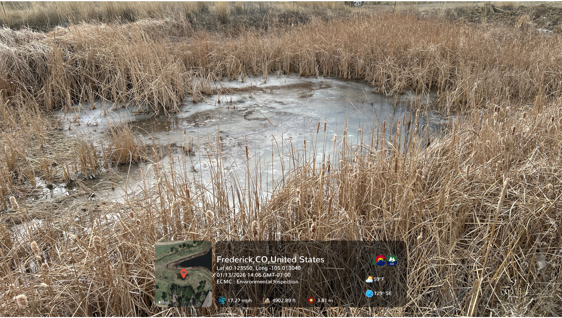
Looking at groundwater at the base of the excavation.