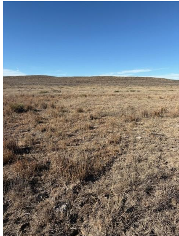
Photo 6. Middle of location facing W.