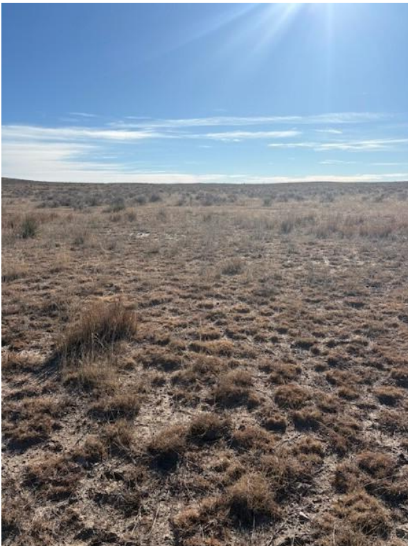
Photo 5. Middle of location facing S.