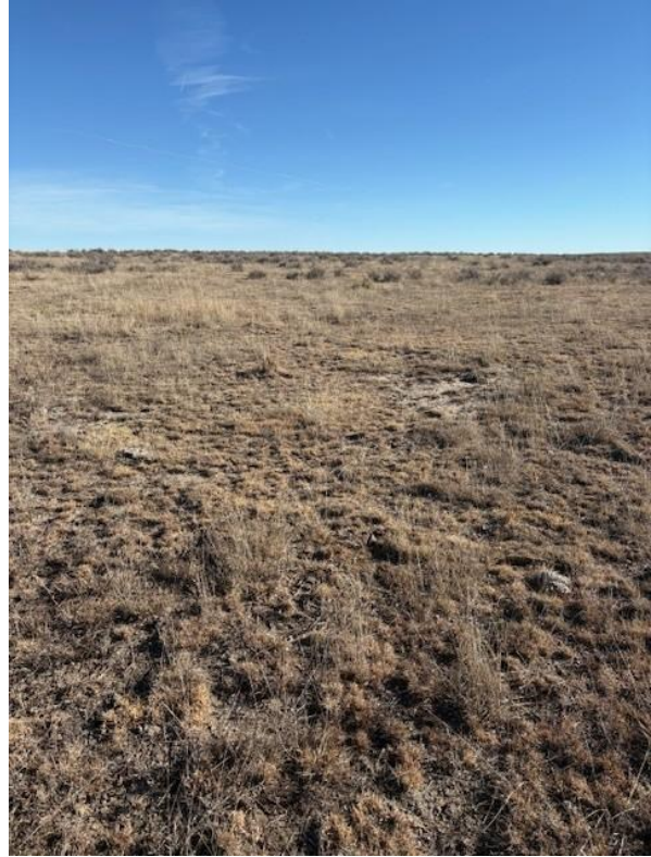
Photo 4. Middle of location facing E.