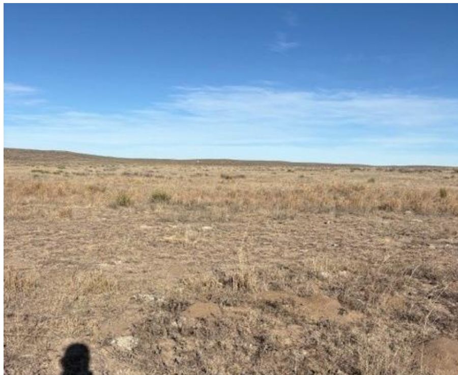
Photo 2. Photo from SW side of location facing NW showing progression of vegetation establishment at former separator location.