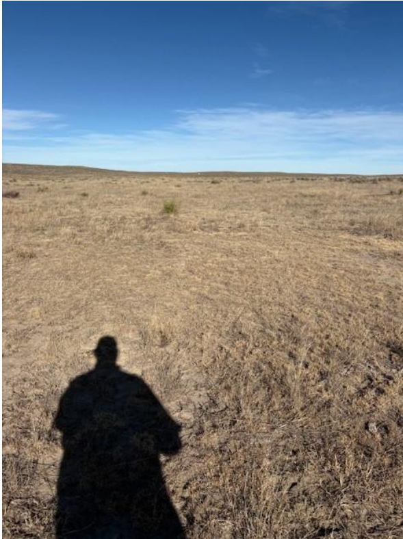
Photo 3. Middle of location facing N.