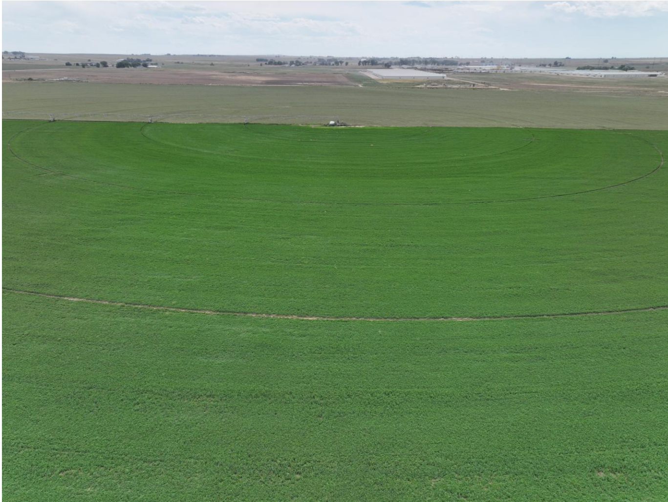
Photo 5. Drone aerial imagery taken north of well locations, facing south (displaying the wells).