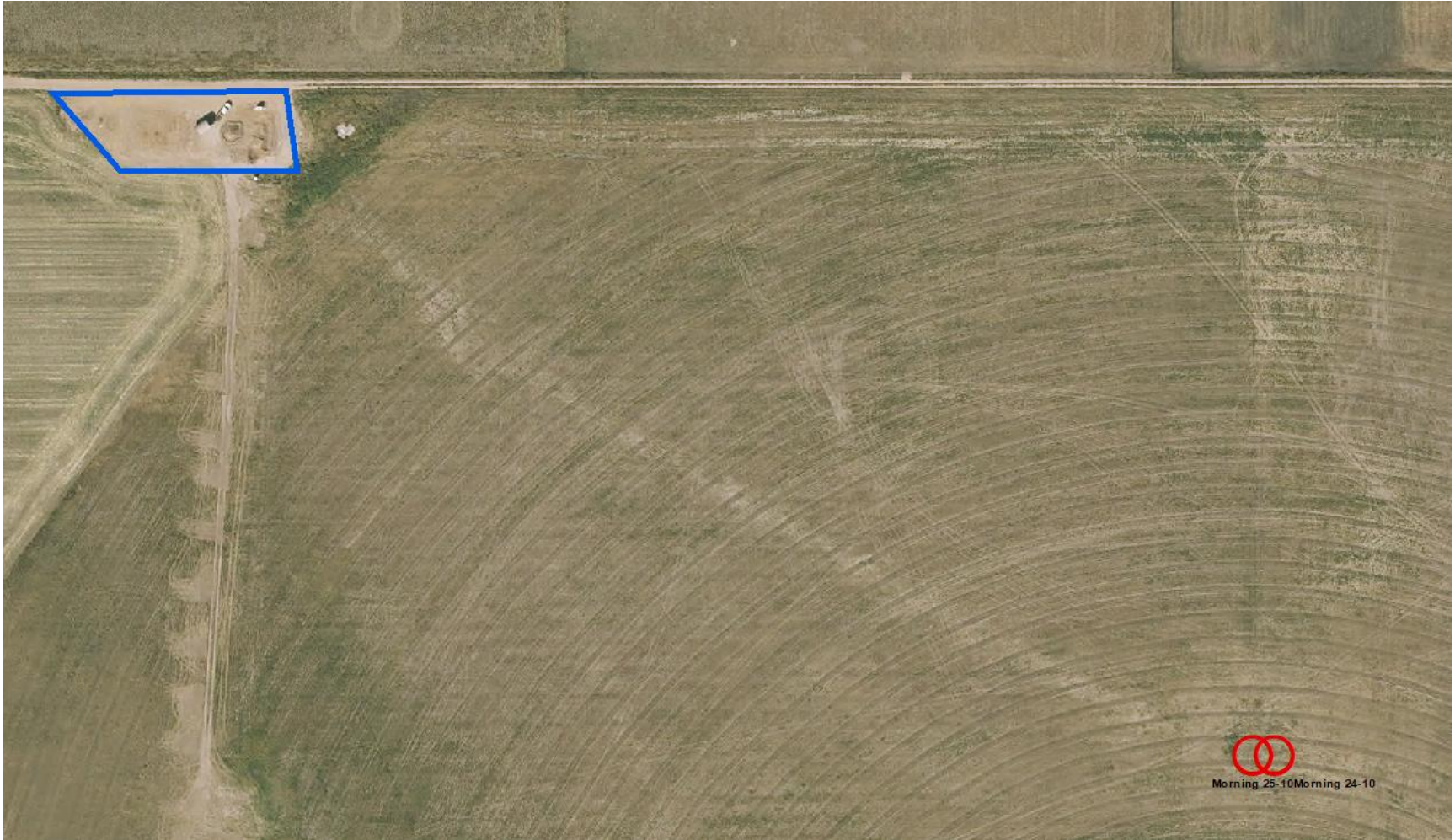
Photo 2. NAIP aerial imagery (2023) illustrating the well locations (red circles) and associated tank battery (blue polygon).