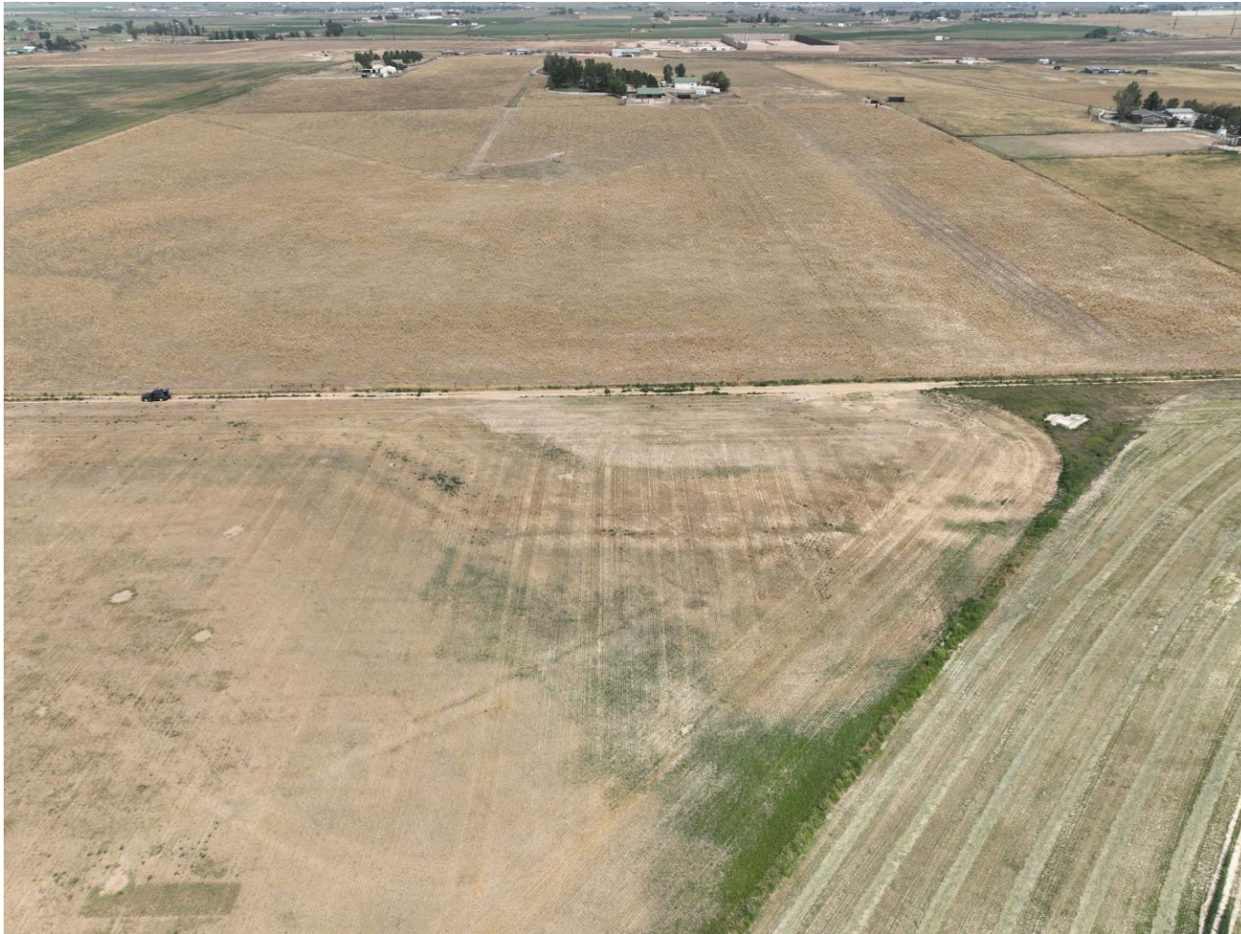
Photo 10. Drone aerial imagery taken south of the tank battery location, facing north (displaying the TB, access road, and wells).