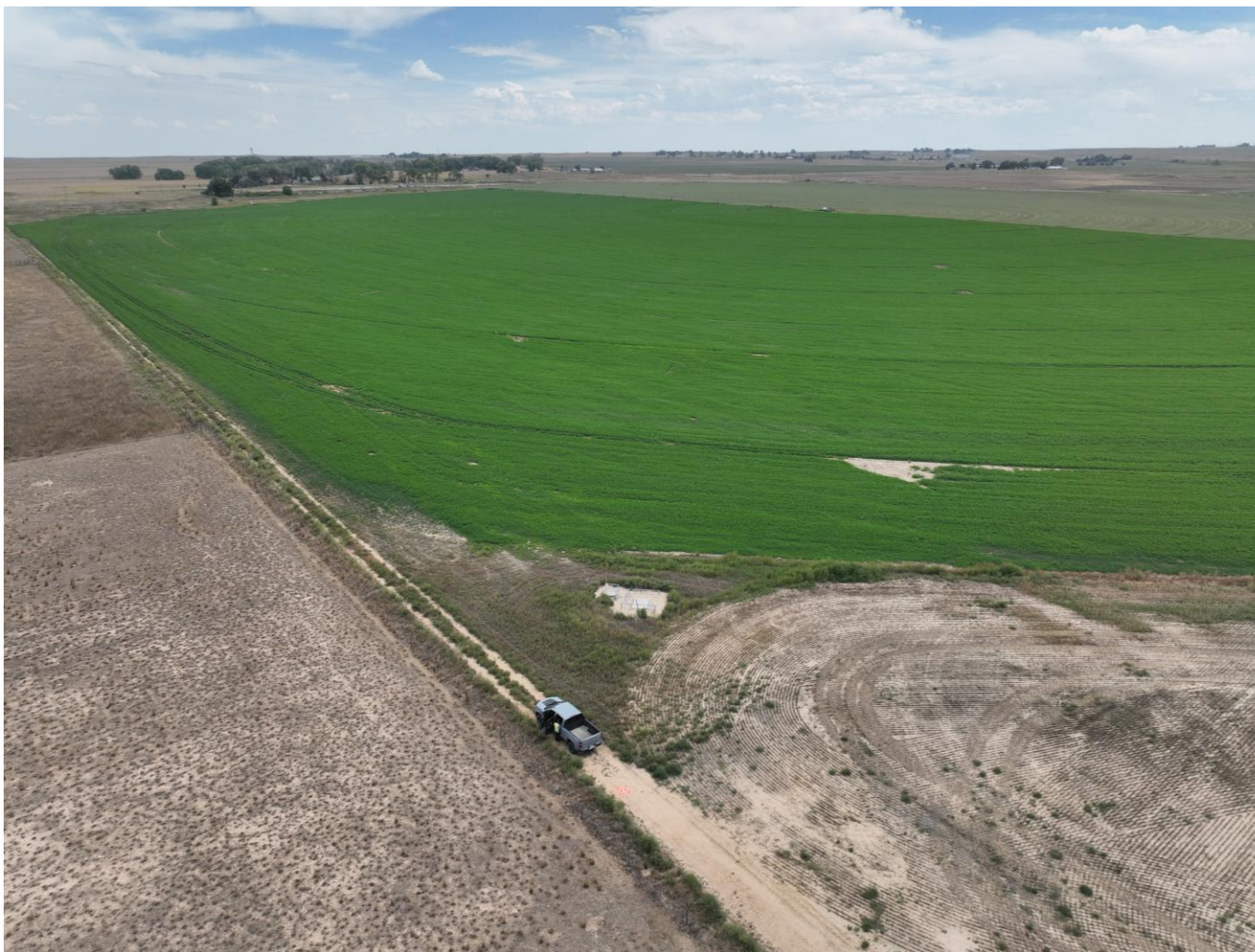
Photo 14. Drone aerial imagery taken northwest of the tank battery location, facing southeast (displaying part of the TB and presumed flowline).