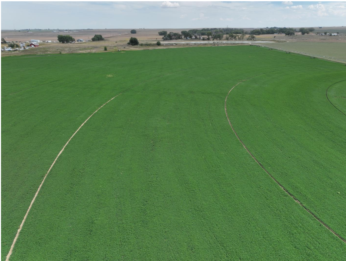
Photo 4. Drone aerial imagery taken west of well locations, facing east (displaying the wells).