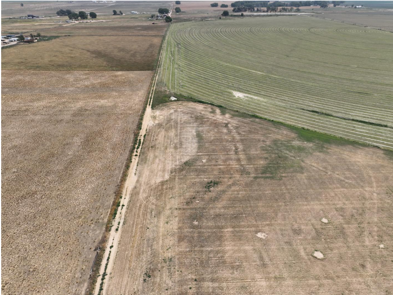
Photo 11. Drone aerial imagery taken west of the tank battery location, facing east (displaying TB).