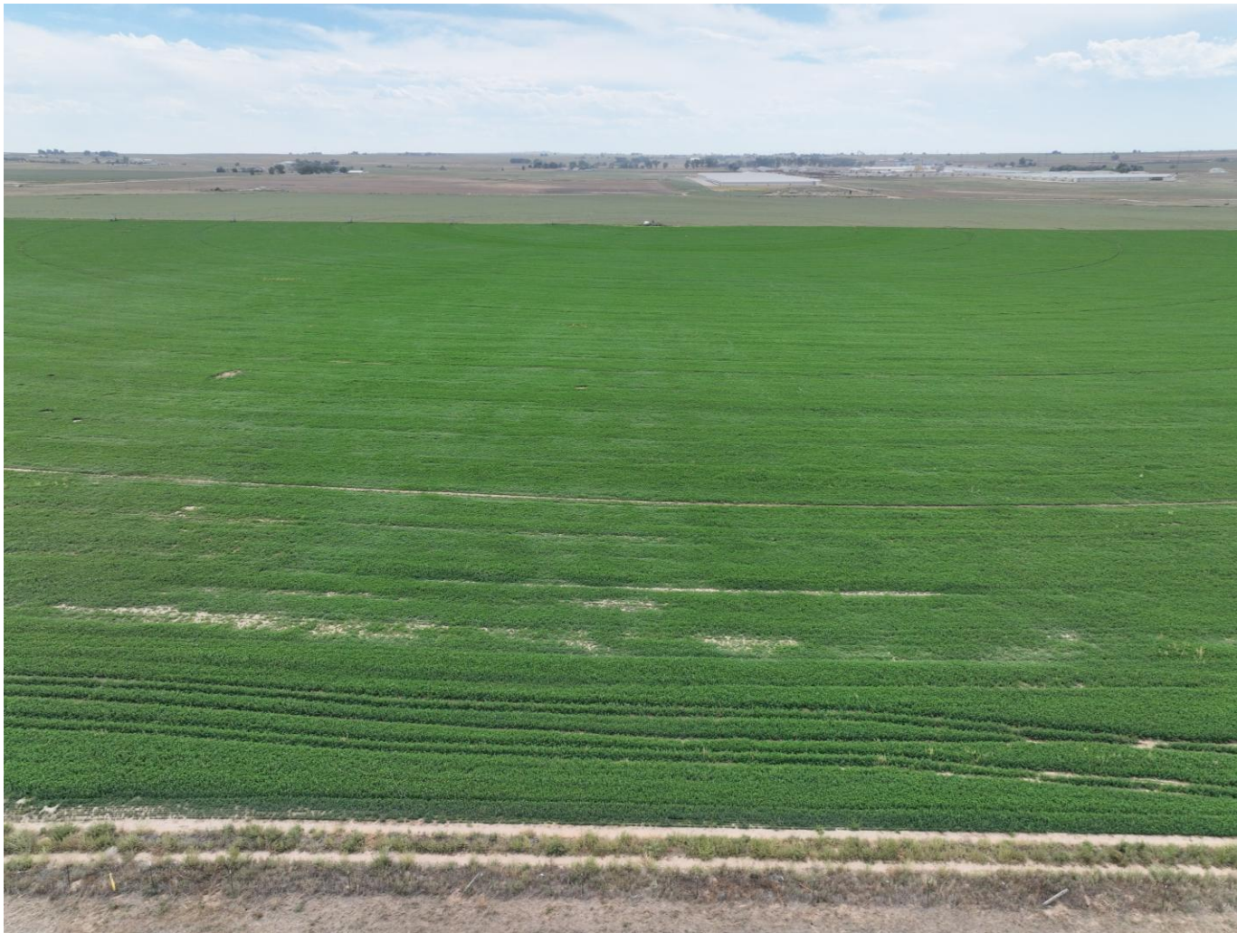
Photo 9. Drone aerial imagery taken north of well access road takeoff, facing south (displaying the well access road and wells).