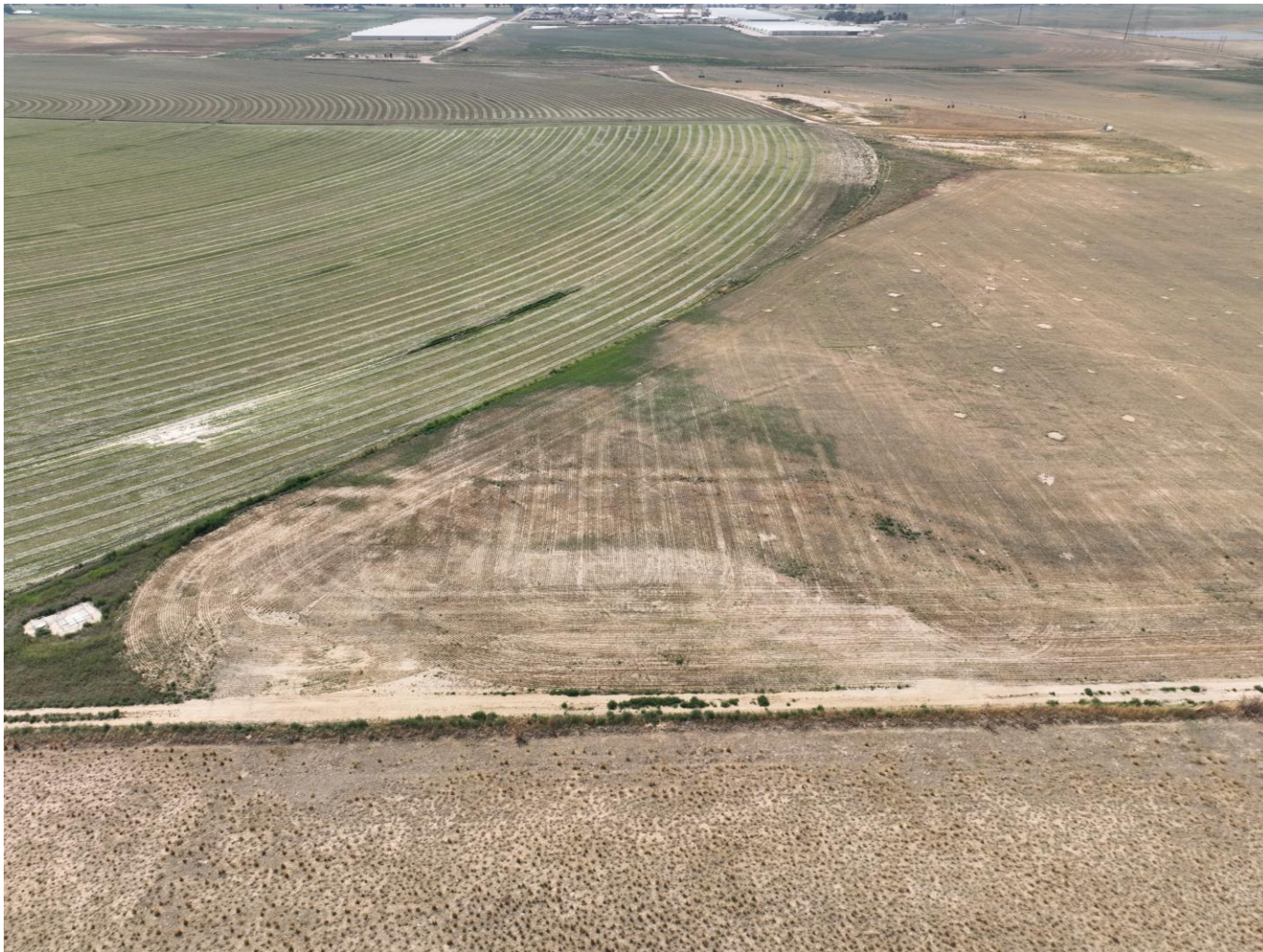
Photo 12. Drone aerial imagery taken north of the tank battery location, facing south (displaying the TB).