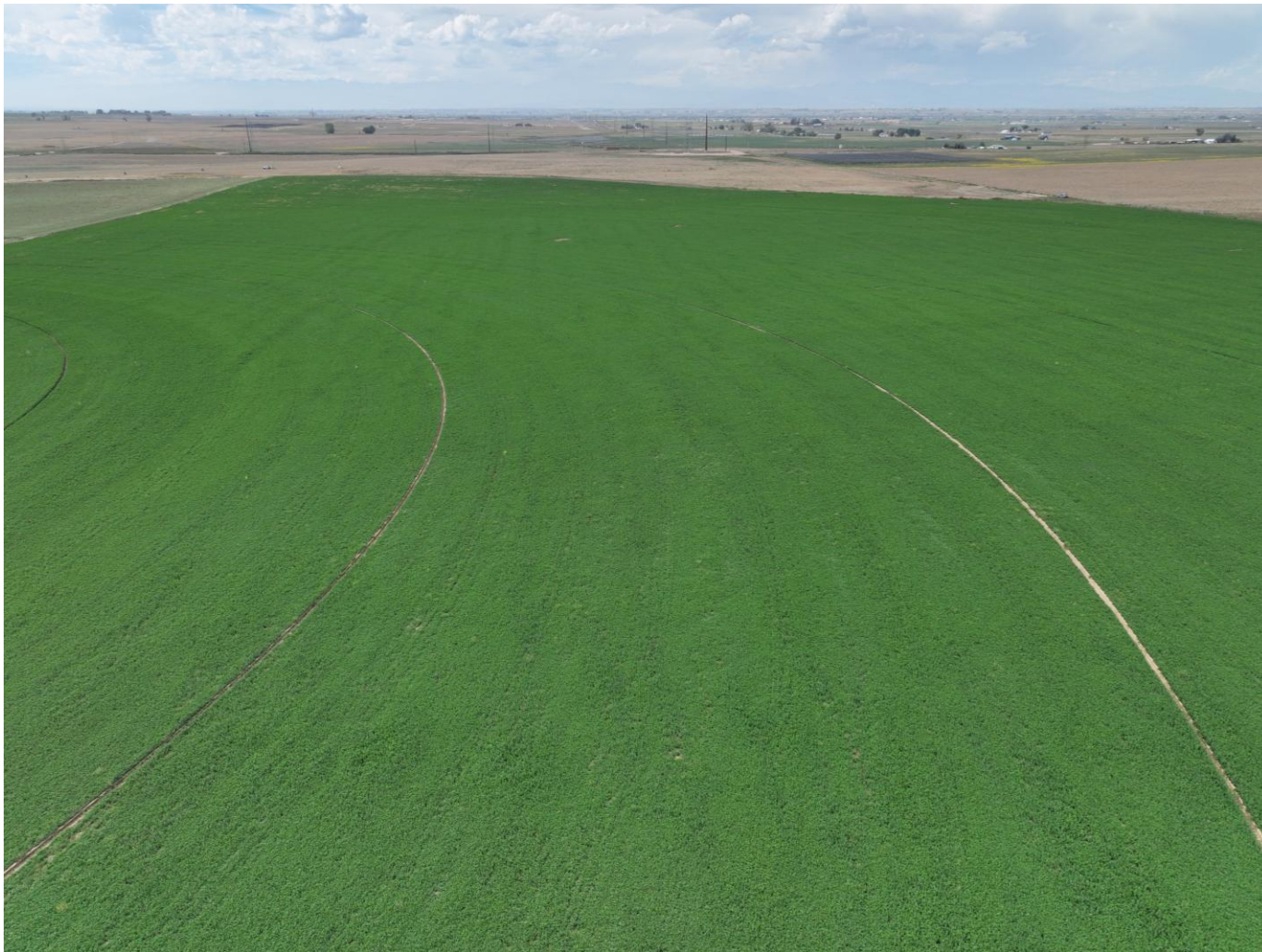
Photo 6. Drone aerial imagery taken east of well locations, facing west (displaying the wells).