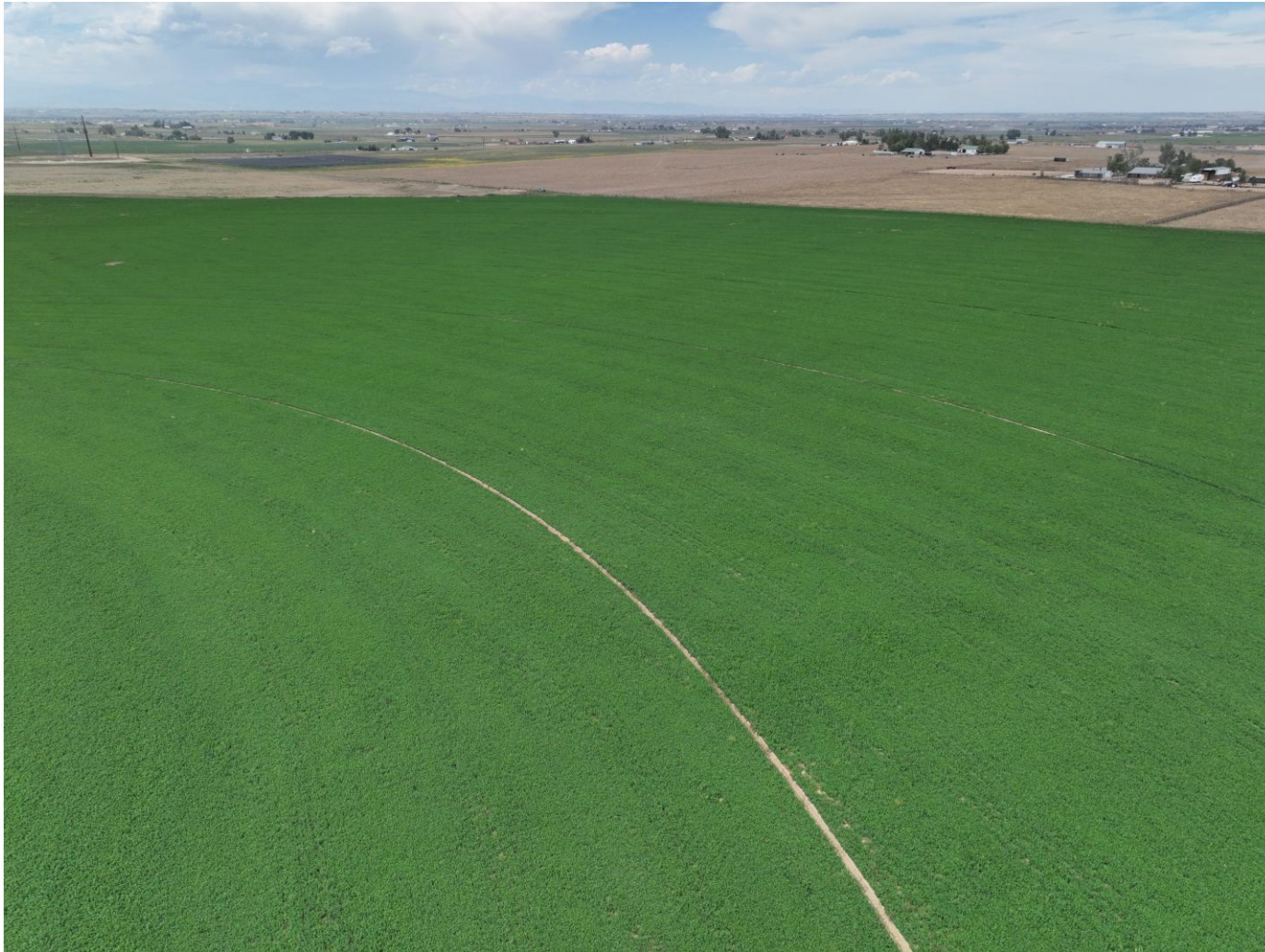
Photo 3. Drone aerial imagery taken south of well locations, facing north (displaying the wells and access road). Crop vegetation at the well pad and access road appears consistent with adjacent reference areas.