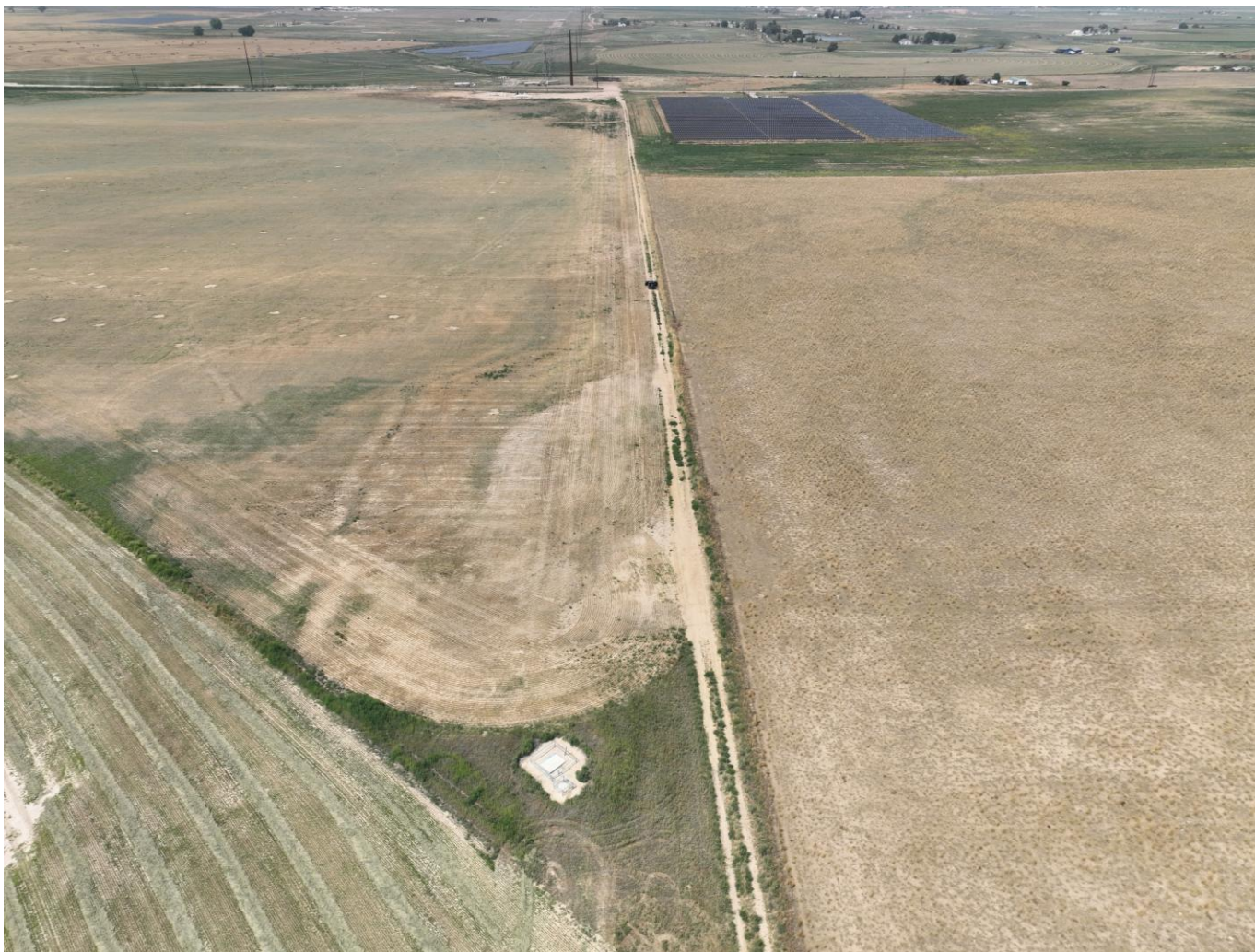
Photo 13. Drone aerial imagery taken east of the tank battery location, facing west (displaying the TB). Note: tank battery falls in a corner crop area with was recently harvested.