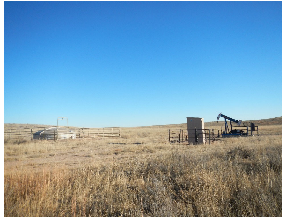
4. Well location overview.