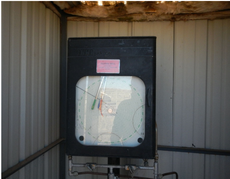
3. Gas Meter inside Meter Shed.