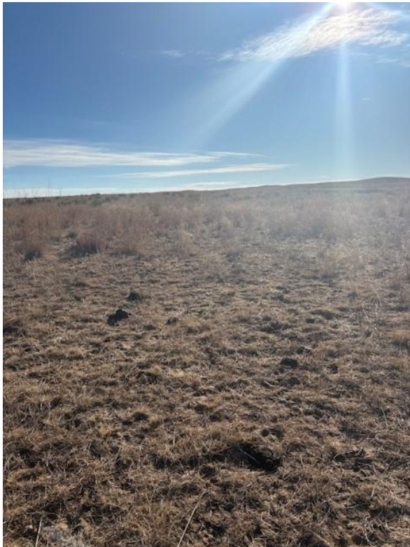
Photo 6. Middle of location facing S.