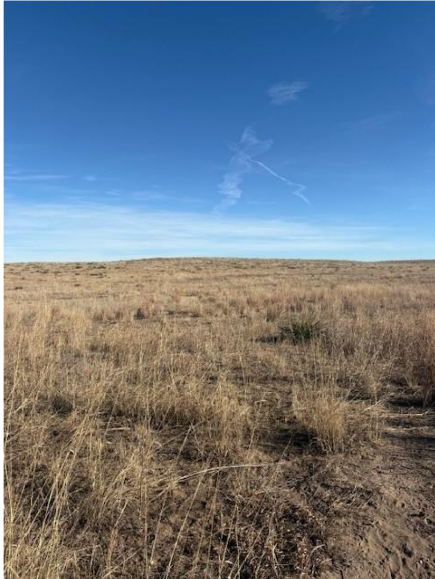
Photo 8. Reference area west of location.