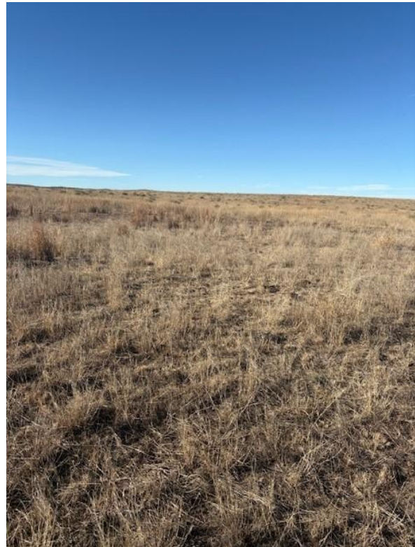
Photo 7. Middle of location facing W.