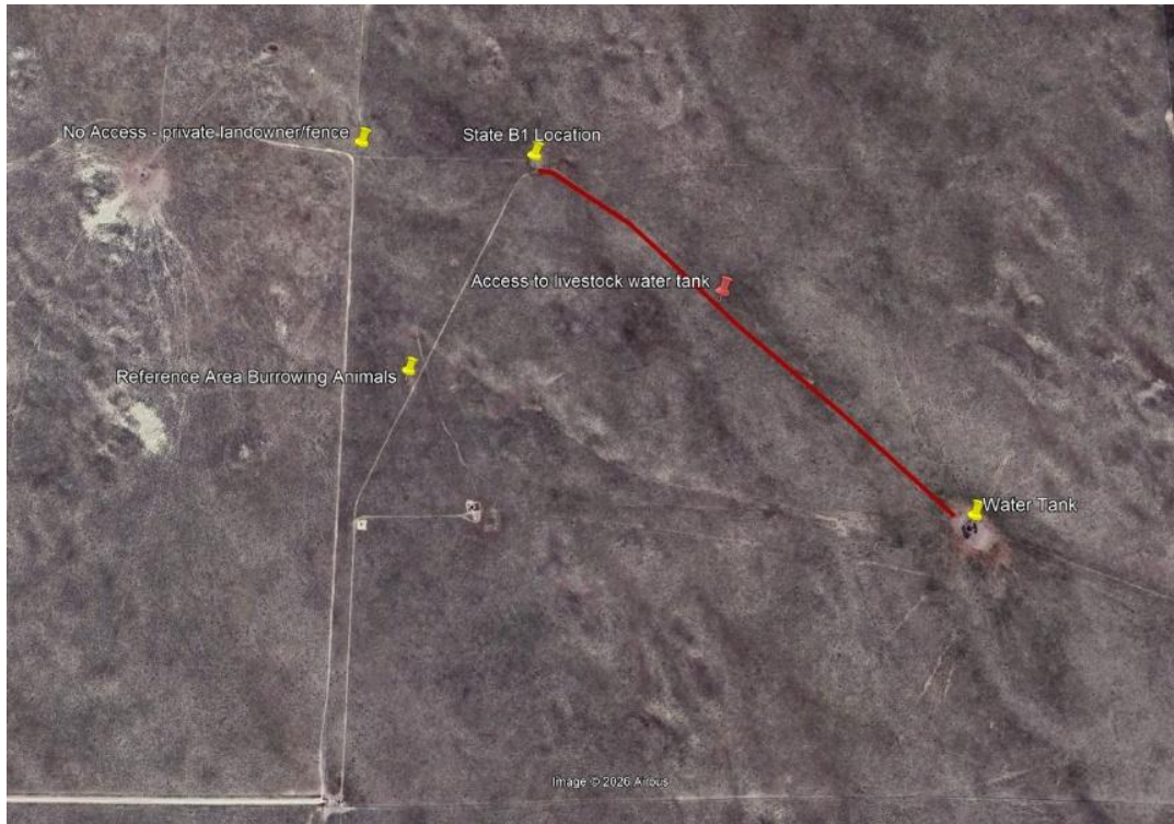
Photo 1. Map showing extended access road to water tank and no access from adjacent property to the west.