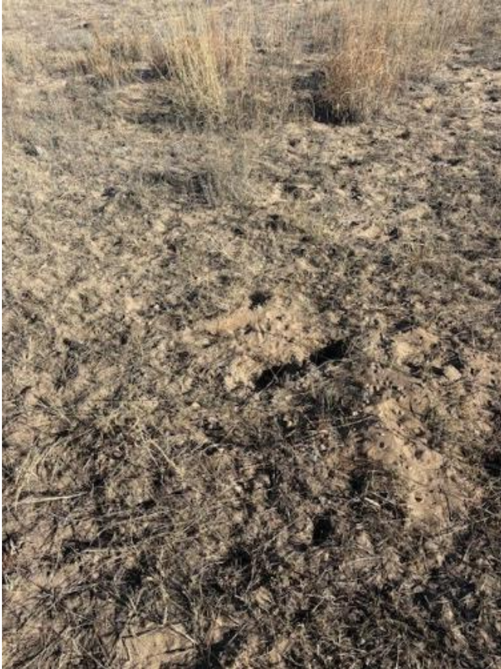
Photo 3. Reference area south of the location showing burrowing animal disturbance creating bare soils. Photo taken at lat/long 39.9383, -102.8575.