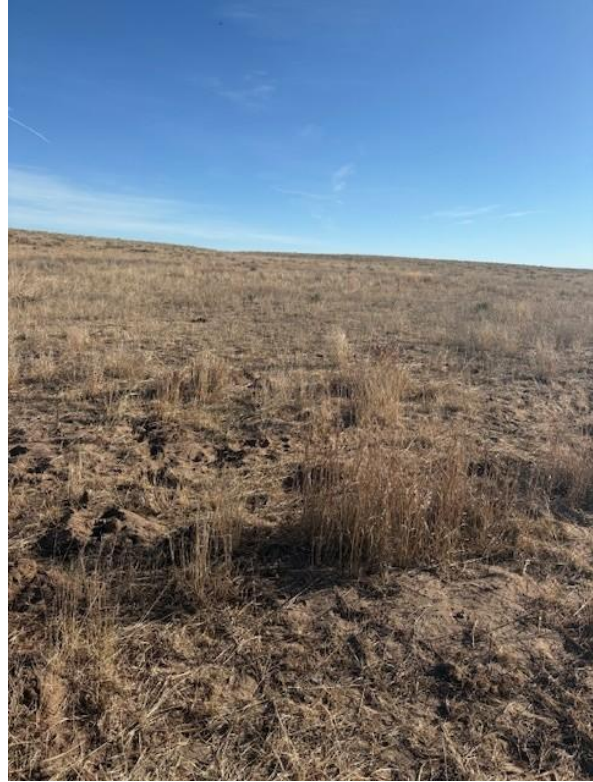
Photo 5. Middle of location facing E.