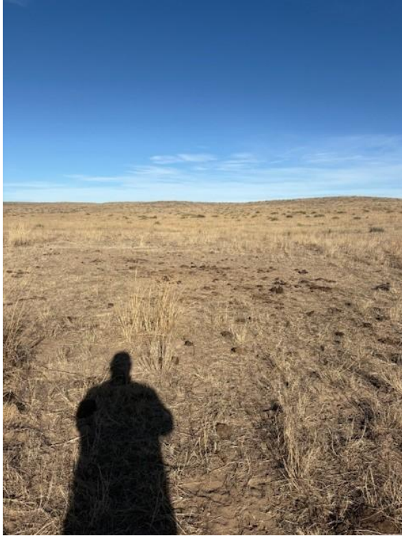
Photo 4. Middle of location facing N.