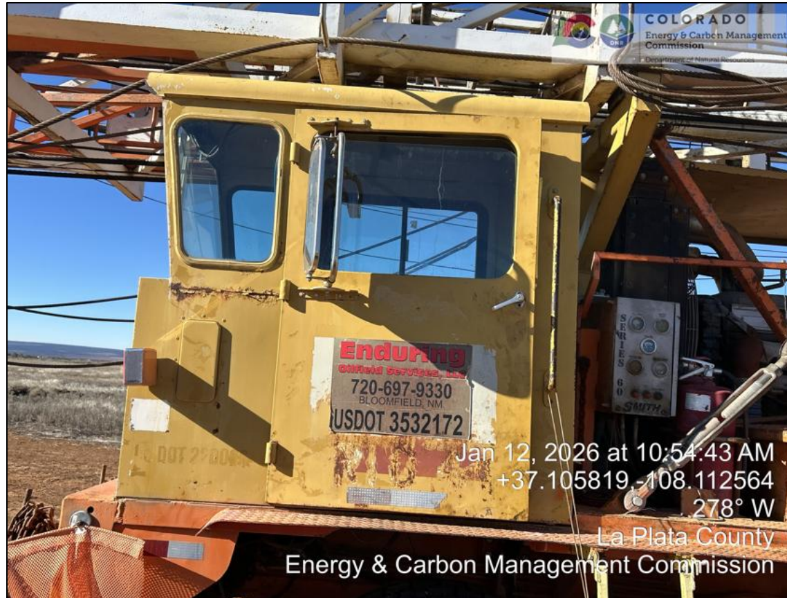
05) Sign on drill rig: “Enduring Oilfield Services, LLC. 720-697-9330 Bloomfield, NM USDOT 3532172.”