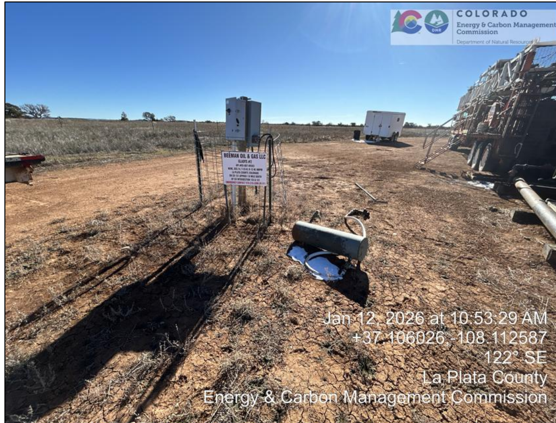
02) Well sign next to electrical control box. Unused, detached dehydrator is on ground. White box trailer and drill rig on right.

Inspector Name: James Blair Inspection Date: 01/09/2026