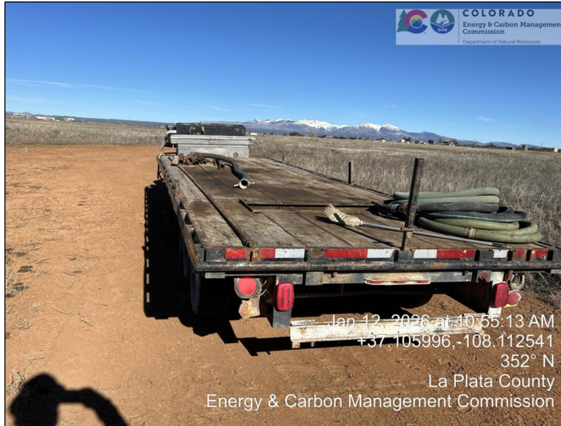
11) Flat bed utility trailer.