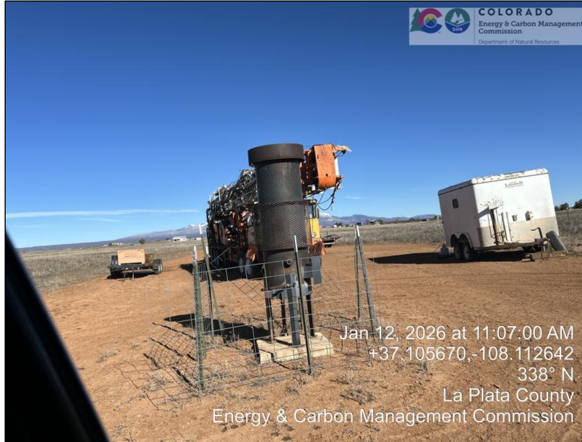
07) Combustor for Gladys 2 in front center of photo

Inspection Photos Location Name: Beeman Gladys #2 API # 05-067-09363 Inspector Name: James Blair Inspection Date: 01/09/2026