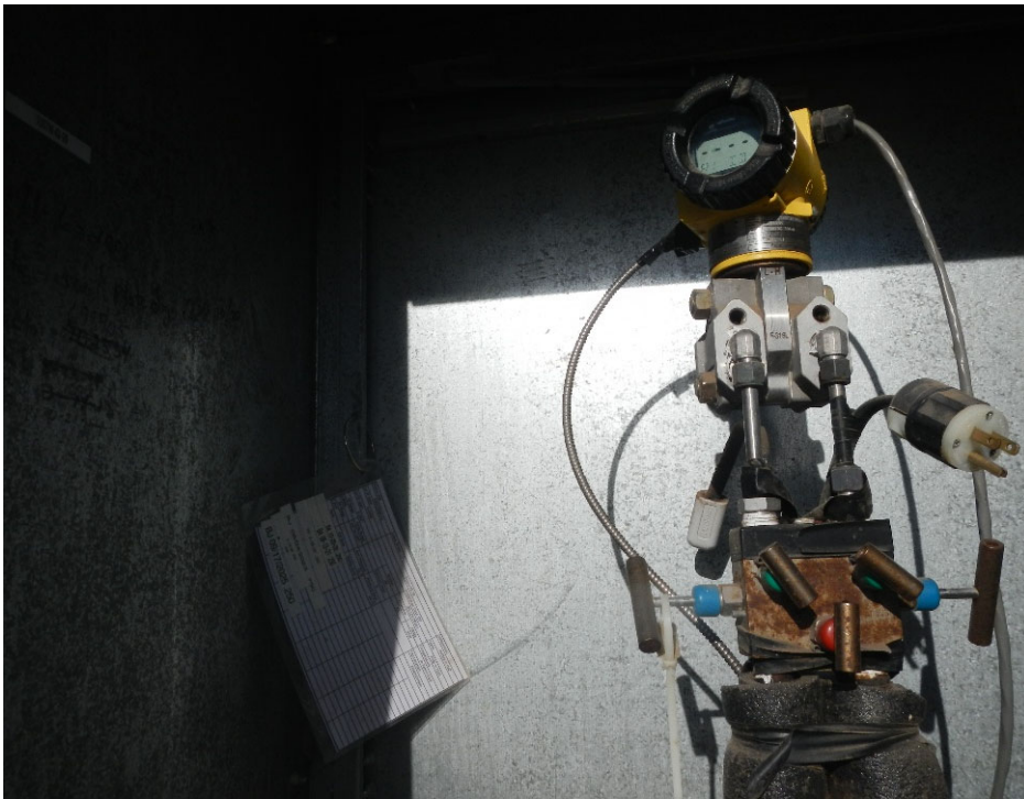
3. Gas Meter inside Flowline mounted Meter Box.