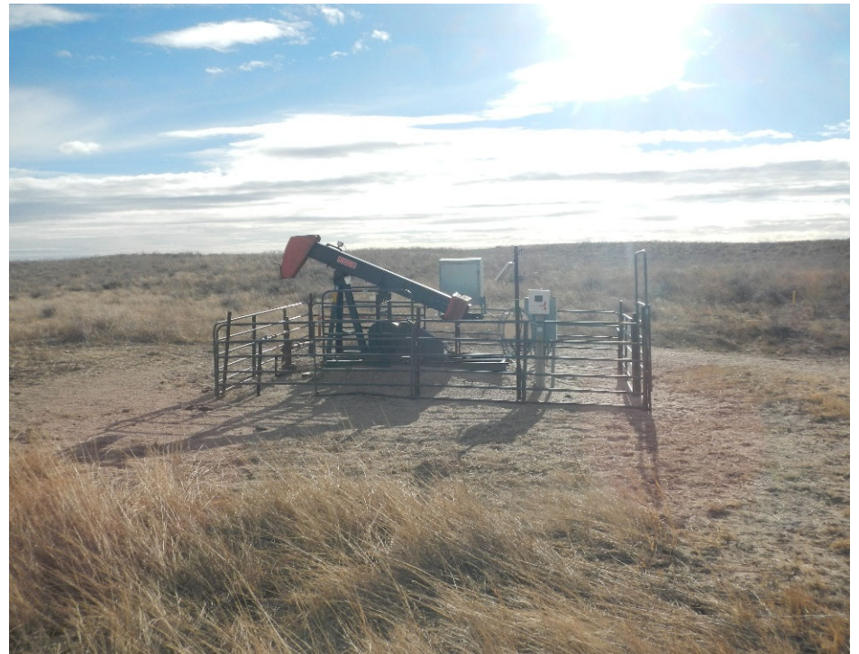
4. Well location overview.