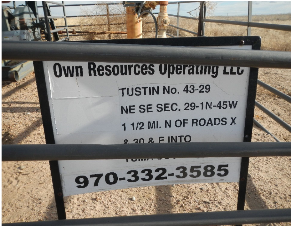
1. Lease sign at well location.