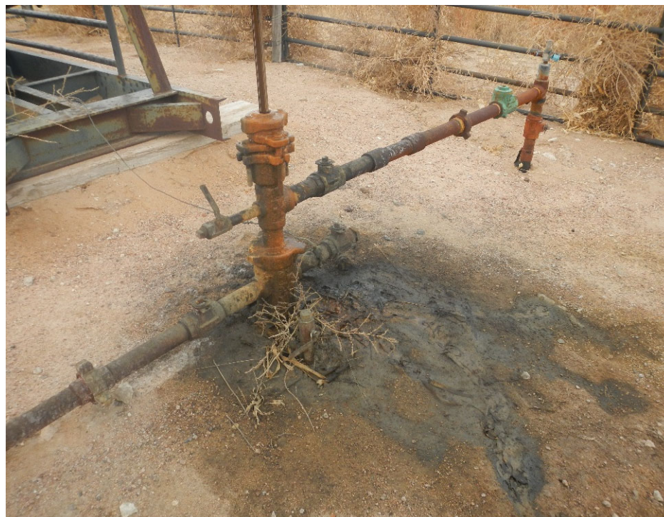
2. View of wellhead. Well was discovered leaking at packing. Leak has been repaired . Lease Operator will clean up and turn soil around wellhead.