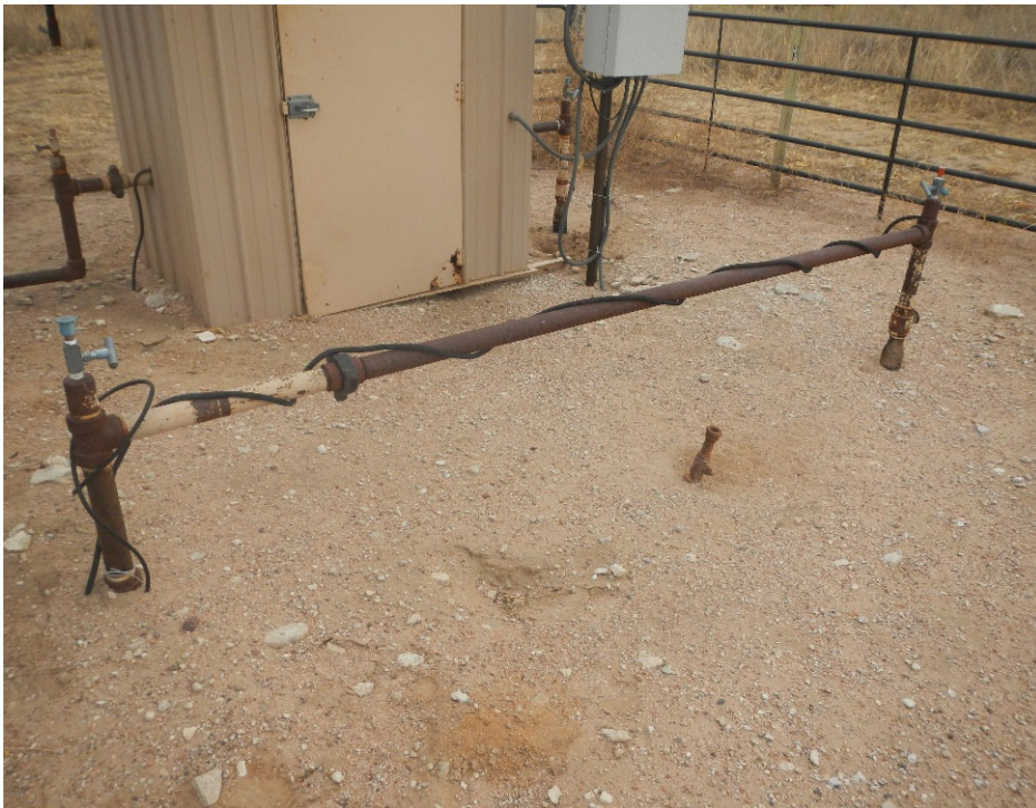
3. View of flowline risers at well location. Note open ended valve.