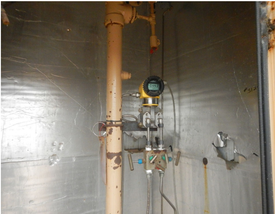
5. Gas Meter inside Meter Shed.