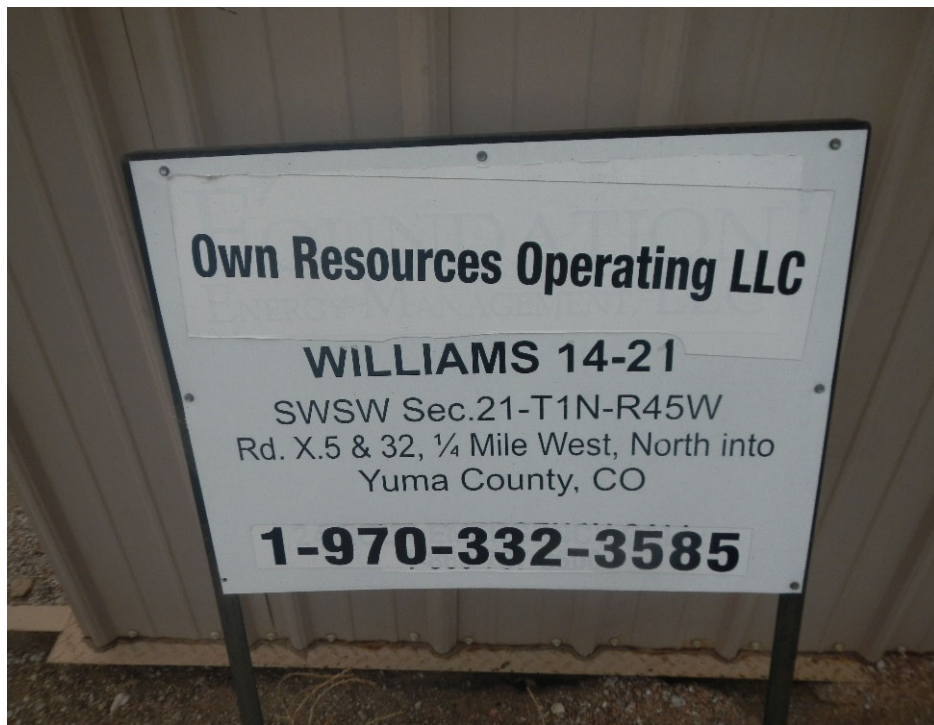
1. Lease sign at well location.