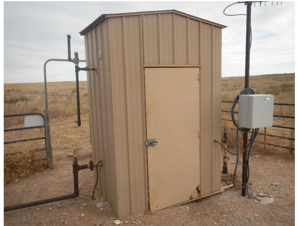
4. View of Separator/Meter Shed at well location.