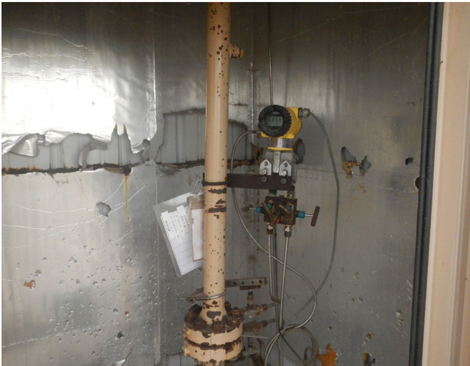
3. Gas Meter inside Meter Shed.