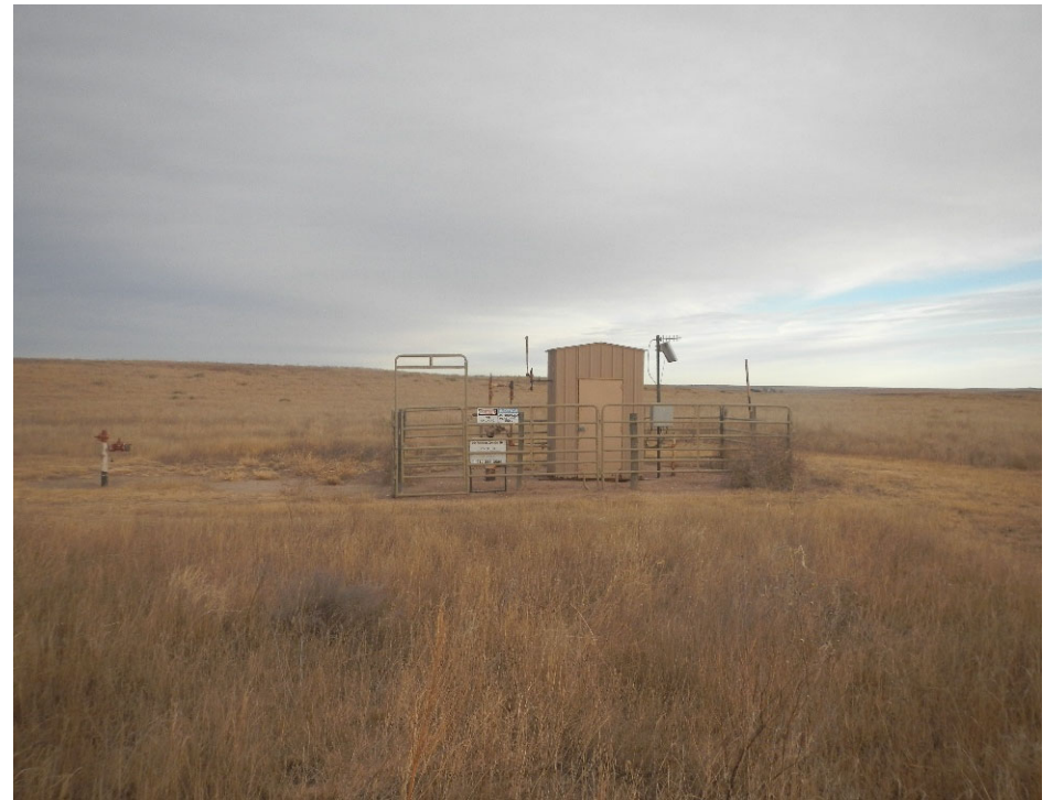
4. Well location overview.