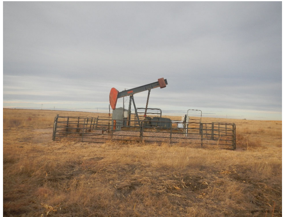
4. Well location overview.