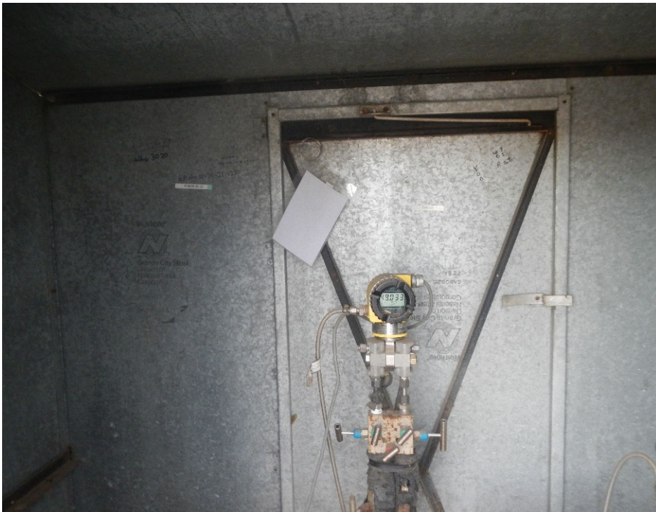
3. Gas Meter inside Meter Shed.