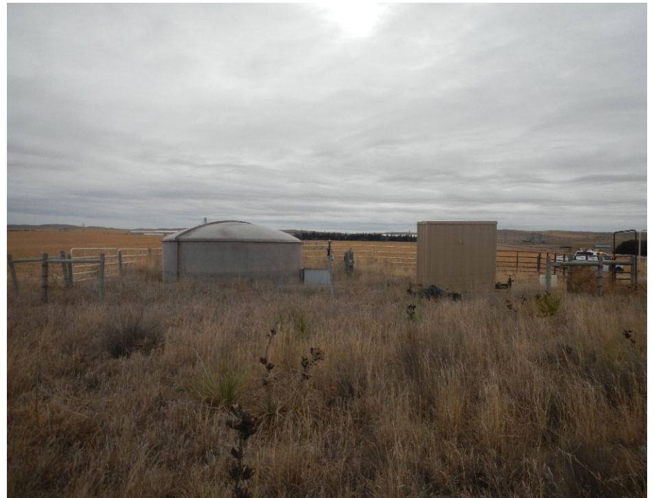
12. Production facility looking south.