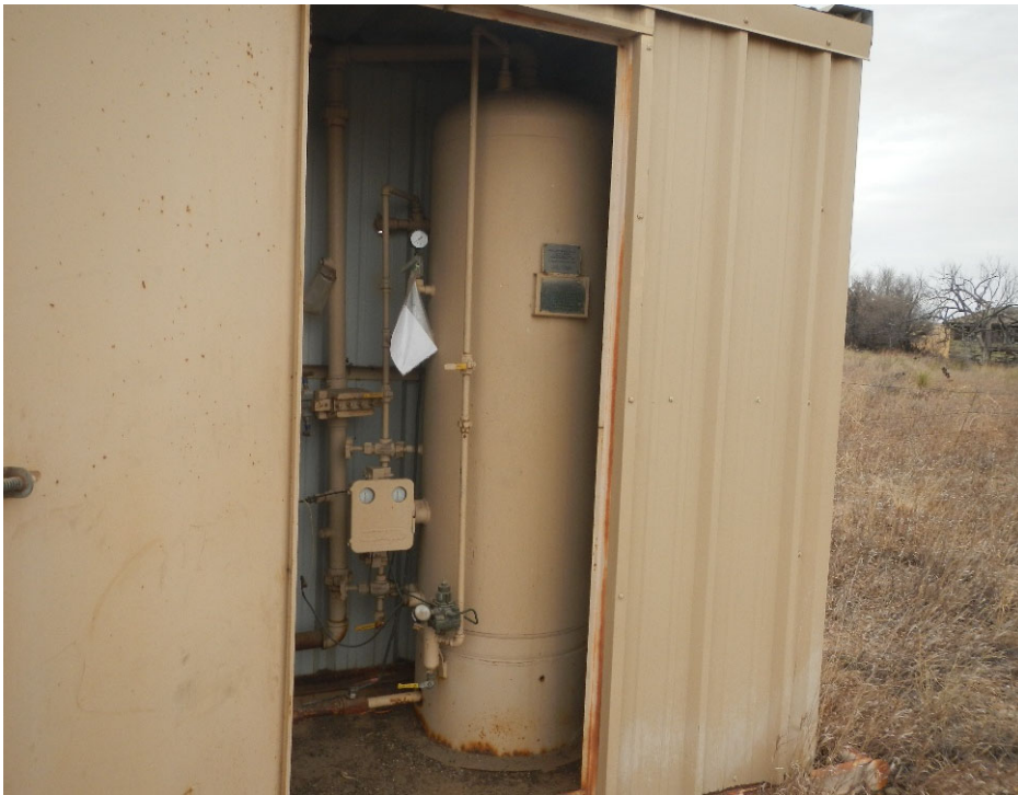
7. 2-Phase separator.