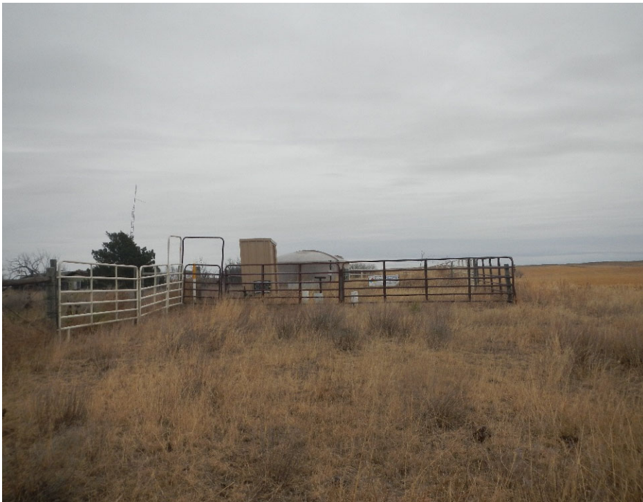
11. Production facility looking east.