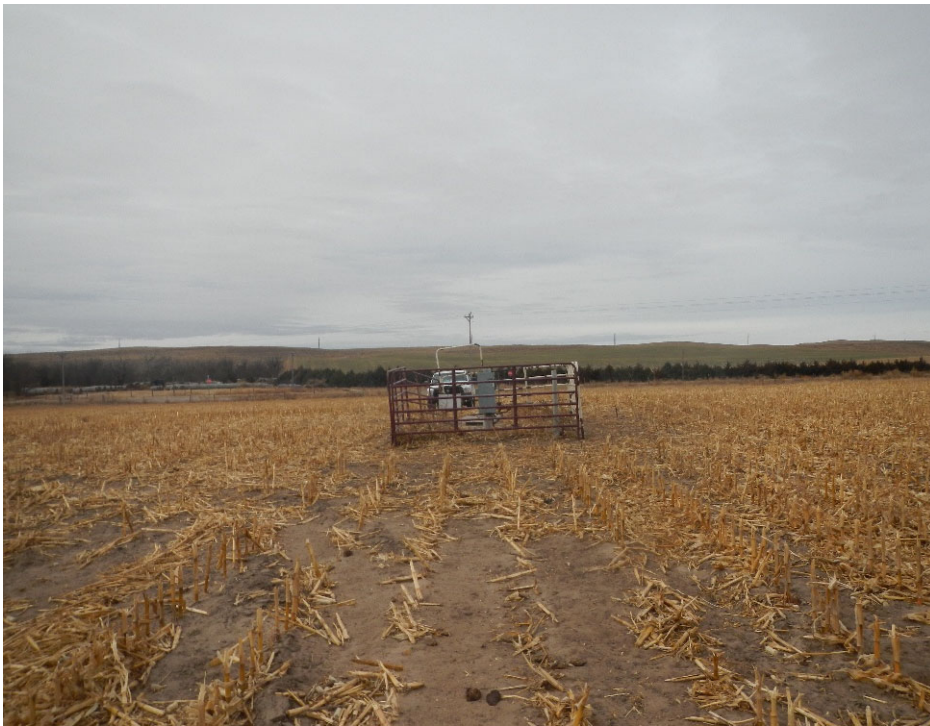
5. View looking west towards wellhead location.