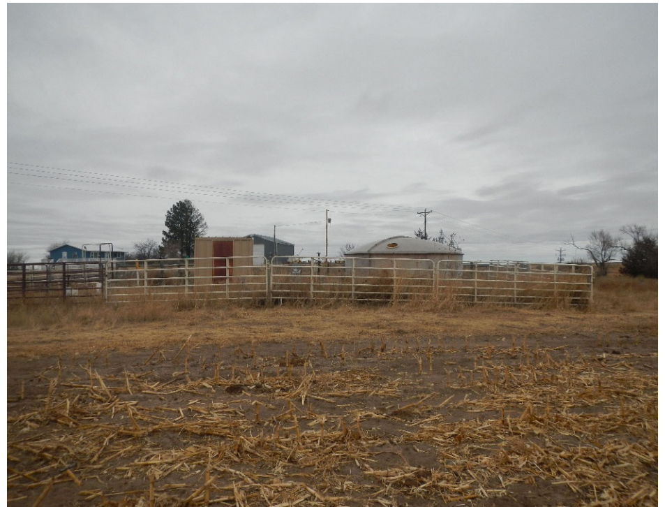
14. Production facility looking north.