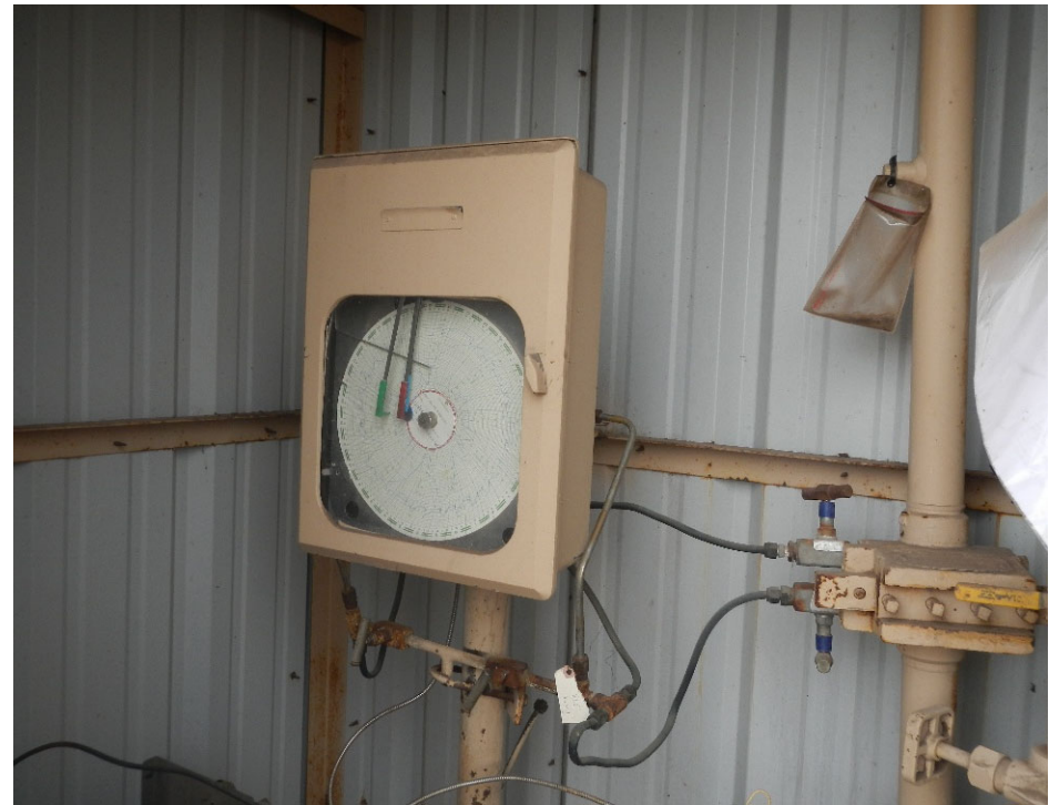
8. Chart Recorder.