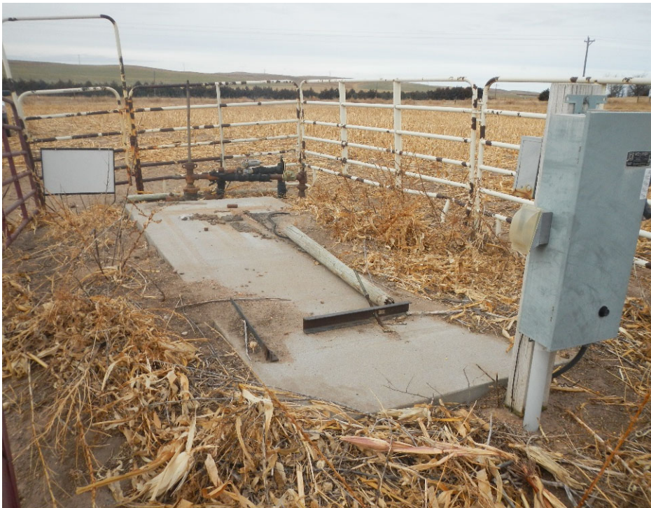
3. View looking inside of wellhead fencing.