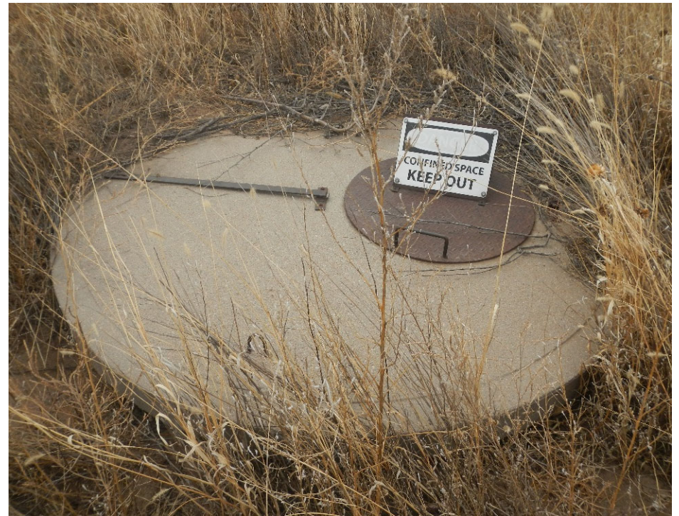
10. Concrete vault containing water transfer pump.