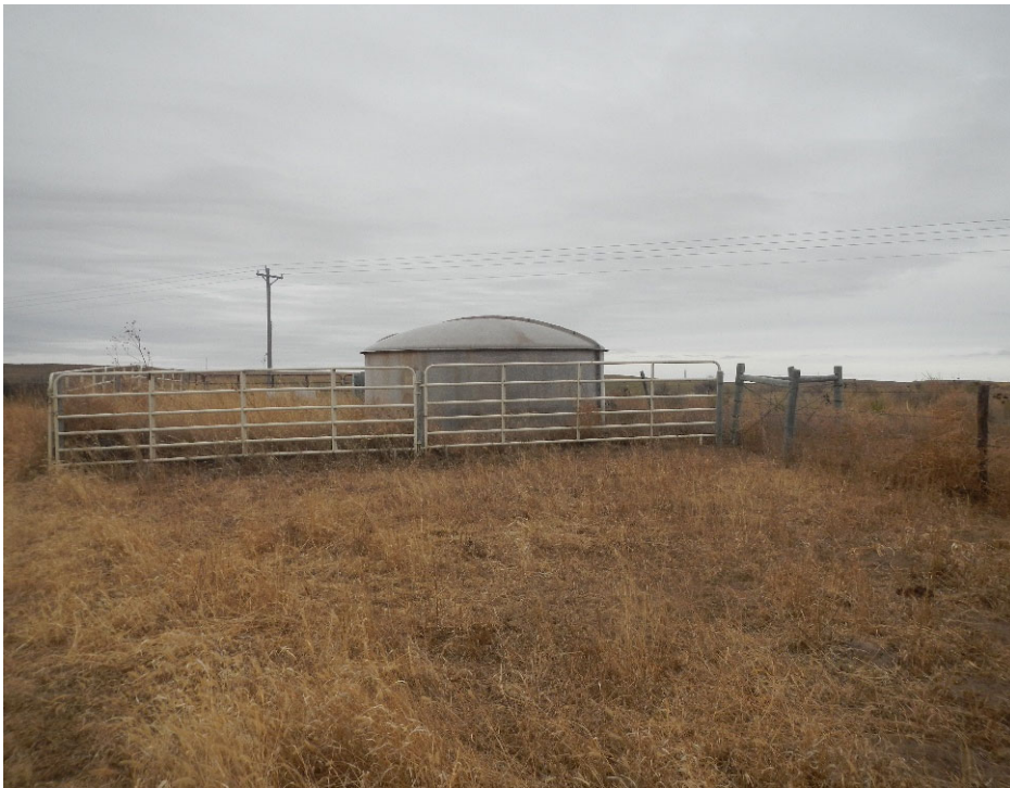
13. Production facility looking west.