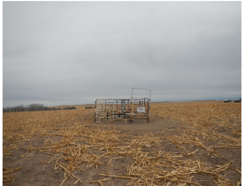
4. View looking east towards wellhead location.