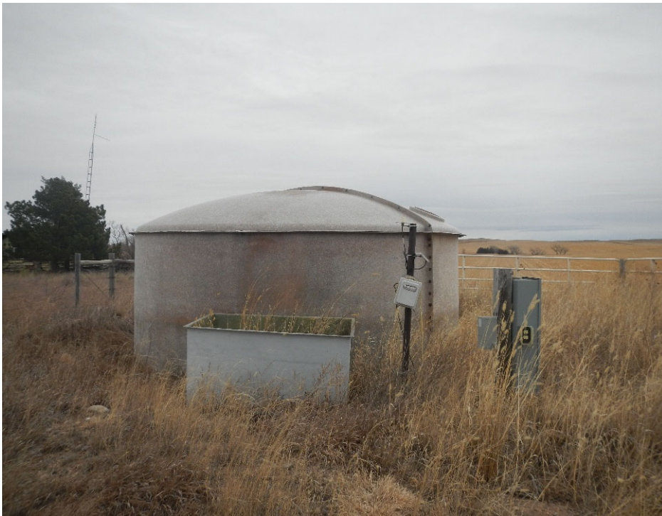
9. View of produced water tank at remote production location.