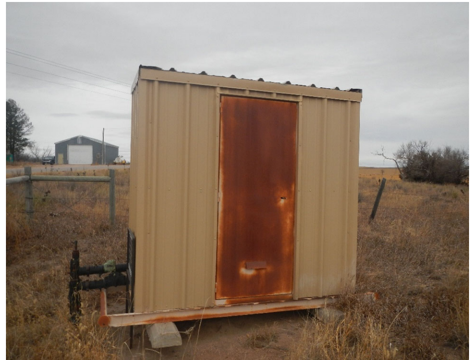
6. Steel separator/meter shed at production facility.