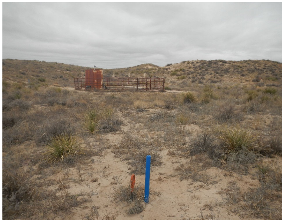
10. View of well location looking northwest from anchor.