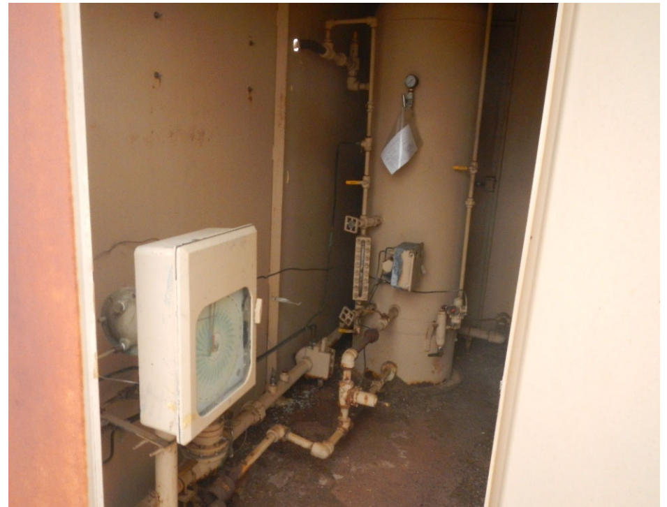
8. Chart Recorder.