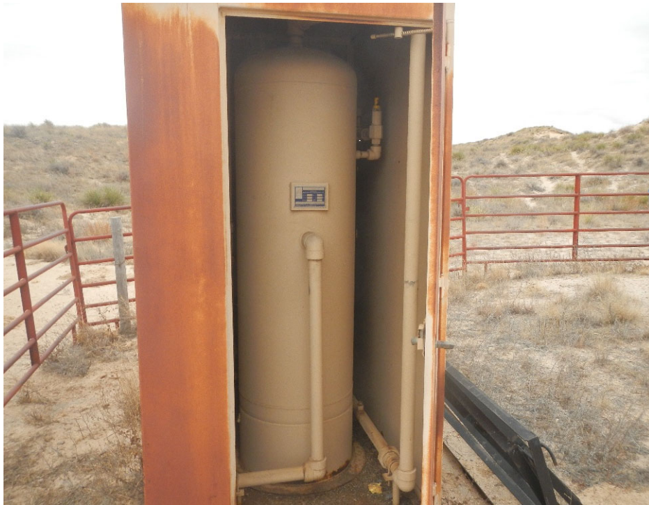
7. Vertical 2-Phase Separator.