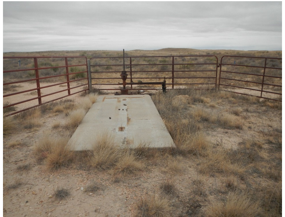
4. View cement pad inside of wellhead fencing.