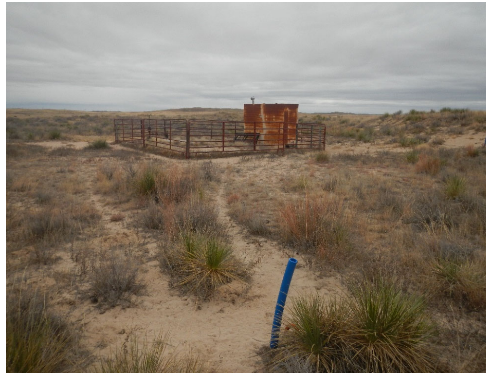
12. View of well location looking southeast from anchor.