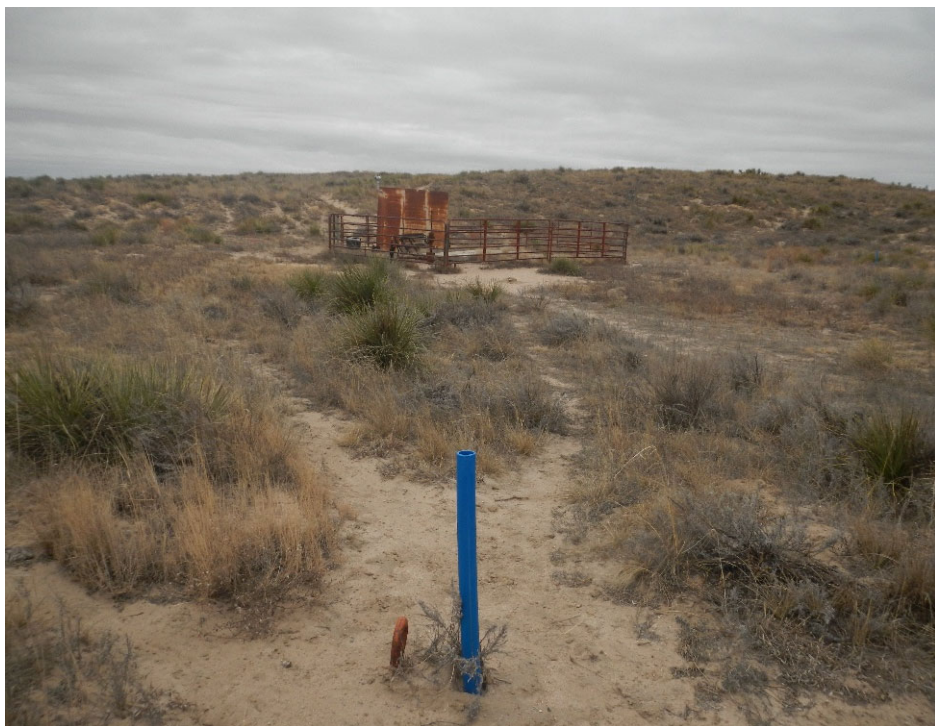
9. View of well location looking southwest from anchor.