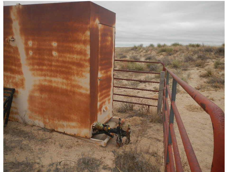
5. Steel separator/meter shed with flowline from well entering shed in lower left corner.