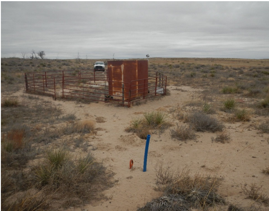
11. View of well location looking northeast from anchor.