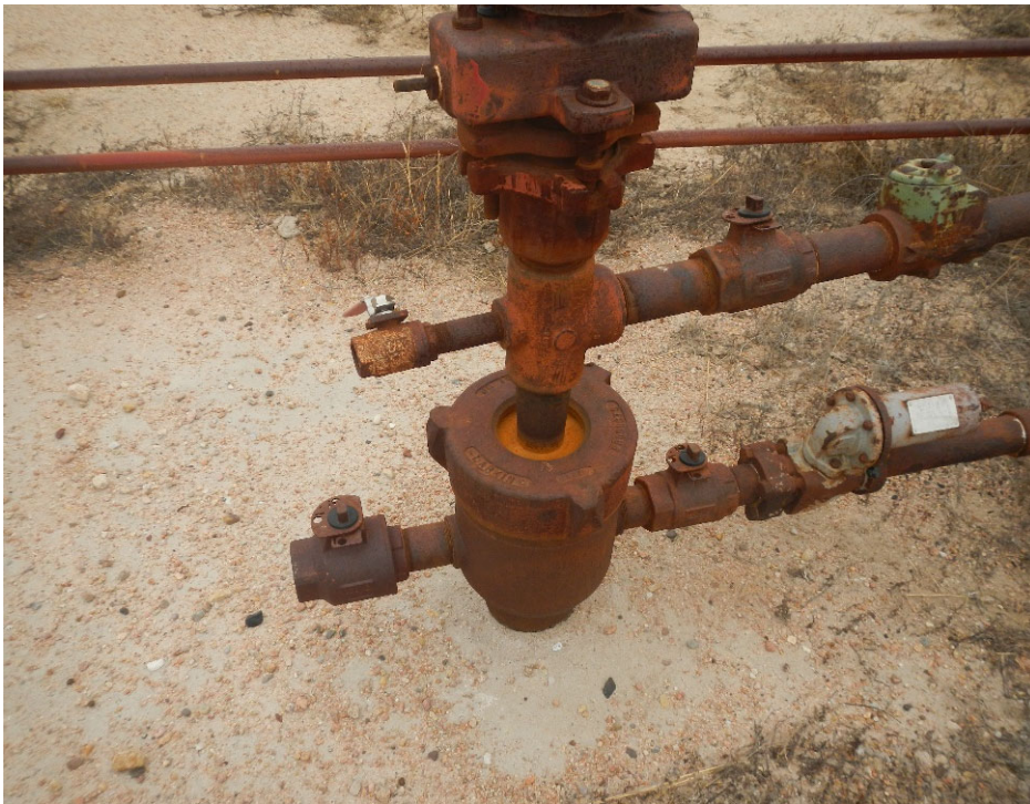
3. Additional view of wellhead.