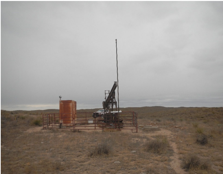
9. View of location looking north.