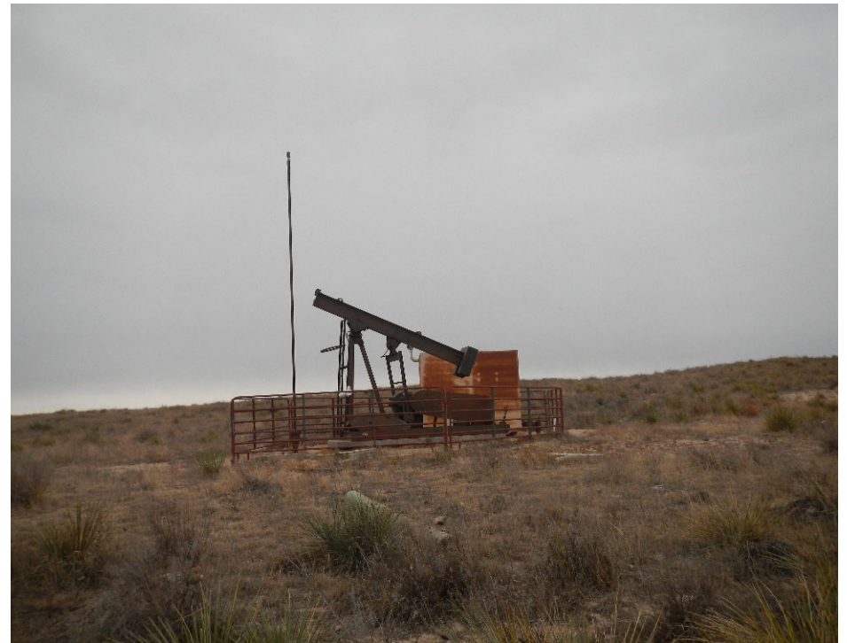
12. View of location looking west.