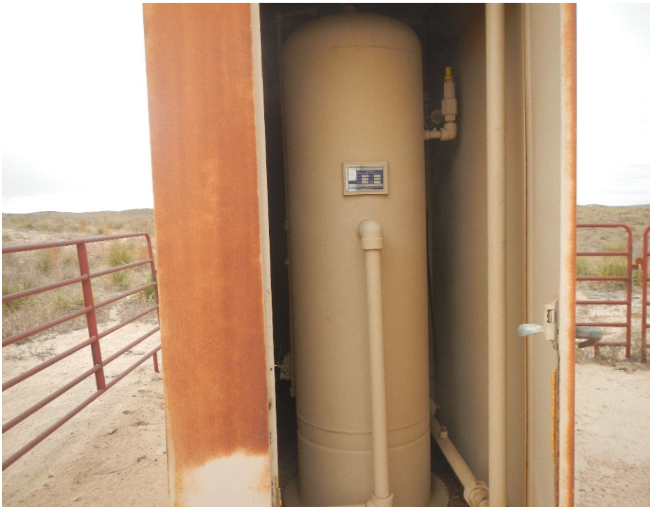
7. 2-Phase vertical separator.