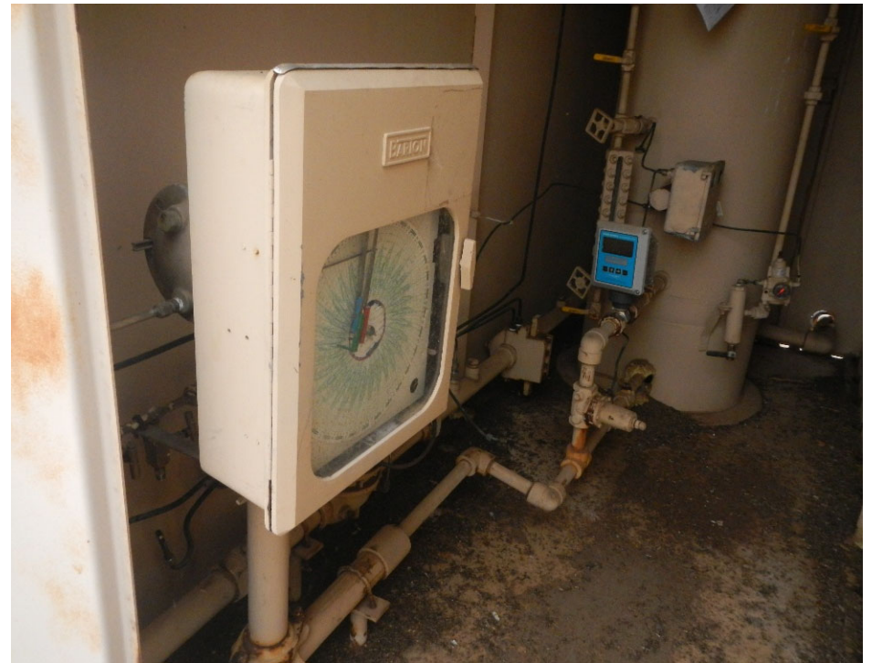
8. Chart recorder.