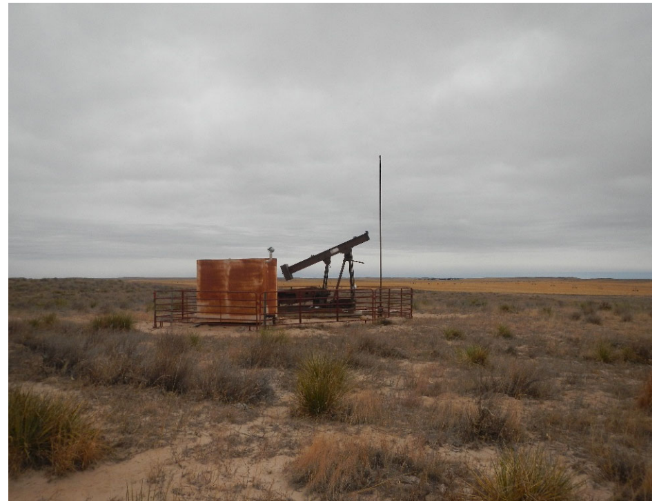
10. View of location looking east.