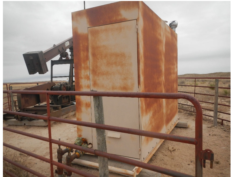
6. View of Separator/Meter Shed with flowlines exiting shed from lower left corner of steel shed.