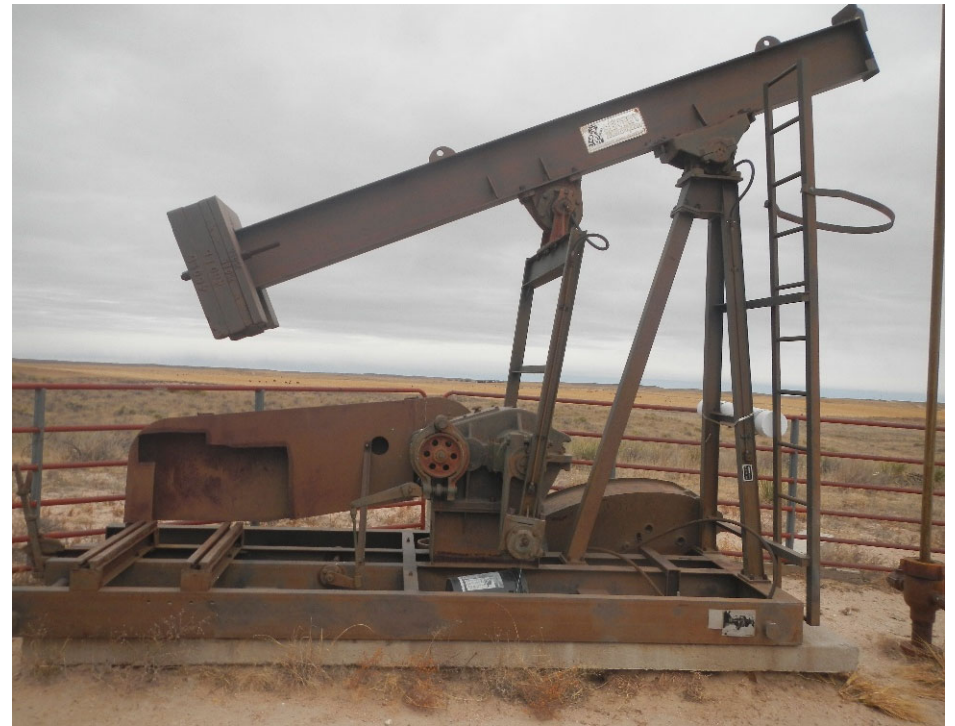
4. Pump Jack with prime mover, horsehead, and bridle removed.