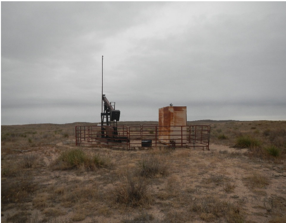
11. View of location looking south.