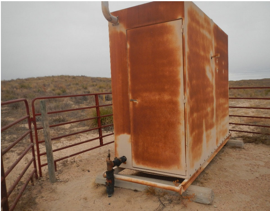
5. View of Separator/Meter Shed inside fencing with flowline from well into lower left corner of steel shed.