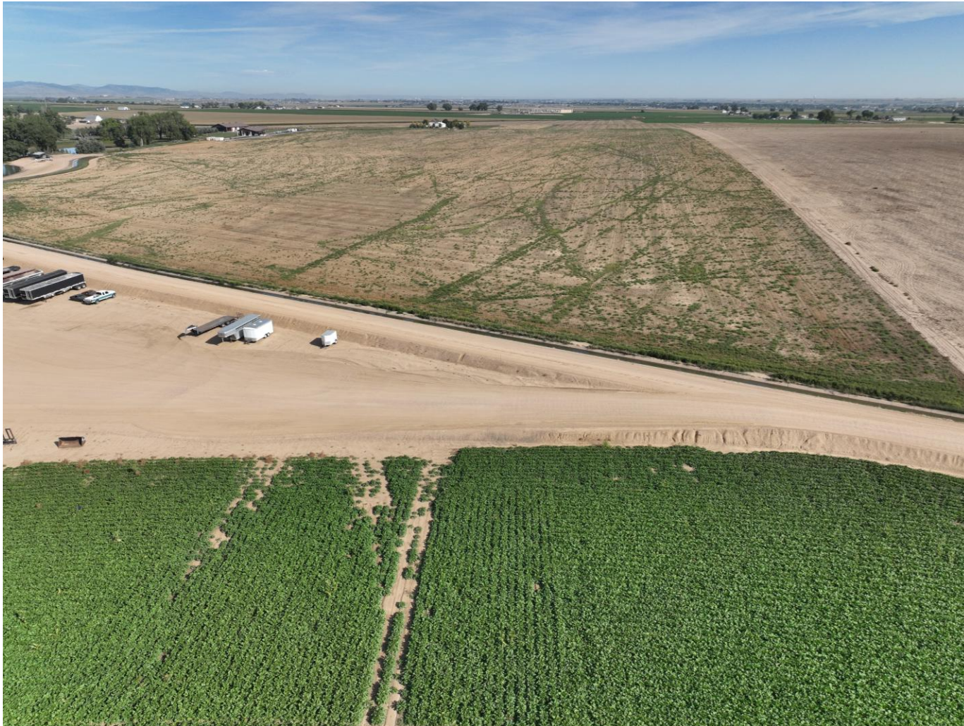
Photo 3. Drone aerial imagery taken south of well location, facing north (displaying the well).