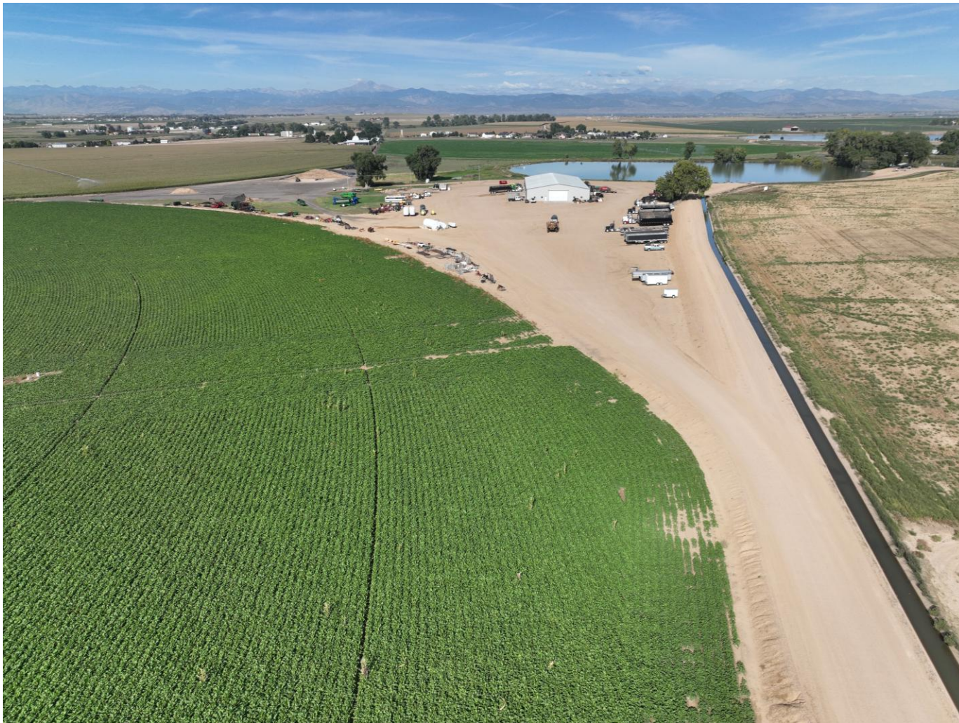
Photo 6. Drone aerial imagery taken east of well location, facing west (displaying the well and estimated flowline).