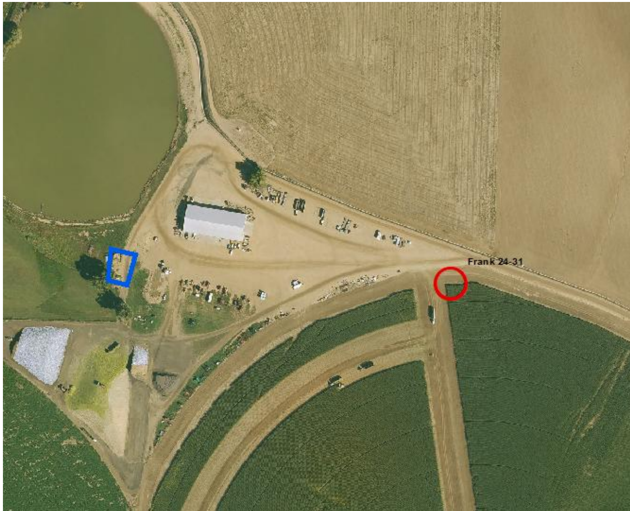
Photo 2. NAIP aerial imagery (2023) illustrating the well location (red circle), and associated tank battery (blue polygon).