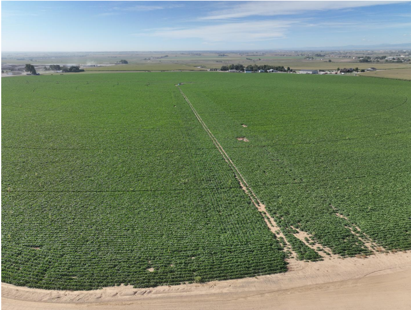
Photo 5. Drone aerial imagery taken north of well location, facing south (displaying the well).