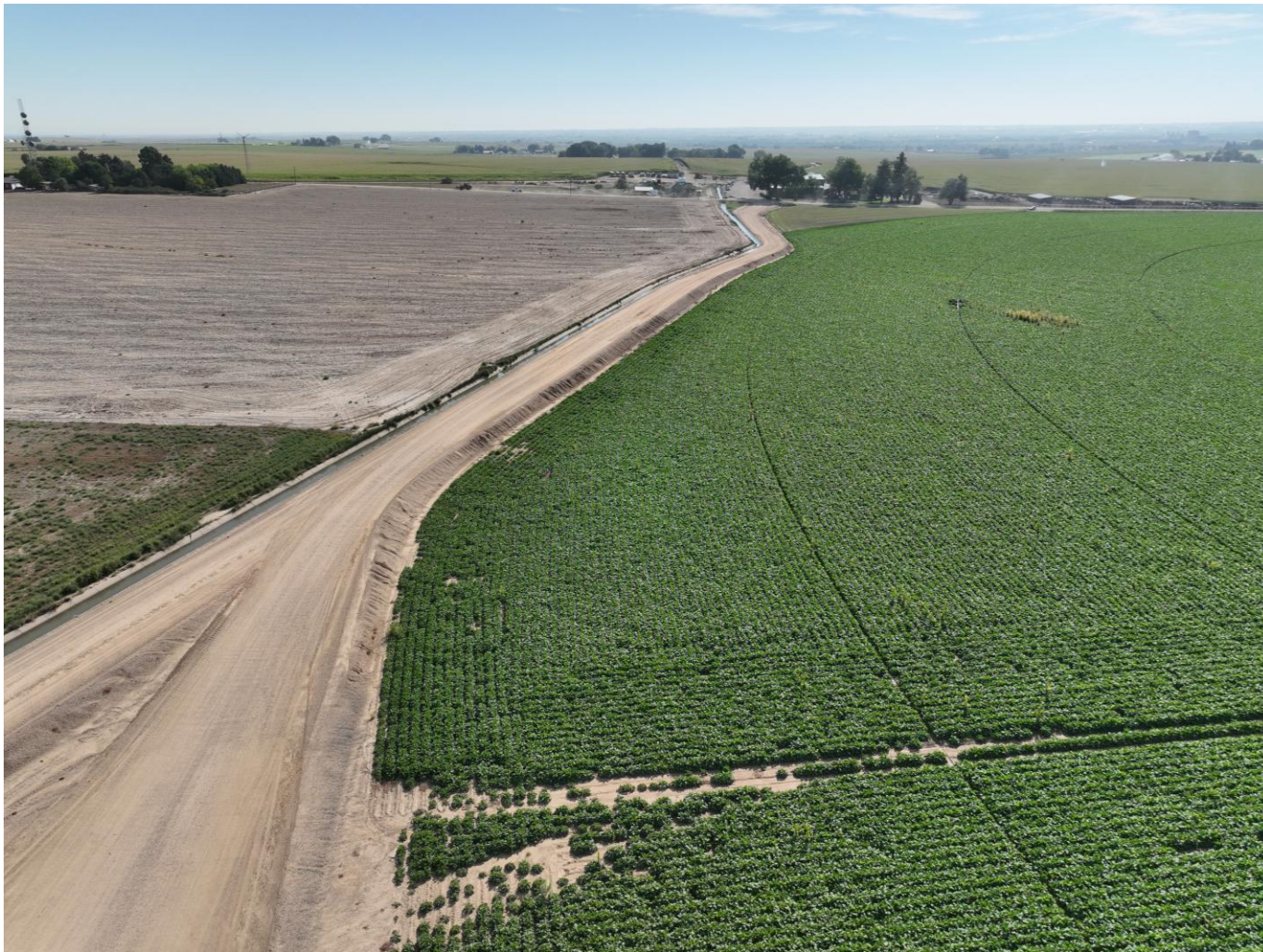
Photo 4. Drone aerial imagery taken west of well location, facing east (displaying the well). Crop vegetation at the well pad appears consistent with adjacent reference areas.