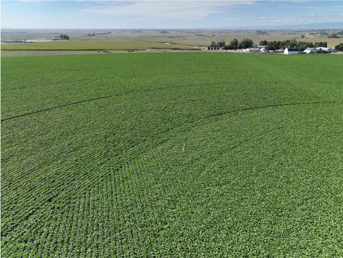
Photo 5. Drone aerial imagery taken north of well location, facing south (displaying the well and presumed flowline).