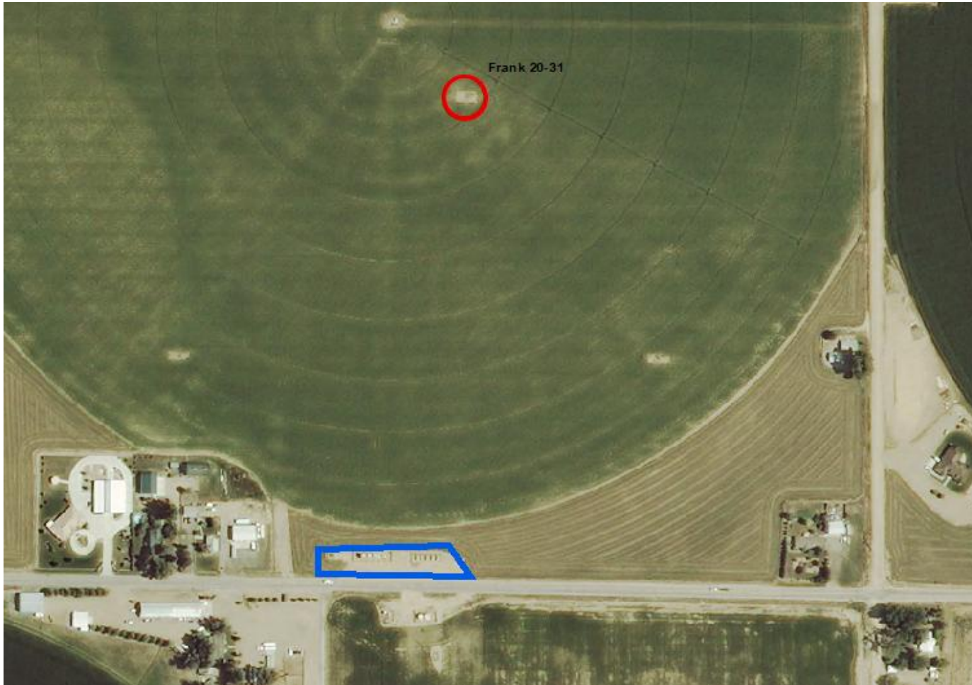
Photo 1. NAIP aerial imagery (2013) illustrating the well location (red circle) and associated tank battery location (blue polygon). The tank battery is associated with location ID #438238.