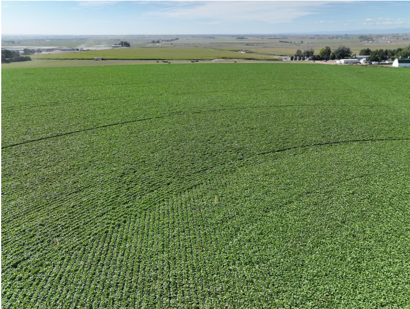
Photo 7. Drone aerial imagery taken northeast of well location, facing southwest (displaying the well and estimated flowline).