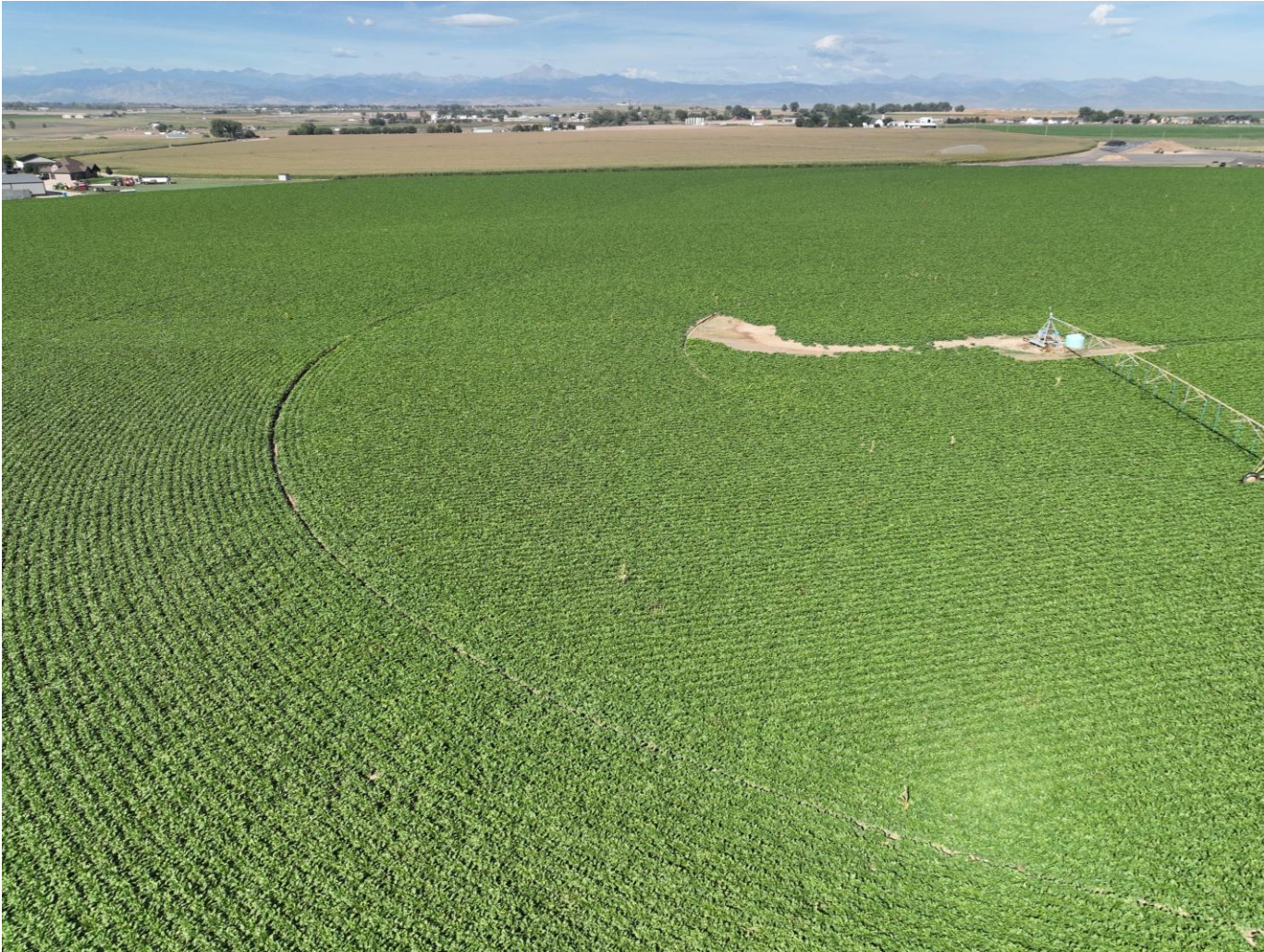
Photo 6. Drone aerial imagery taken east of well location, facing west (displaying the well).