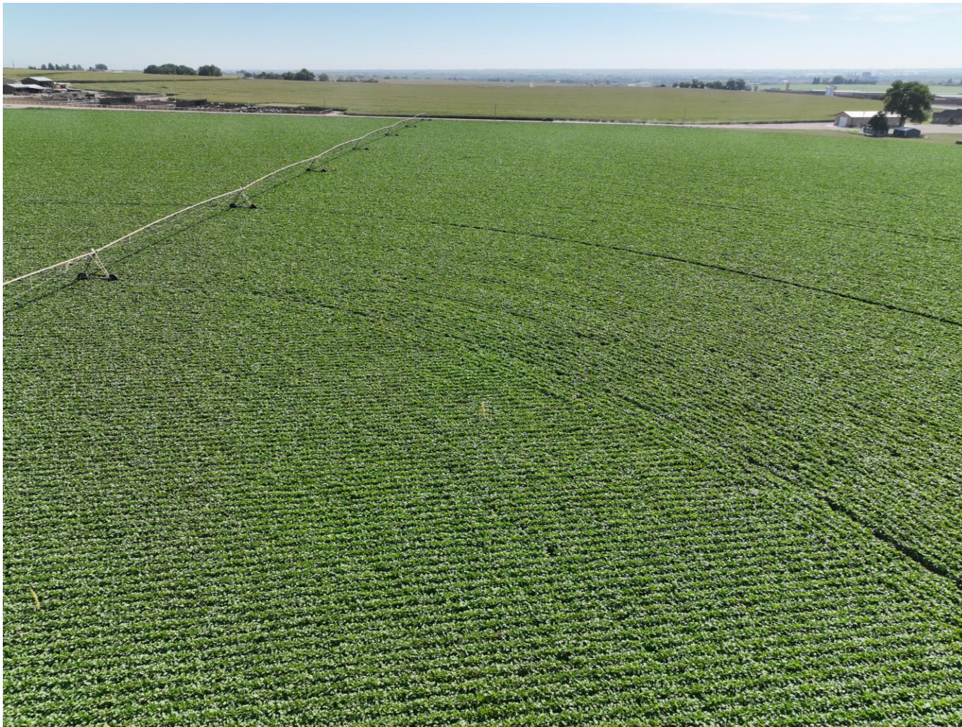
Photo 4. Drone aerial imagery taken west of well location, facing east (displaying the well).