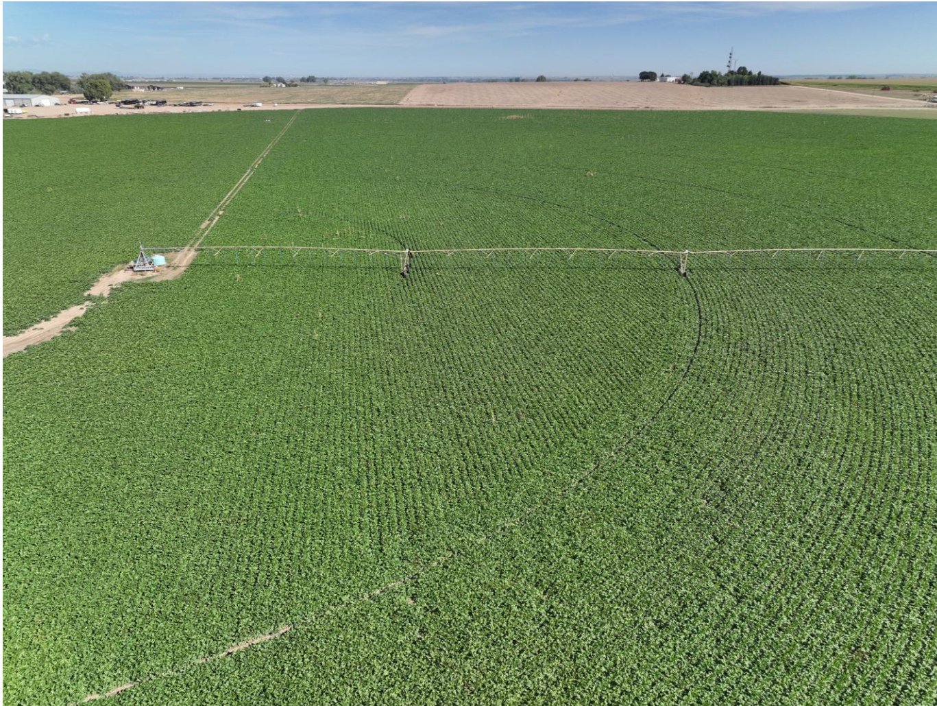
Photo 3. Drone aerial imagery taken south of well location, facing north (displaying the well). Crop vegetation at the well pad appears consistent with adjacent reference areas.