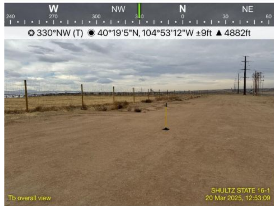
Photo 2. On the ground photo documentation provided by Operator consultant Ensulum demonstrating that all oil and gas equipment has been removed.