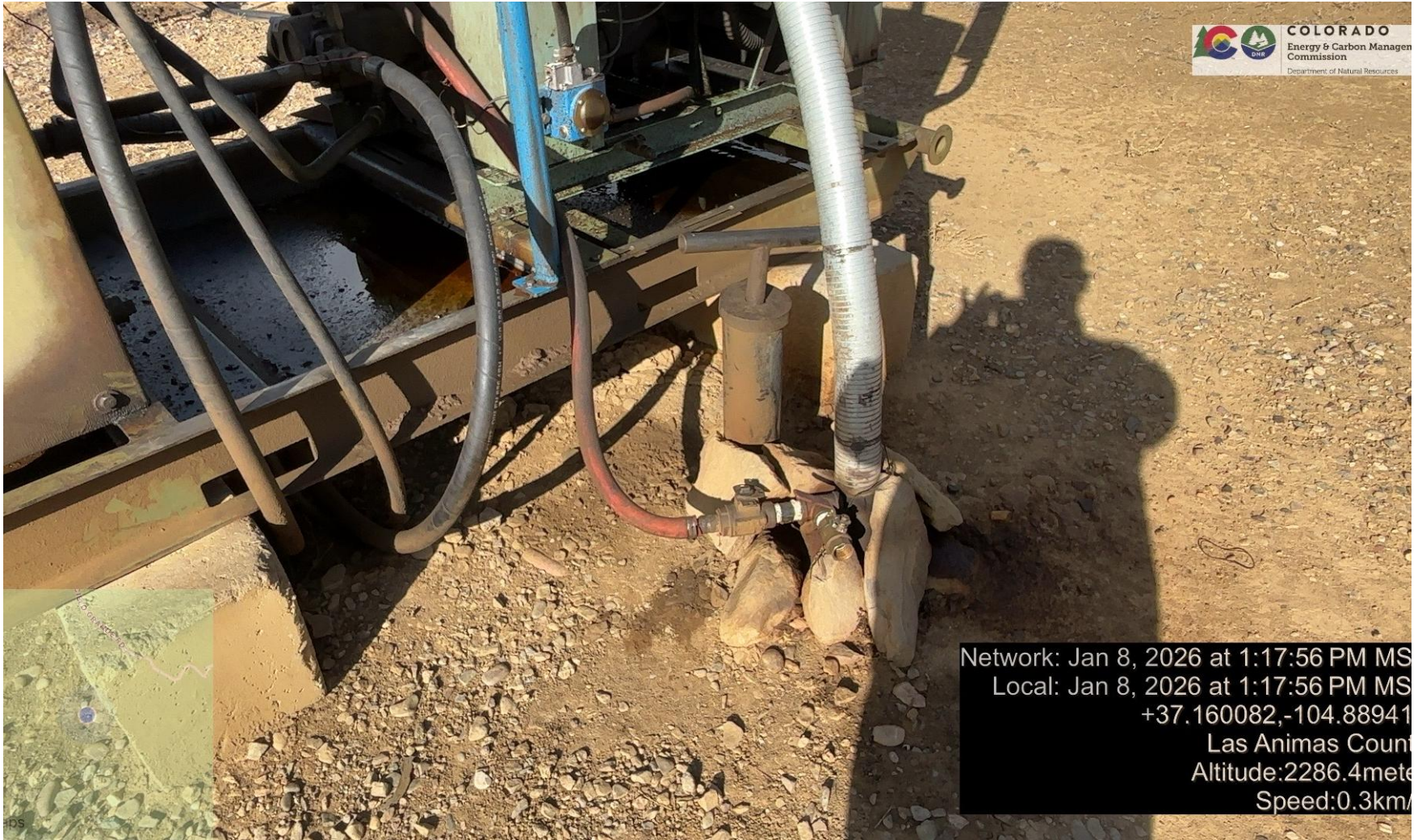
PHOTO 6: OILY WASTE IN PRIME MOVER SKID WITHOUT WILDLIFE PROTECTION SCREENS OR COVERS. DRAIN OILY WASTE REPAIR ALL LEAKS AND REMOVE IMPACTED SOIL PER RULE 1002..(2).D & 1002.f.(2)B, Comply with general provisions of the oil and gas act for wildlife protection AND SB-181. CA DATE 24 HOURS TO DRAIN OILY WASTE 1/9/2026, 10 DAYS TO REMOVE IMPACTED SOIL 1/20/2026.