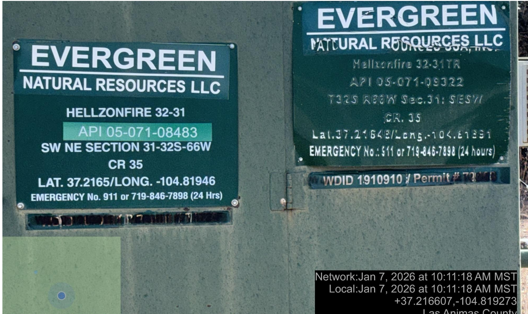
PHOTO 2: TR WELL SIGN IS DETERIORATING AND NOT LEGIBLE. POST SIGN PER RULE 605. CA DATE 2/7/2026.