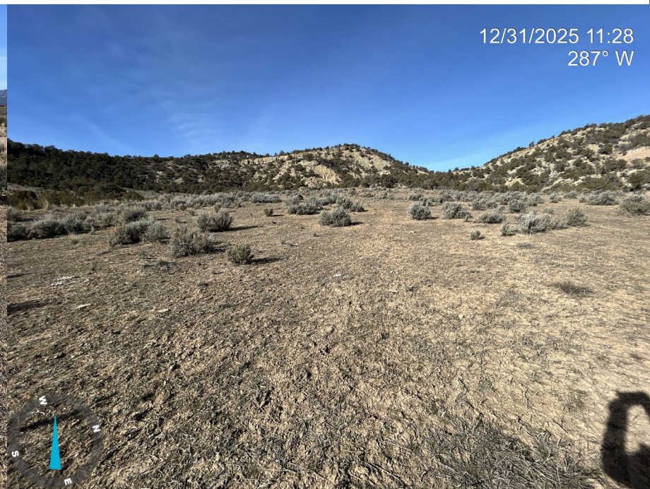
Photo 7: Photos showing the northern and western interim areas, respectively. Interim areas are progressing towards 1003 reclamation requirements.