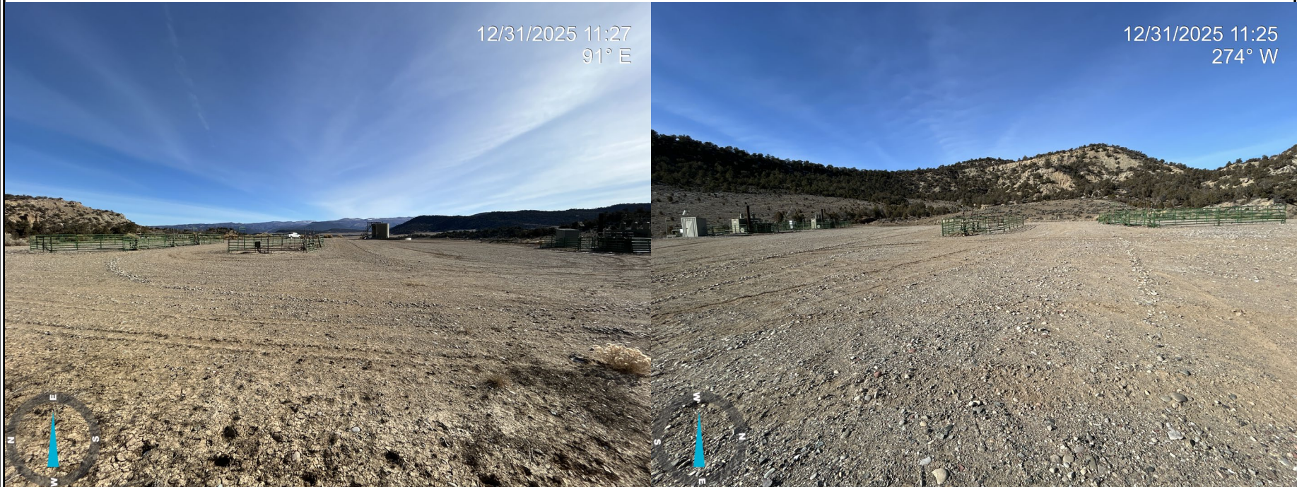
Photo 2: Photos showing an overview of the location looking east and west, respectively.