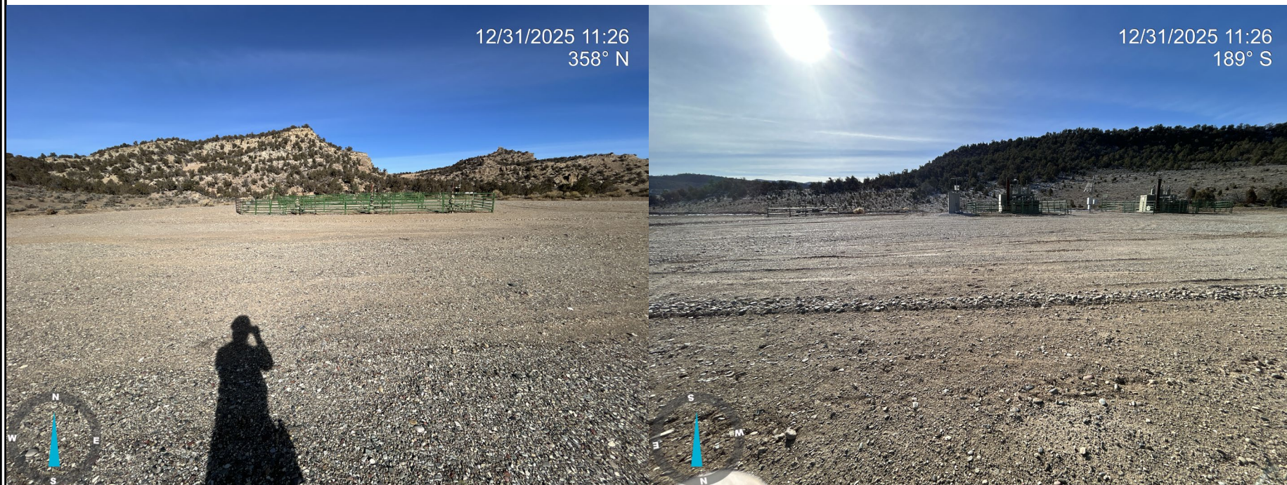
Photo 1: Photos showing an overview of the location looking north and south, respectively.