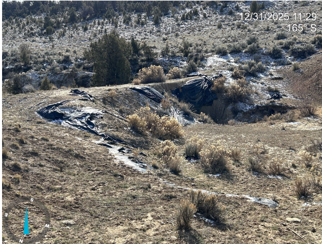
Photo 4: Photos showing examples of the sloughing land bridge to the southwest of the location. This feature does not appear to be associated with Oil and Gas activities.