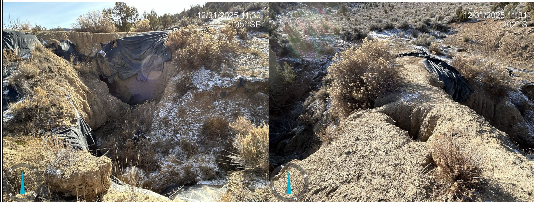
Photo 3: Photos showing examples of the sloughing land bridge to the southwest of the location. This feature does not appear to be associated with Oil and Gas activities.