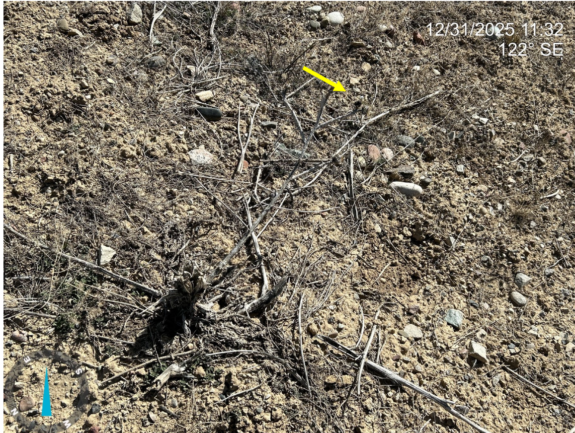
Photo 6: Photo showing a thistle skeleton, likely Canadian or Scotch thistle, that is present in trace amounts at the location. Ongoing weed monitoring and maintenance is necessary.