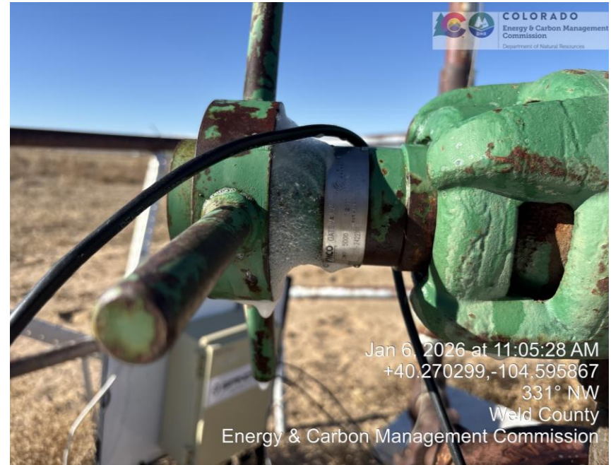
Photo 2 well head master valve leaking