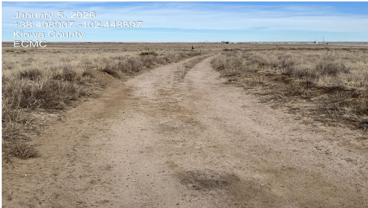
Photo 1. Facing north toward the access road which will need to be recontoured and reclaimed.