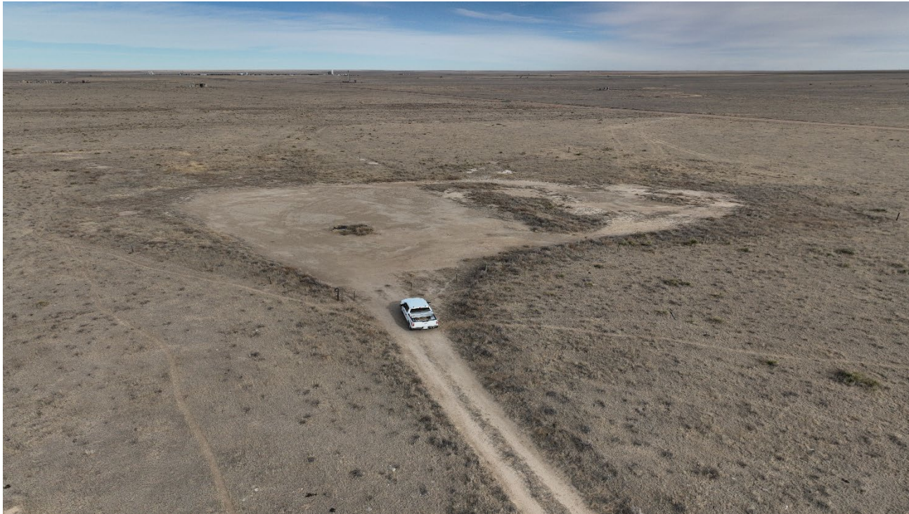
Photo 5. Drone aerial photo facing north toward the access road and location.