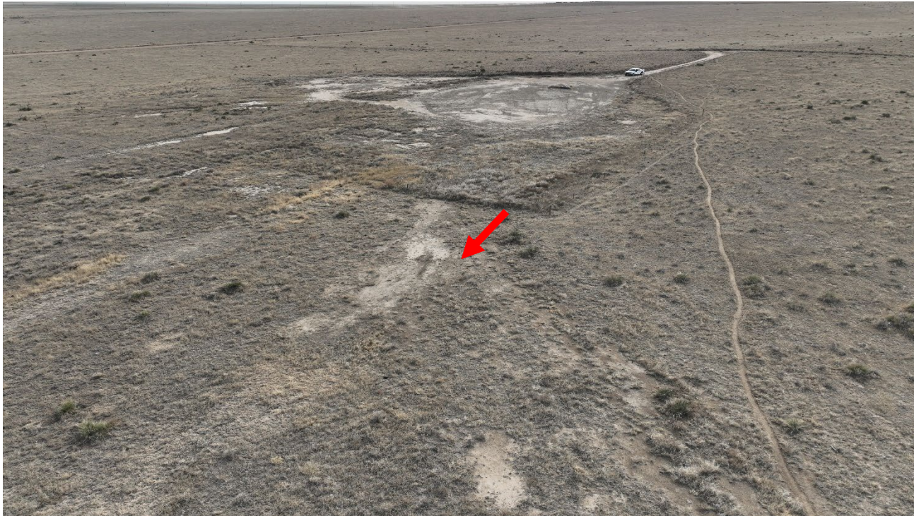
Photo 8. Drone aerial photo facing southeast. There are impacted soils shown at red arrow from historical spill.