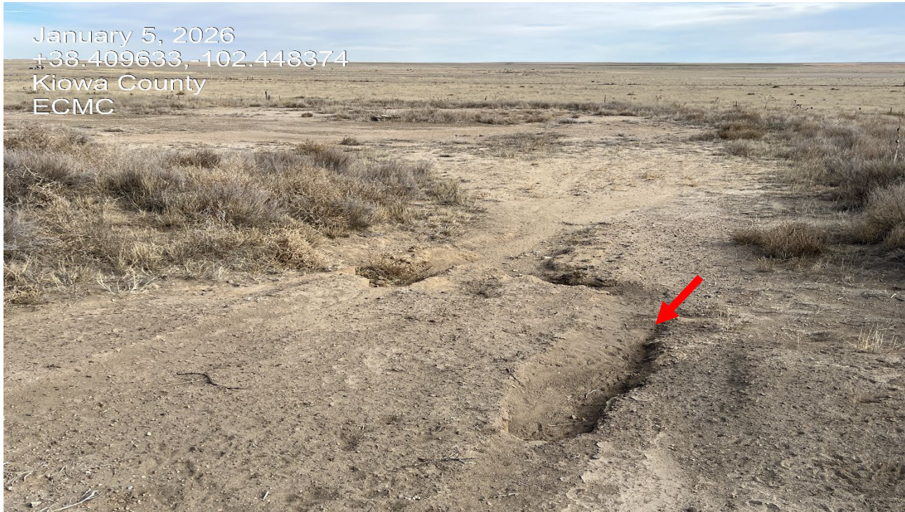
Photo 4. Facing northeast toward the wellsite location. There is erosion in this area beginning to occur.