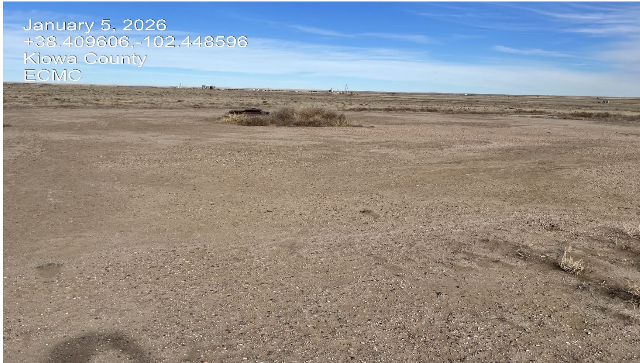
Photo 2. Facing north toward the former tank battery location. Reclamation has not been performed.