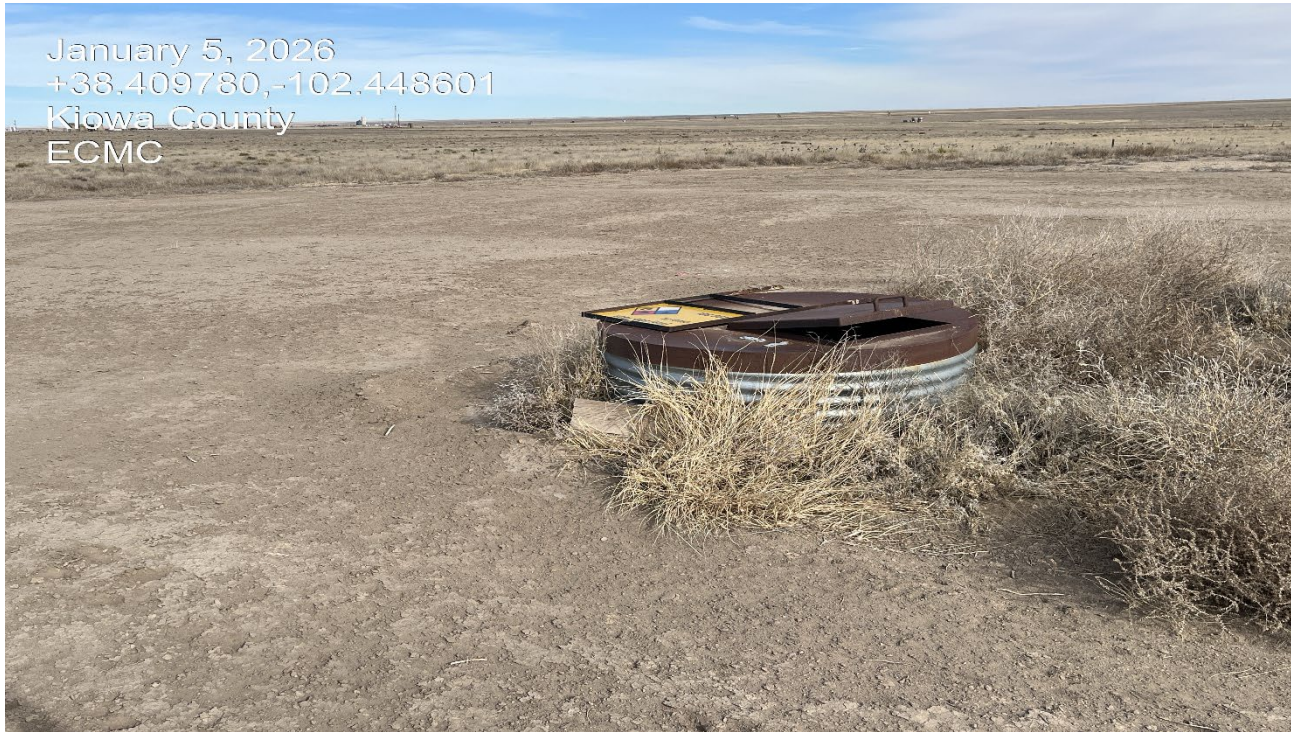
Photo 3. There is a metal flowline culvert that needs to be removed. Flowlines must be abandoned per 1100 rules.