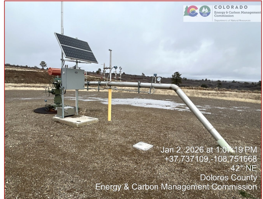
03) Well Pad and well head equipment.