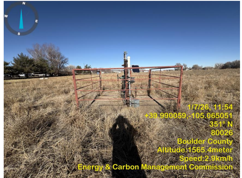
Photo 6 Wellsite.