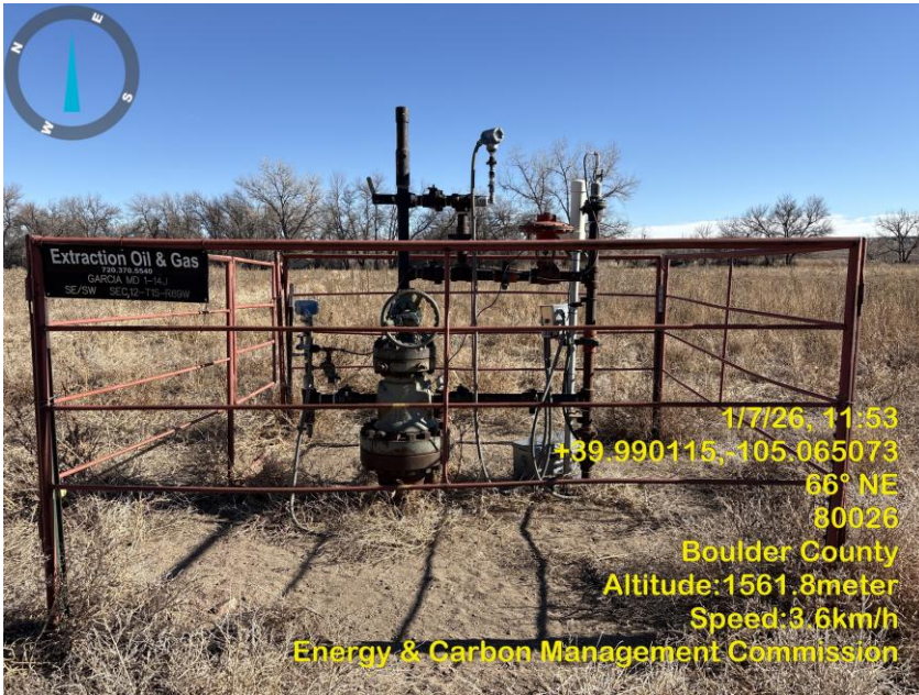
Photo 3 Wellsite sign.