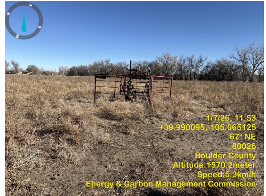
Photo 1 Location entrance.