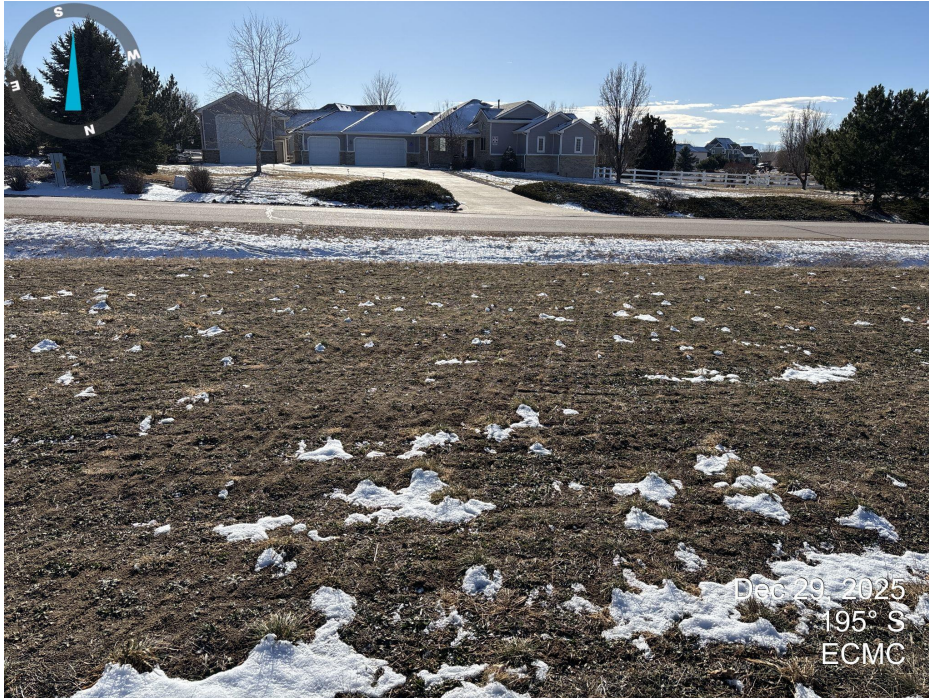
Photo 5. Looking south from the wellbore. See photo 3 comments.