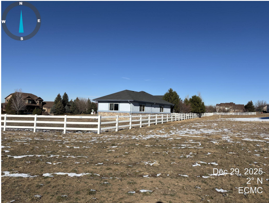
Photo 3. Looking north from the wellbore. Some desirable perennial vegetation is present but sparse on location. Bare soil is visible on location along with undesirable weeds such as blue mustard ( Chorispora tenella ).