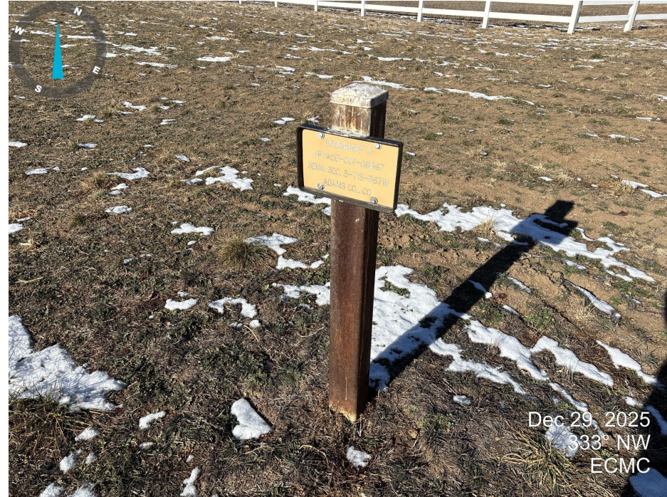
Photo 2. A well marker is present on location.