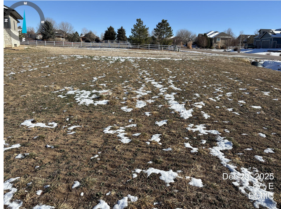
Photo 6. Looking east from the wellbore across the storage tank area. See photo 3 comments.