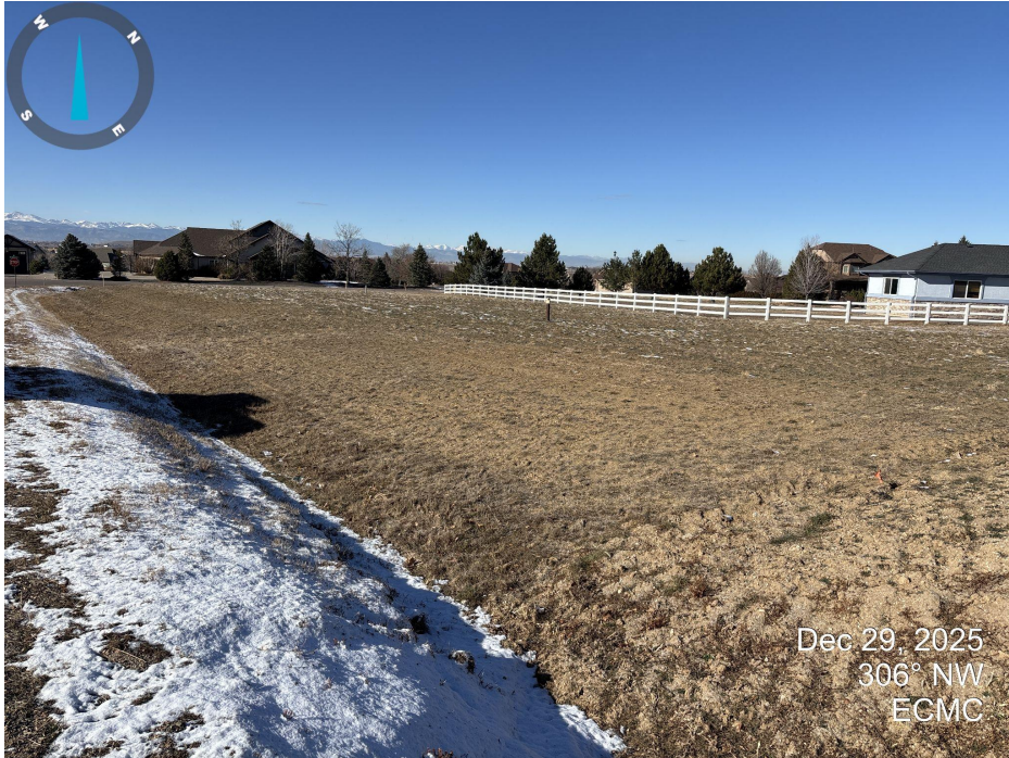
Photo 1. Looking west west across the location. The culvert and gravel has been removed from the location. All oil and gas equipment has been removed from the location. It appears that reclamation has been conducted on the location.