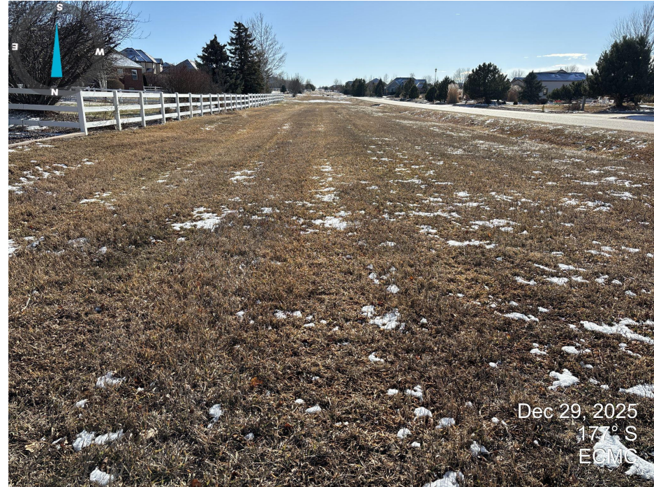
Photo 8. Reference vegetation to the south of the location.