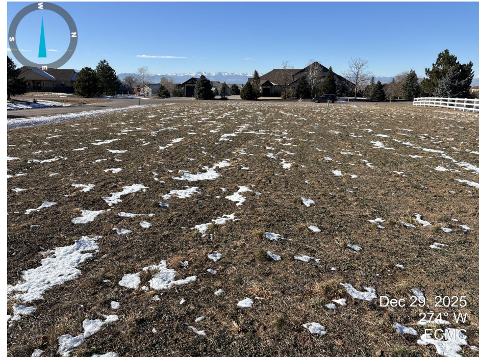
Photo 4. Looking west from the wellbore. See photo 3 comments.