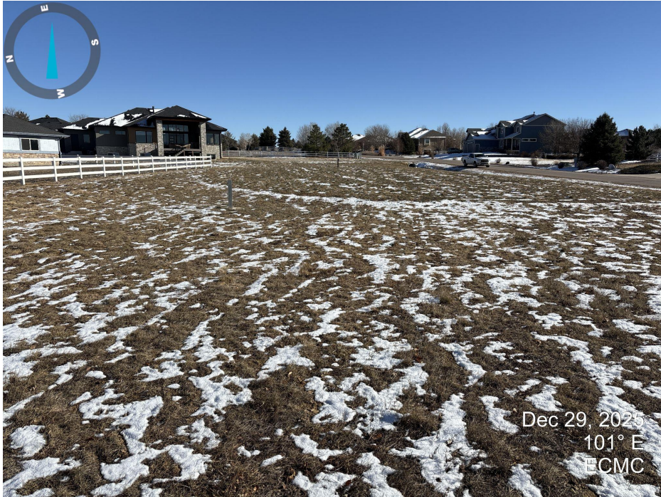
Photo 7. Looking east across the location from the west side. Two monitoring wells are present on the location.