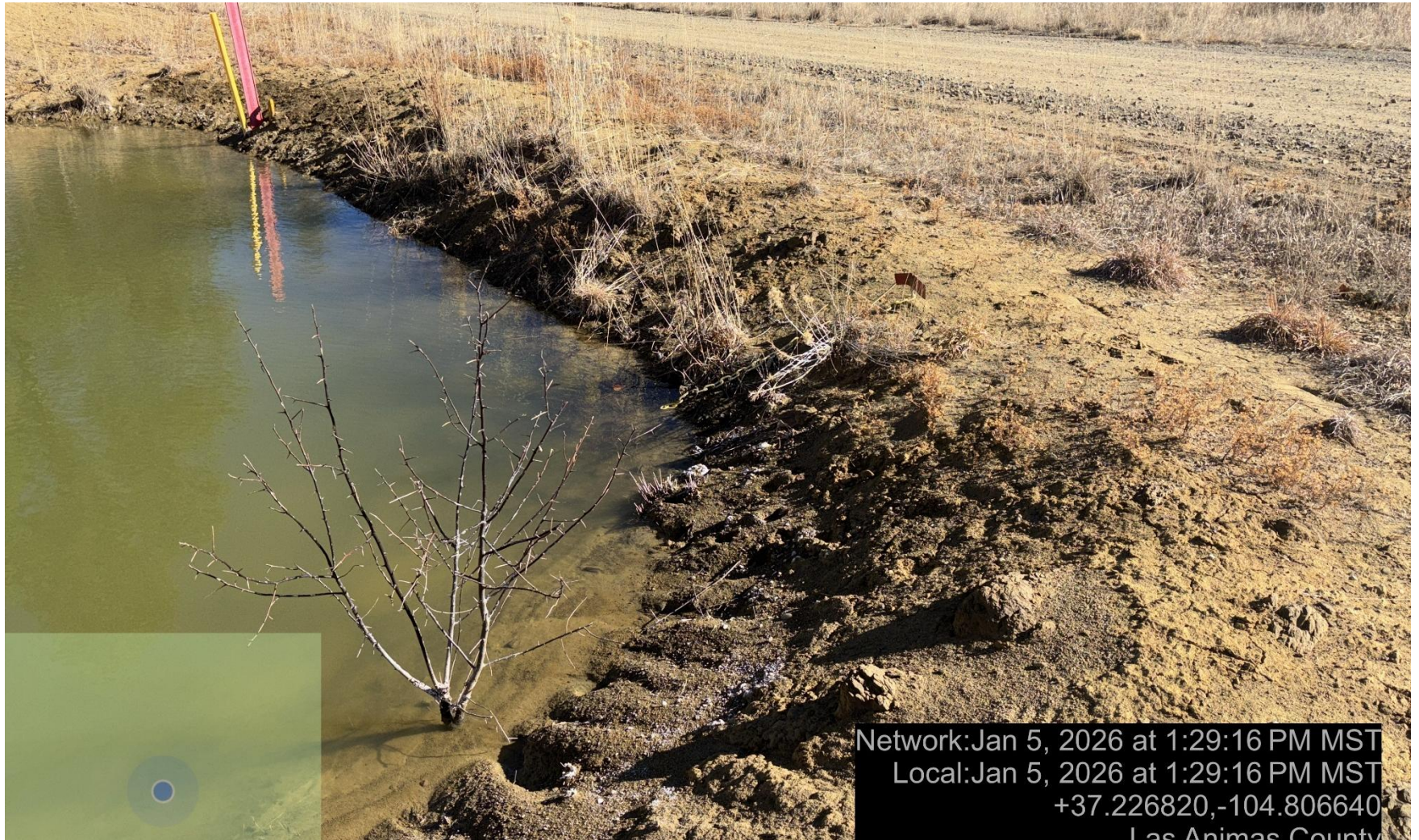
PHOTO 6: LESS THAN 2" OF FREEBOARD IN TR WELLS PIT. Lower fluid level so at least two feet of freeboard exists per Rule 909.c. CA DATE 1/6/2025.