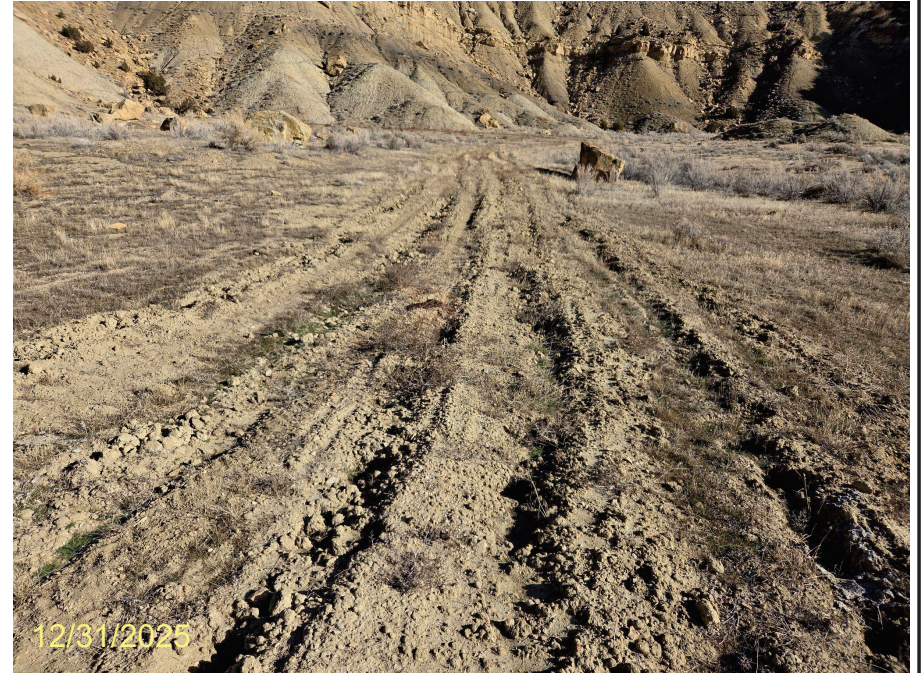
Photo 5: Photos taken from the access road west of the Location, facing east. Photos examples showing reclamation efforts have been performed on access road.