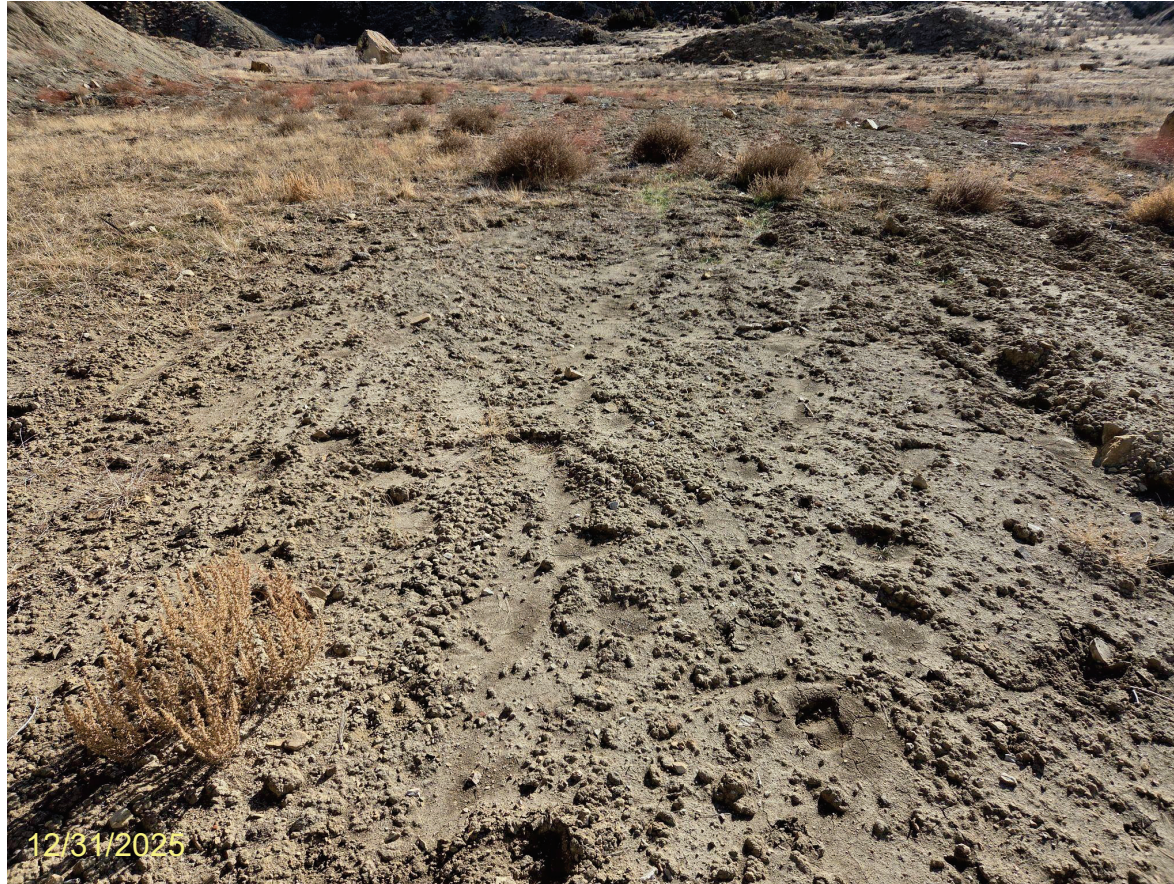
Photo 3: Photo taken from the northwest end of the Location, facing southeast. Initial reclamation efforts have been performed, though it is unclear if Location has been cross-ripped.