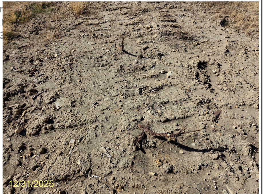
Photo 4: Photos examples of cables/rod observed on the Location. Various other trash/rubbish also observed throughout the Location.