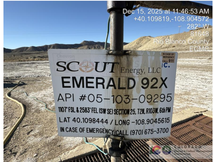
Photo # 0196 Sign lacks public road used to access the well. No tank battery on location