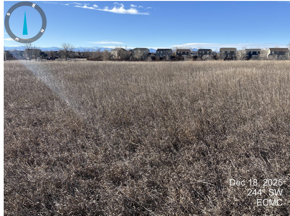
Photo 10. Reference vegetation to the west of the location.