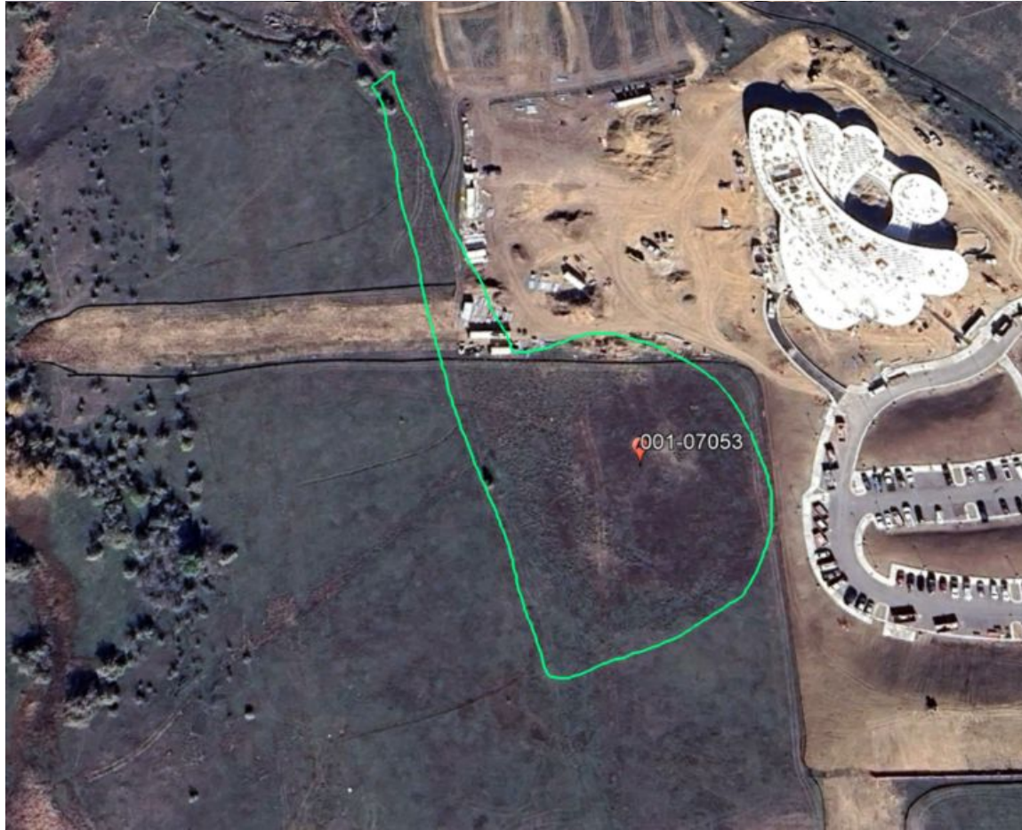
Photo 12. Google earth aerial imagery taken 10/2025. A portion of the disturbance area (green circle) for this location is in an active construction area.