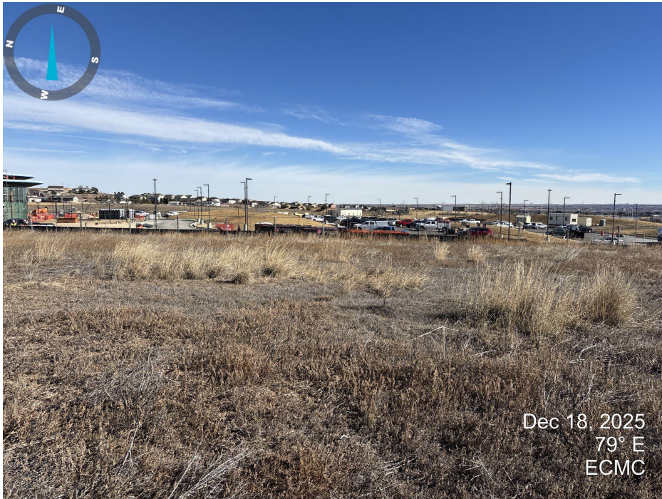
Photo 9. Looking east from the well location. See photo 6 comments.