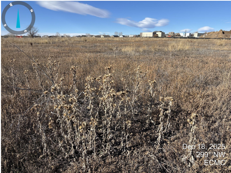
Photo 5. List B noxious weed scotch thistle is present on the location