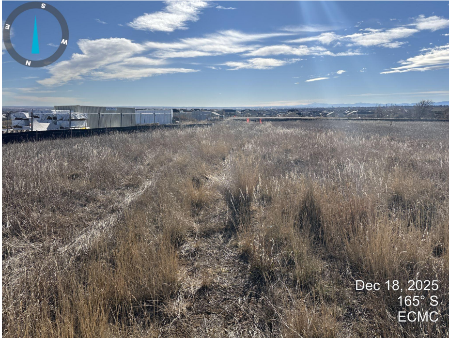
Photo 1. Looking south down the two track from the main access road irrigation ditch crossing. Vegetation appears to be reflective of the surrounding area. Nearby construction has disturbed a portion of this section of access road.