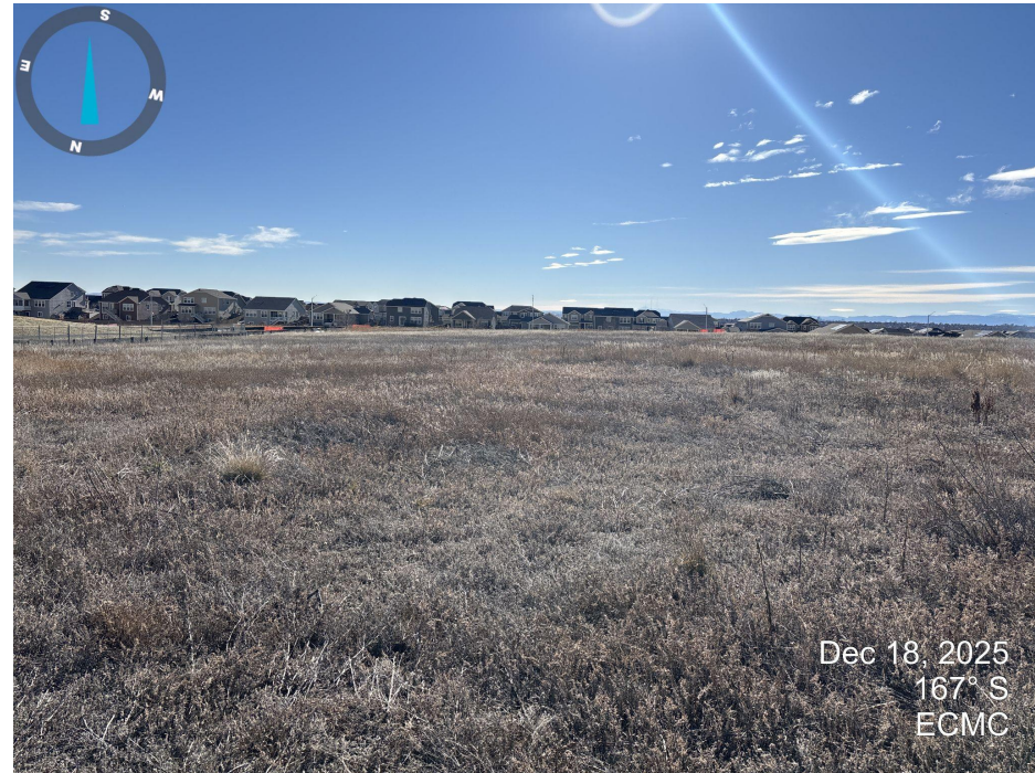
Photo 8. Looking south from the well location. See photo 6 comments.