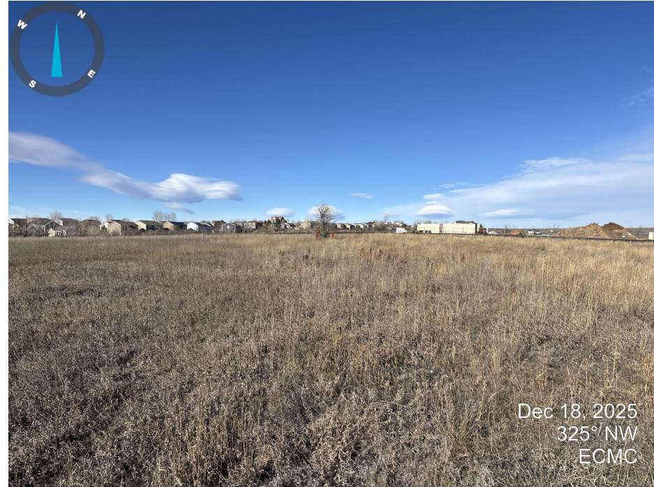
Photo 2. Looking north from the location along the northern access road. Vegetation on the access road appears to be reflective of the surrounding reference area.