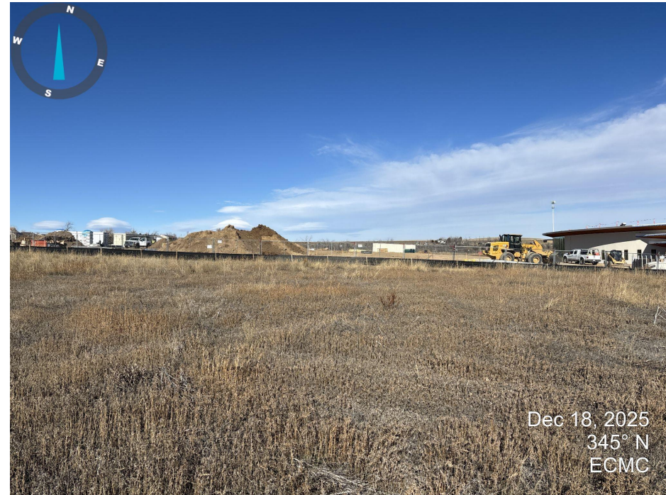
Photo 6. Looking north from the well location. Vegetation on location consists primarily of undesirable weeds such as ragweed and kochia. Limited desirable perennial vegetation is present on location but the location is not reflective of the reference area. A portion of the location is within an active construction zone.