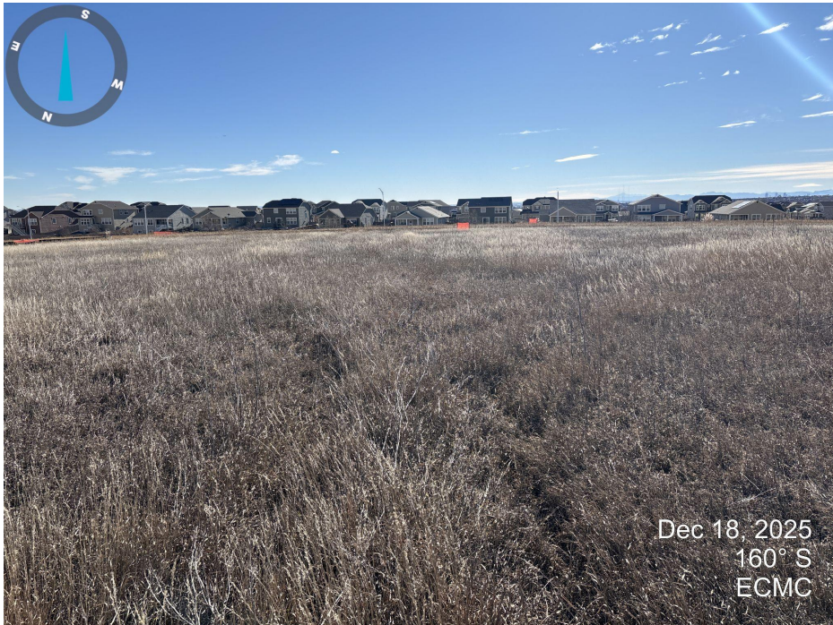
Photo 3. Picture taken from access road junction to the west of the well location. This portion of the access road appears to have been used for well access around 2014. This section of the access road appears reflective of the surrounding reference vegetation.