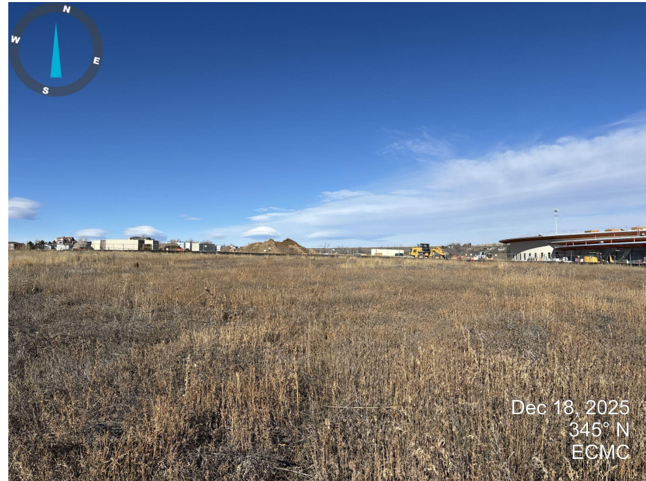
Photo 4. Looking across the well location disturbance from the south edge. Vegetation on location consists primarily of undesirable weeds such as ragweed and kochia. All oil and gas equipment has been removed from the location.