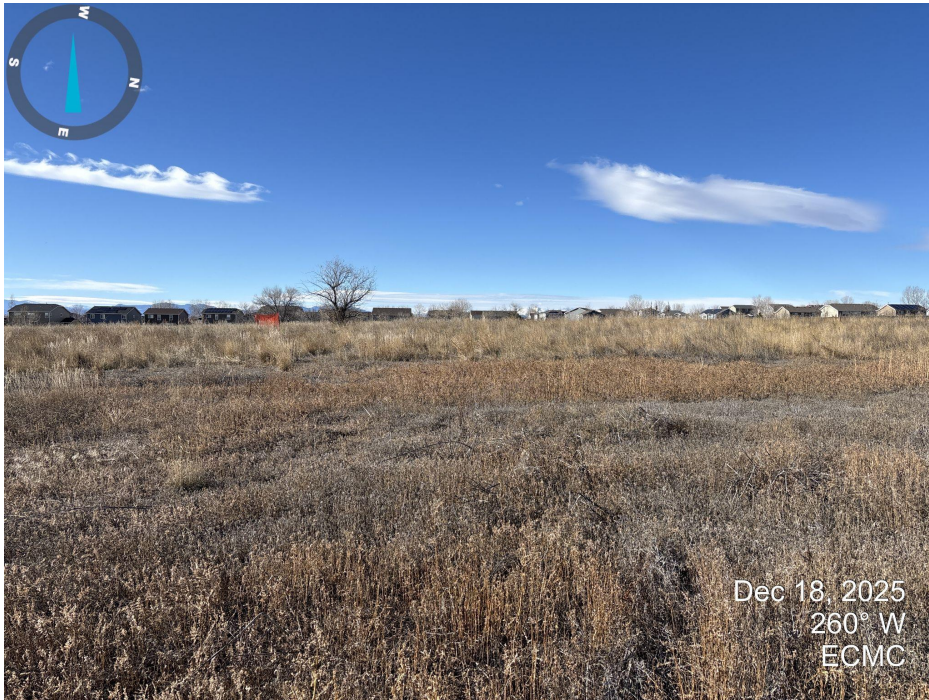
Photo 7. Looking west from the well location. See photo 6 comments.