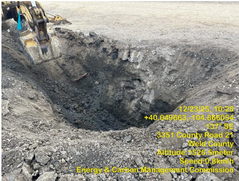
Photo 7 Excavation hole exposing flow lines.