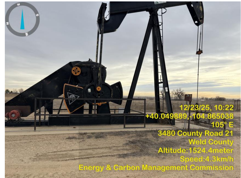
Photo 15 Wellsite ancillary equipment.