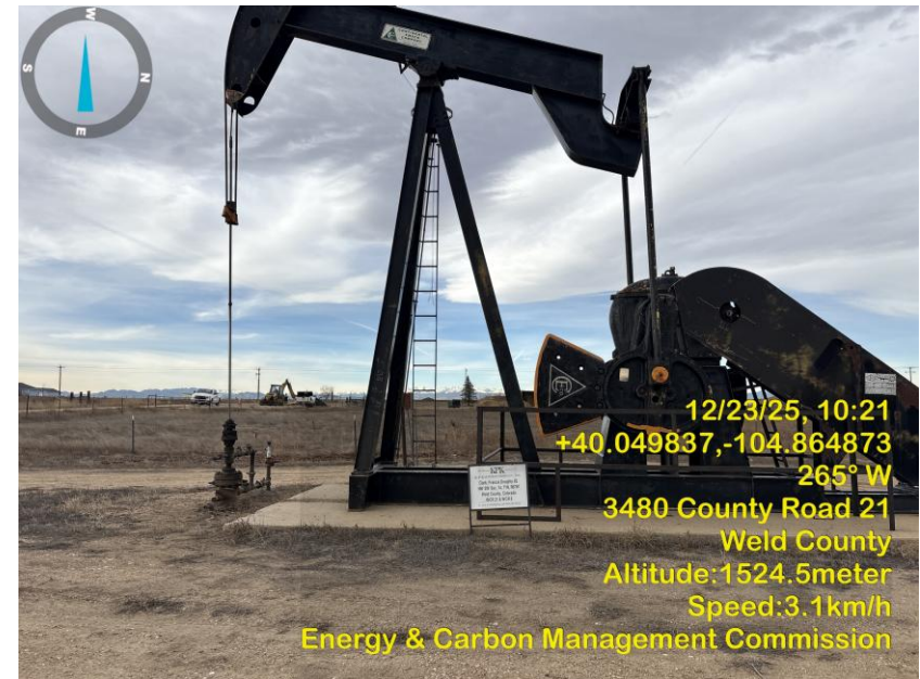
Photo 13 Wellsite sign.