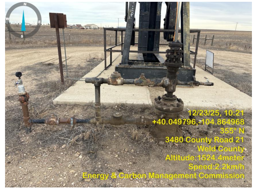
Photo 11 Wellsite.