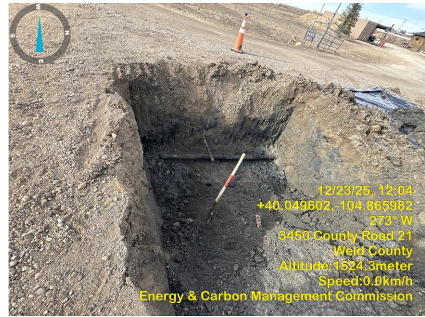
Photo 9 Excavation hole exposing flow lines.