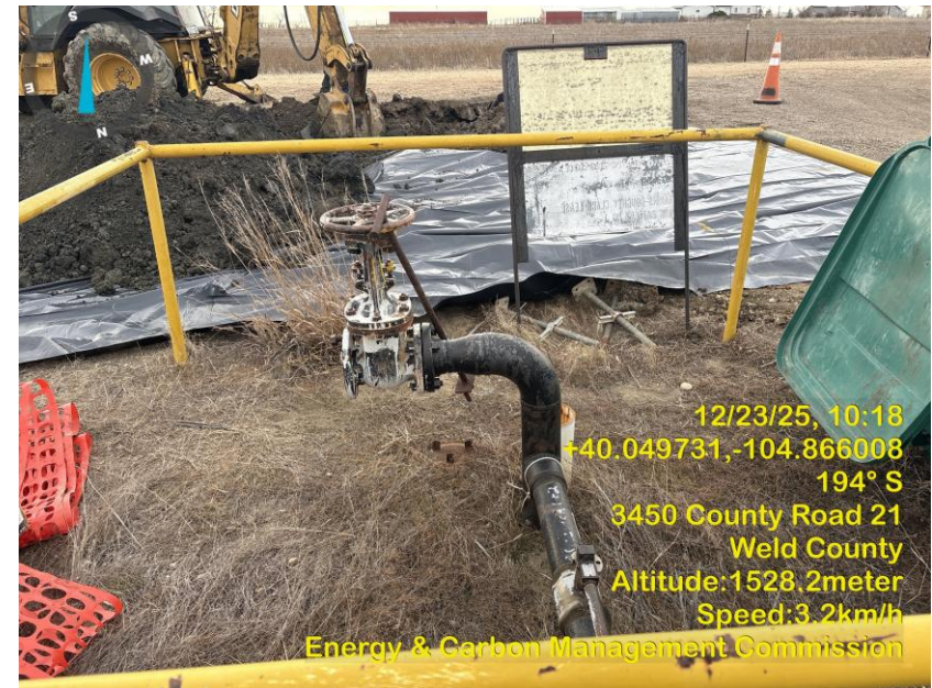
Photo 3 Contaminated soil pile.