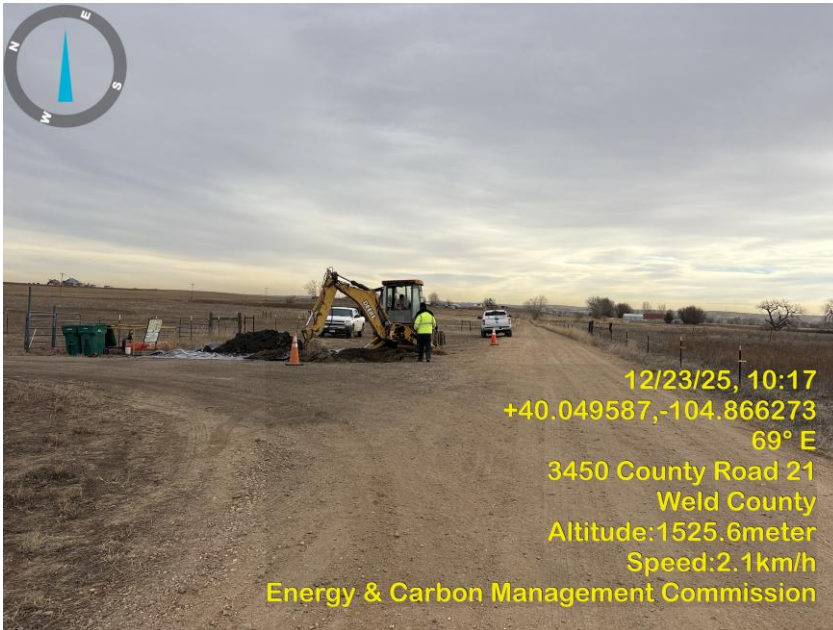
Photo 1 Spill Location.