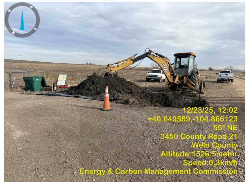
Photo 2 Backhoe & Excavation.