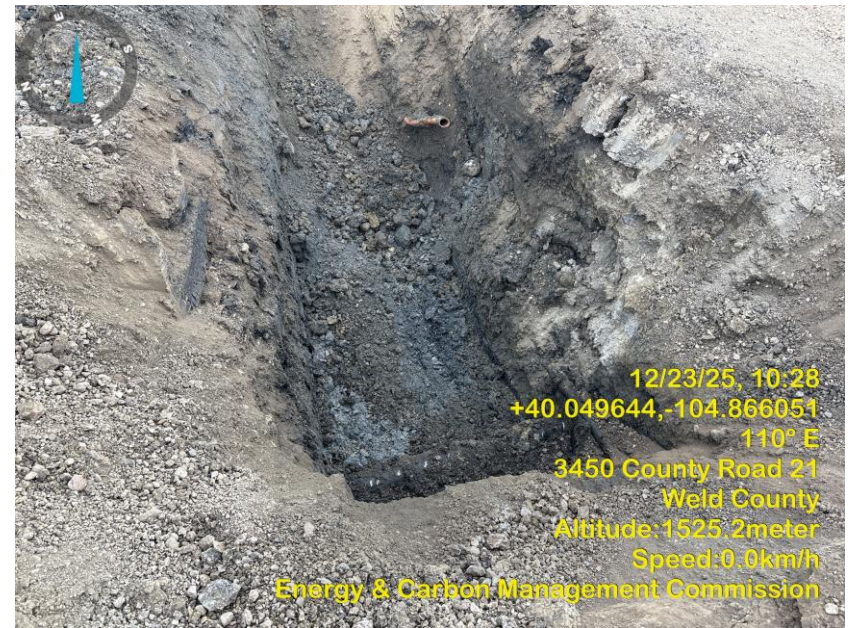
Photo 8 Excavation hole exposing flow lines.