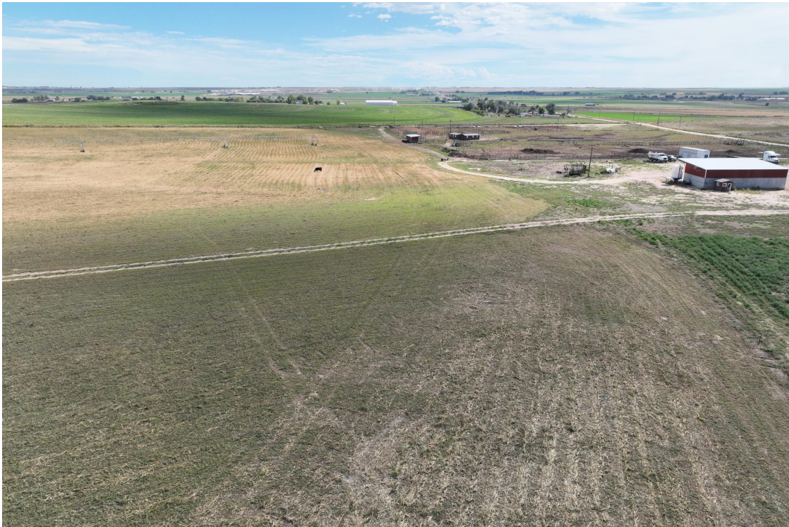
Photograph 2: View facing east as required in Energy and Carbon Management Commission (ECMC) Rule 1004. Photo Taken from GPS 40.277895, -104.675259