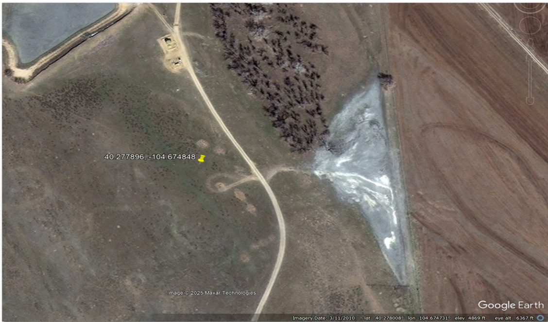
Imagery Date: March 11, 2010

Site Name: Krause 13-28 AL Imagery Source: Google Earth