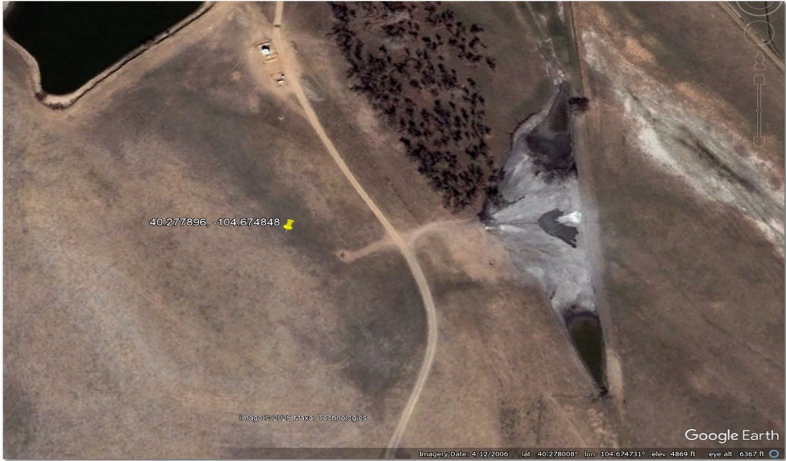
Imagery Date: April 12, 2006