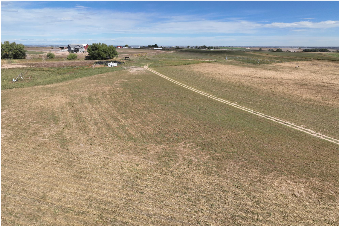
Photograph 1: View facing north as required in Energy and Carbon Management Commission (ECMC) Rule 1004. Photo Taken from GPS 40.277546, -104.674848