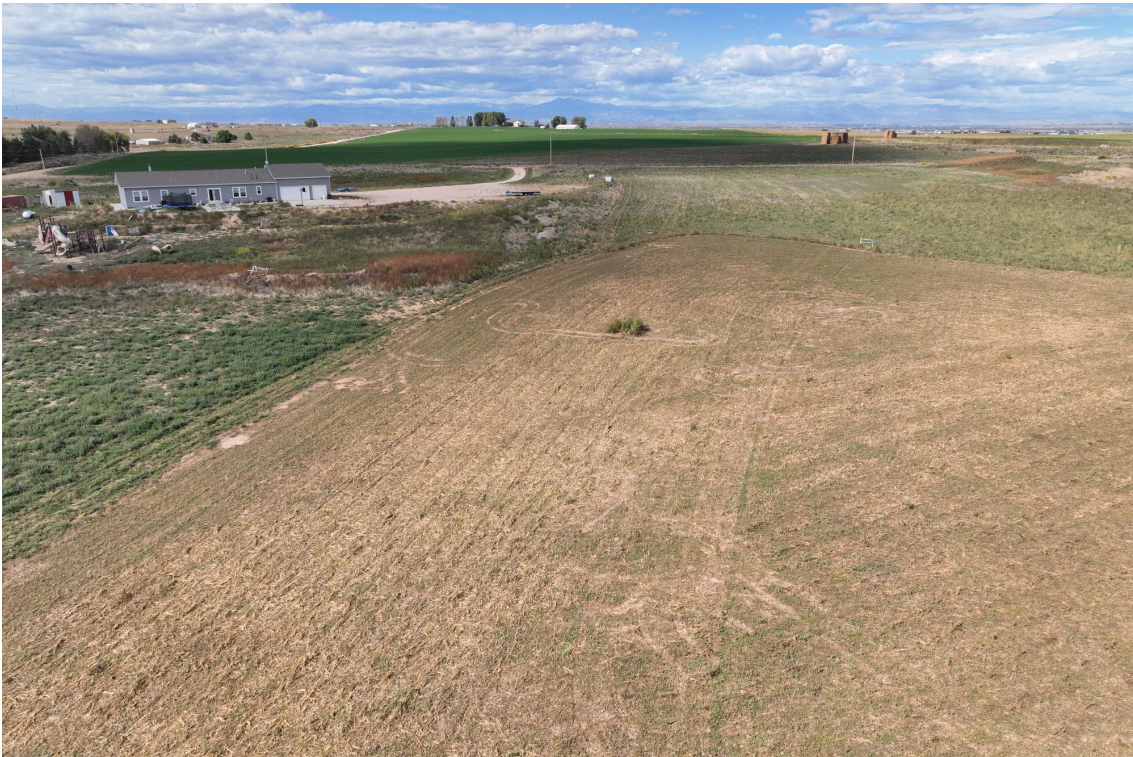
Photograph 4: View facing west as required in Energy and Carbon Management Commission (ECMC) Rule 1004. Photo Taken from GPS 40.277896, -104.674438