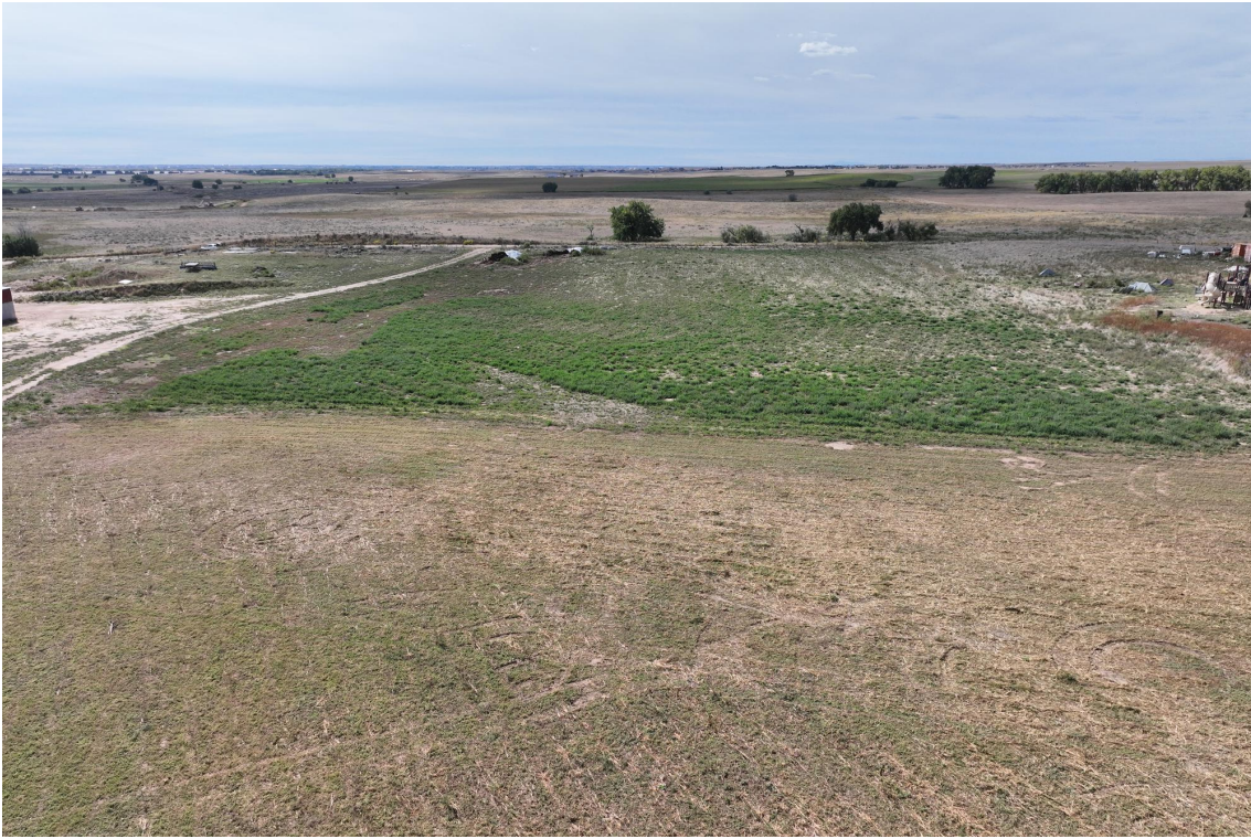
Photograph 3: View facing south as required in Energy and Carbon Management Commission (ECMC) Rule 1004. Photo Taken from GPS 40.278246, -104.674849