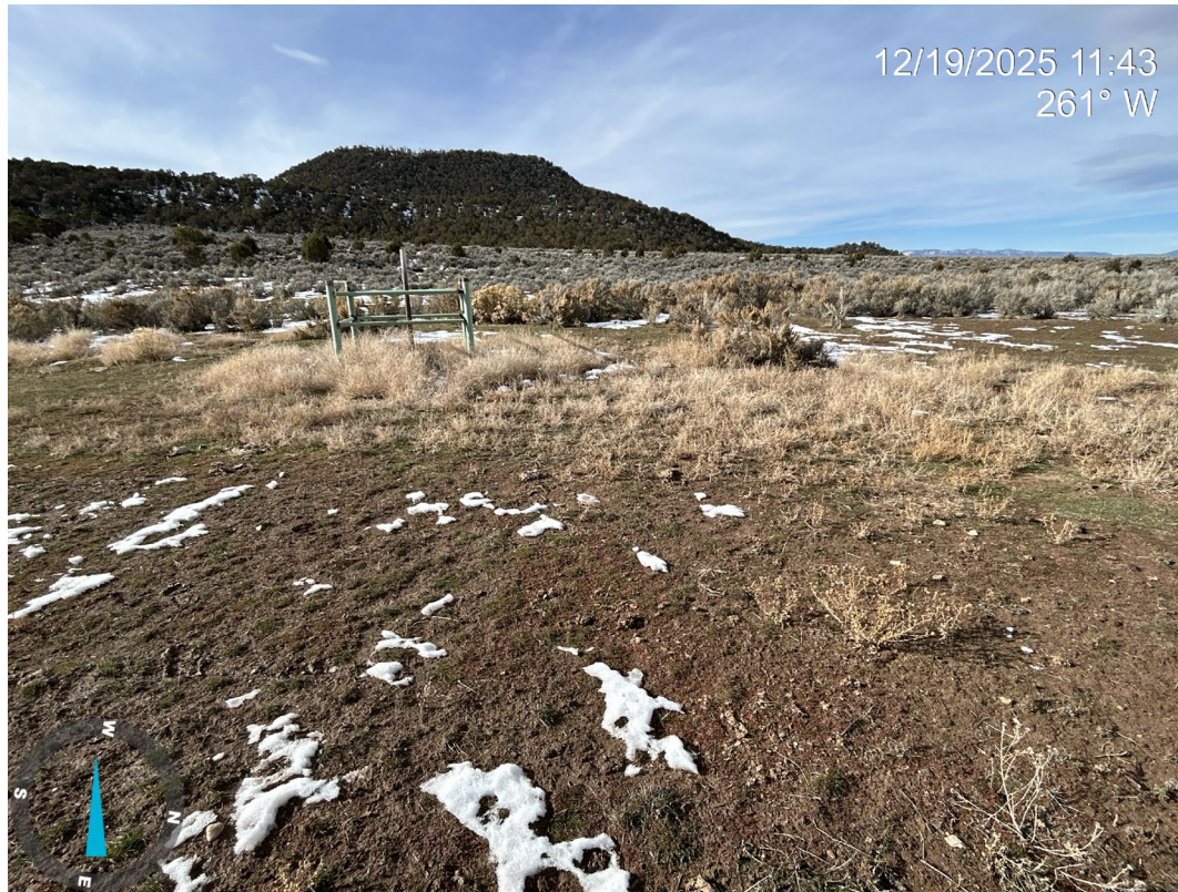
Photo 4: Photo showing an undesirable plant species, likely prickly Russian thistle or kochia, has infested the PA'd wellhead marker area.