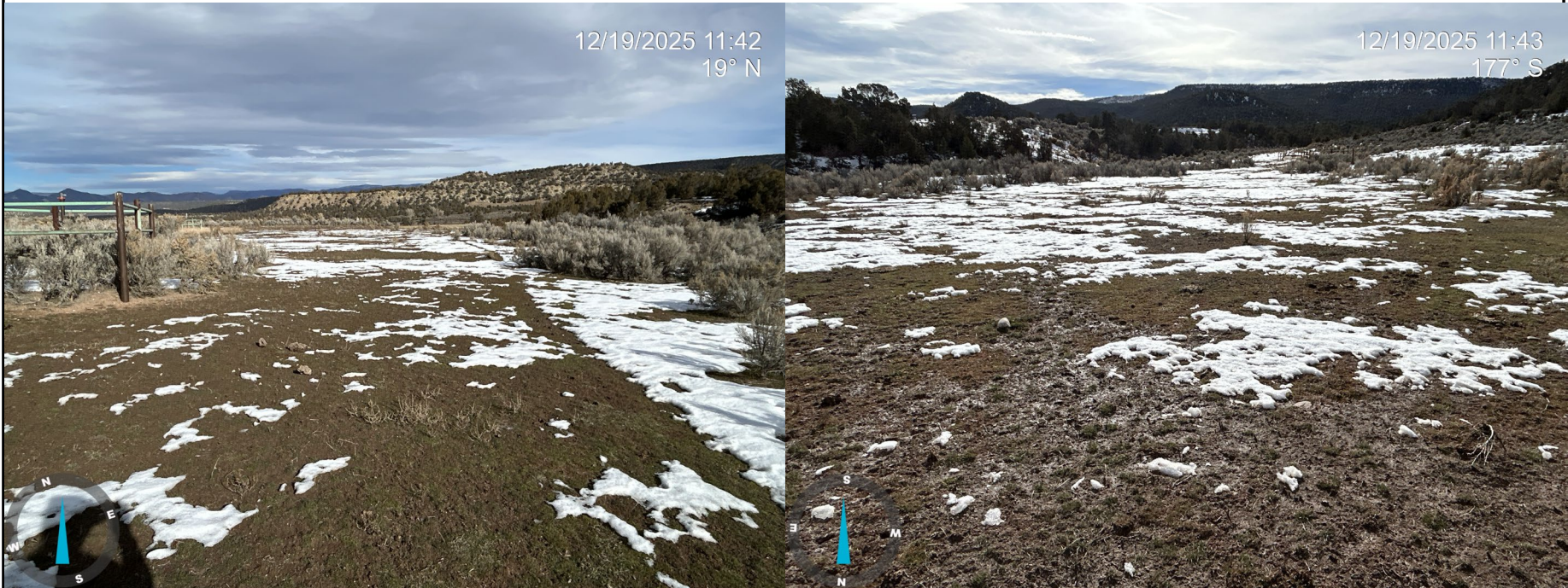
Photo 1: Photos showing an overview of the location looking north and south, respectively. The Corrective Action to perform additional 1004 reclamation efforts remains outstanding.