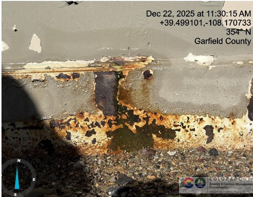
Photo # 4821 Mechanical Condition - Possible separator leak & staining near separator