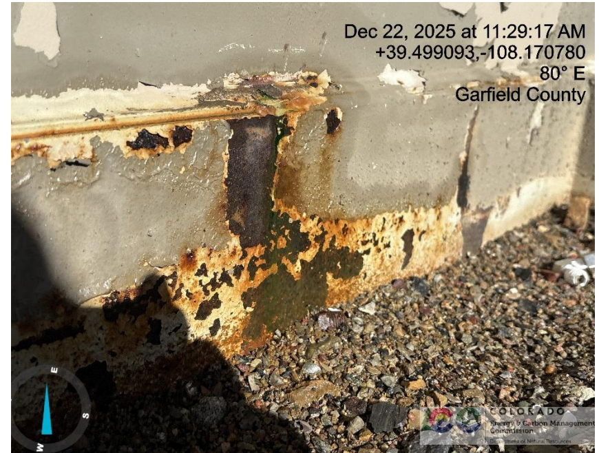
Photo # 4822 Mechanical Condition - Possible separator leak & staining near separator