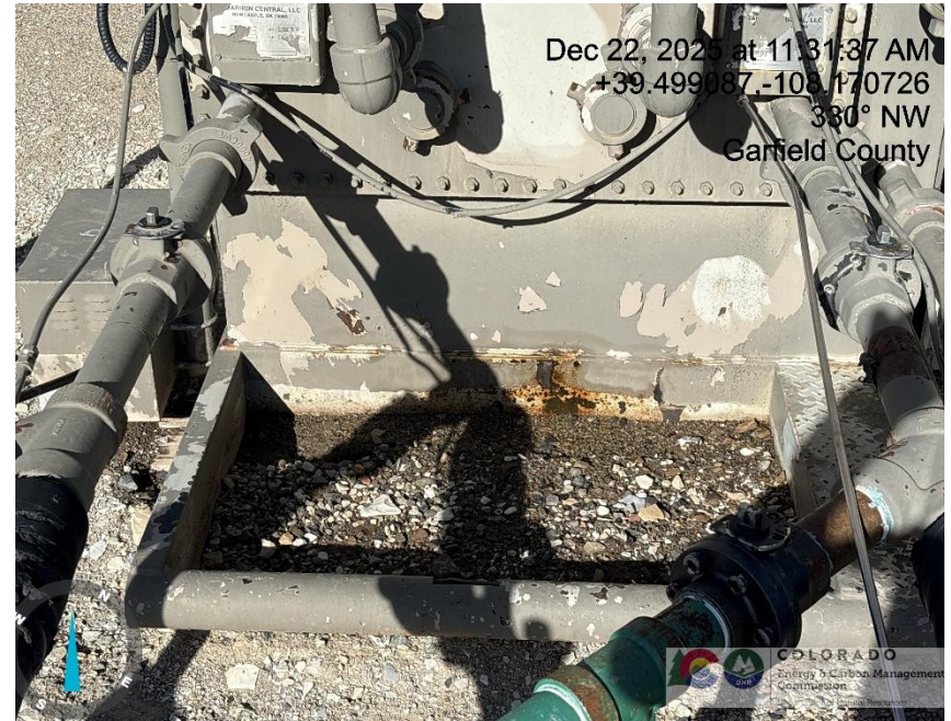
Photo # 4823 Mechanical Condition - Possible separator leak & staining near separator