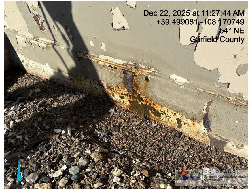
Photo # 4820 Mechanical Condition - Possible separator leak & staining near separator