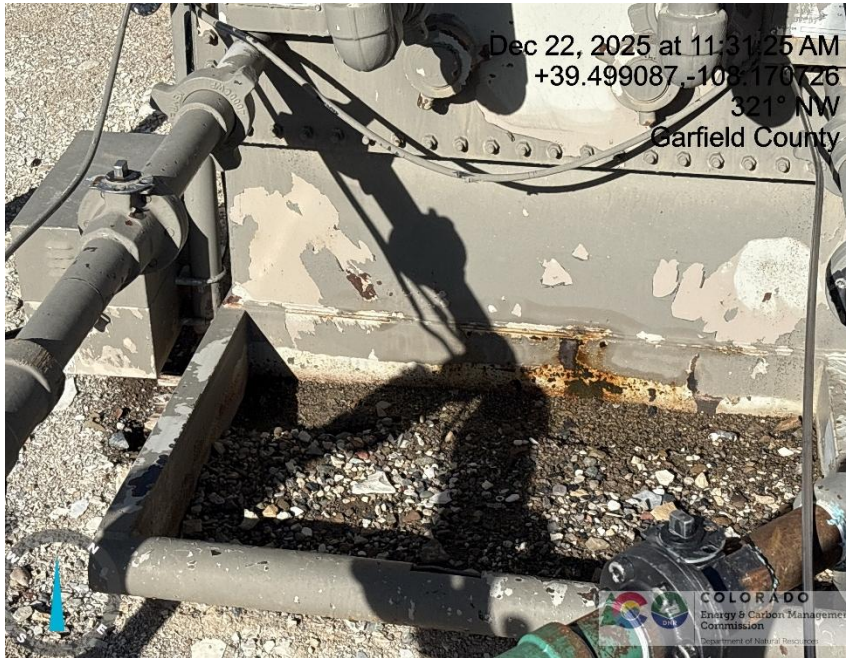
Photo # 4819 Mechanical Condition - Possible separator leak & staining near separator