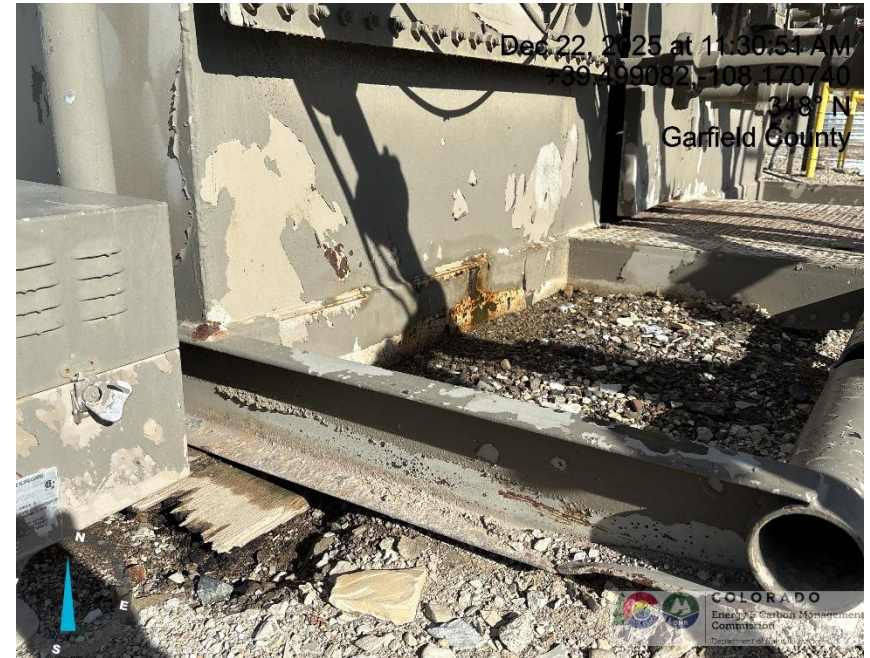
Photo # 4818 Mechanical Condition - Possible separator leak & staining near separator