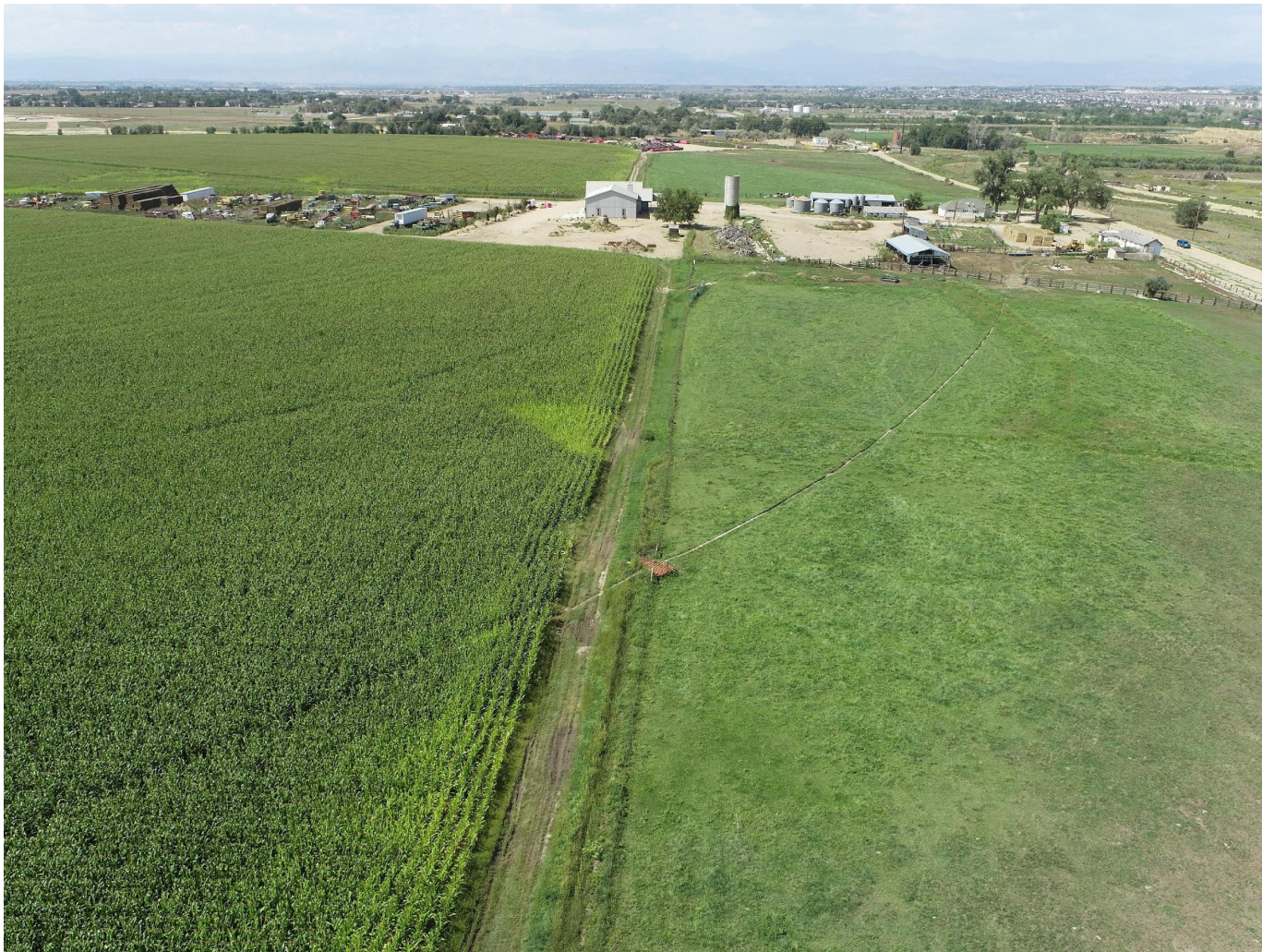
Photo 6. Drone aerial imagery taken east of well location, facing west (displaying the well, presumed flowline, and access road).