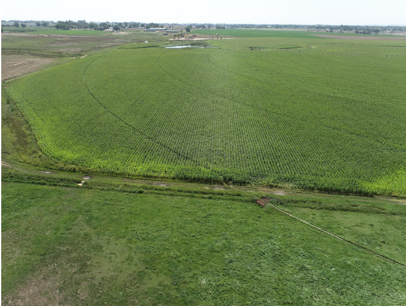
Photo 5. Drone aerial imagery taken north of well location, facing south (displaying the well).