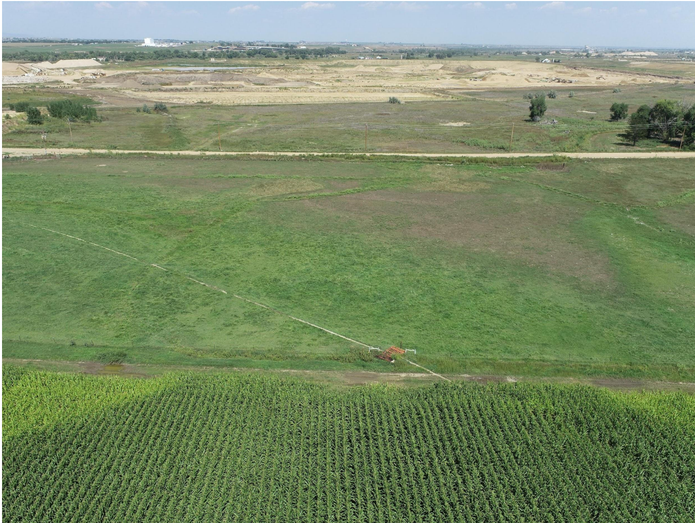
Photo 3. Drone aerial imagery taken south of well location, facing north (displaying the well).