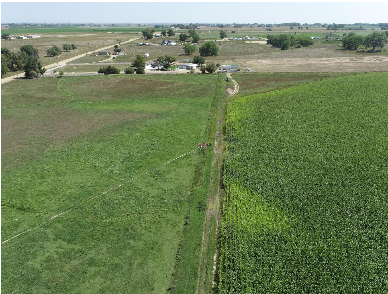
Photo 4. Drone aerial imagery taken west of well location, facing east (displaying the well and access road.)