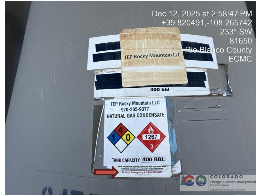
Photo # 0076 Production tank contains disconnected emergency contact number