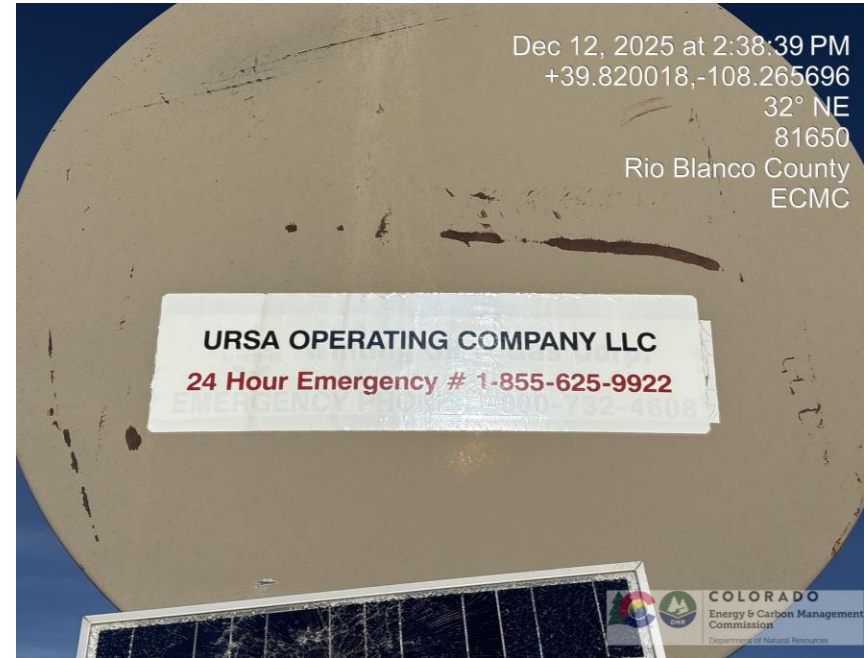
Photo # 0044 Methanol tank label contains incorrect operator name and disconnected emergency contact number