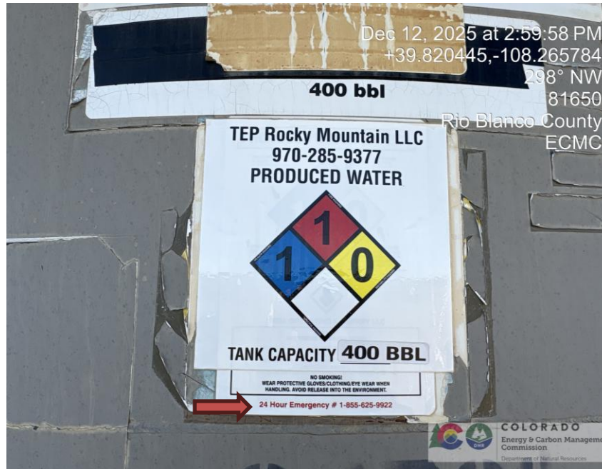
Photo # 0081 Production tank contains disconnected emergency contact number