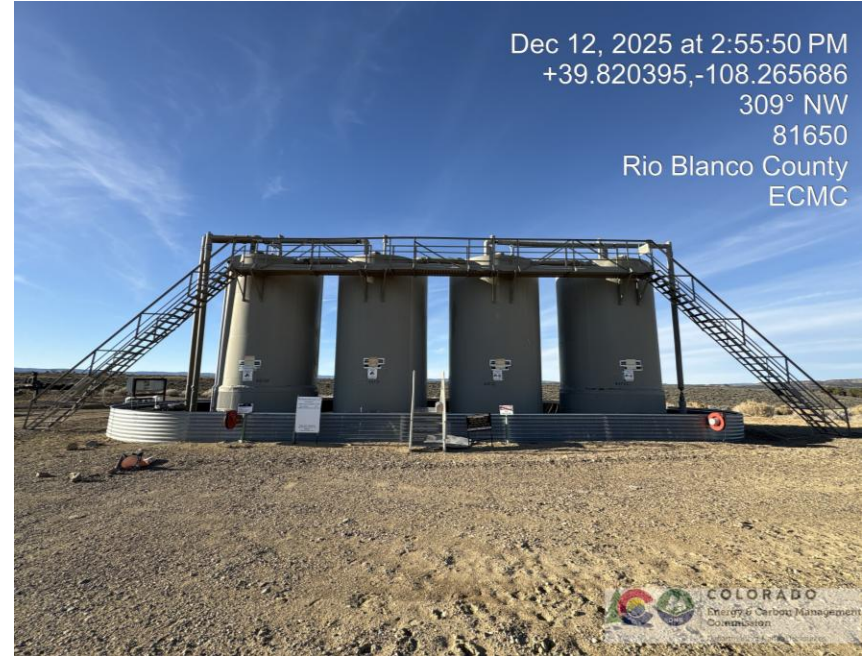
Photo # 0066 PRV vent line does not comply with CECMC pressure safety device rules