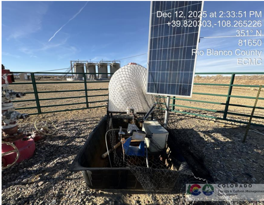
Photo # 0032 Unused equipment – Chemical tank with containment on location