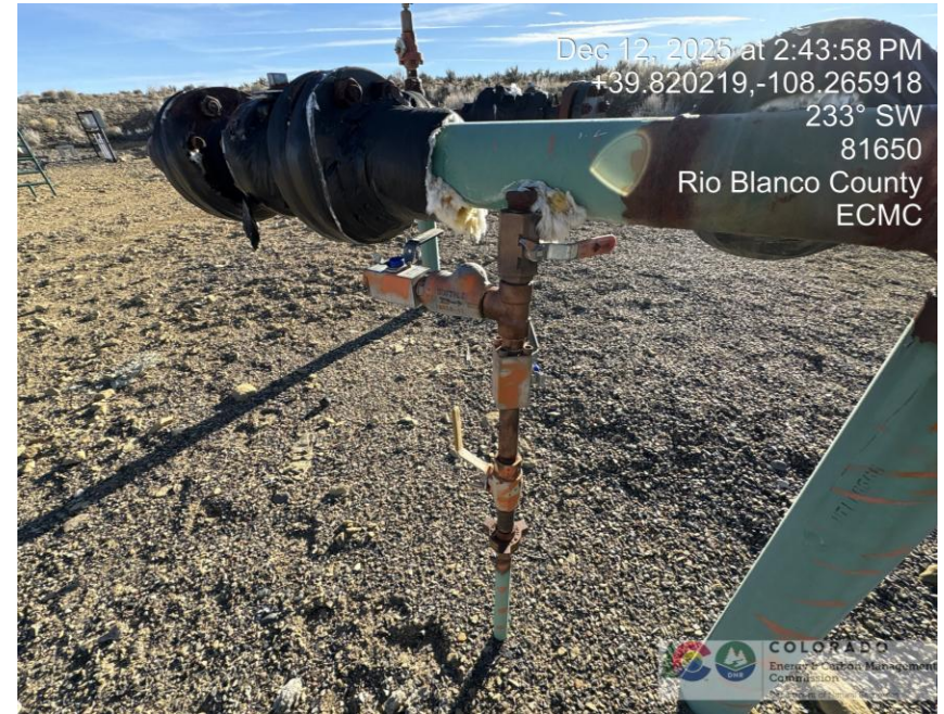
Photo # 0046 PRV vent line does not comply with CECMC pressure safety device rules