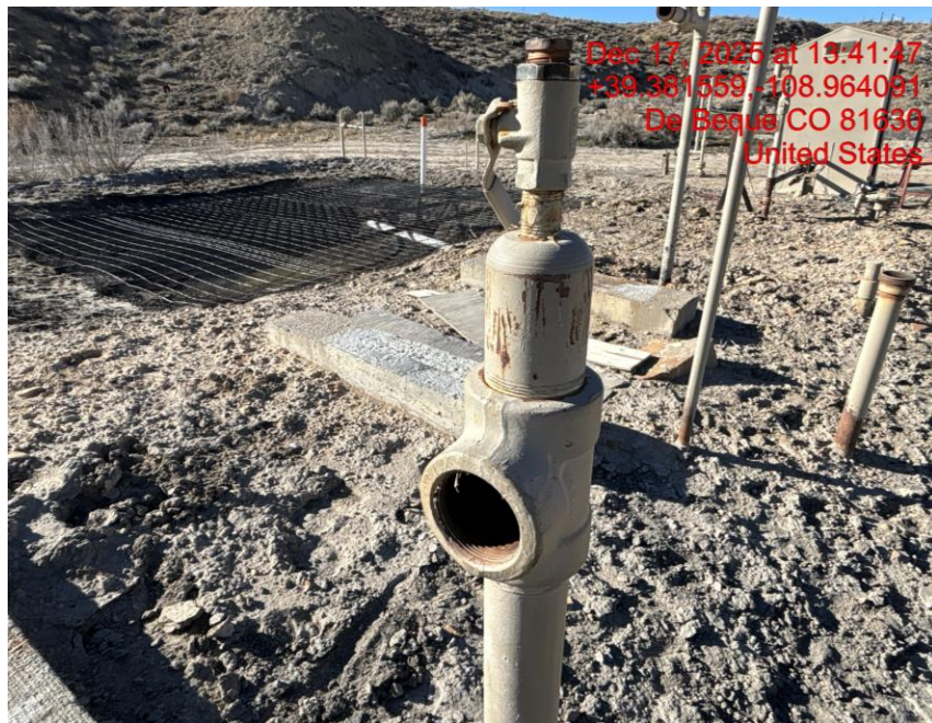
Open-Ended Line – Photo #02073