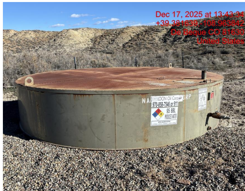
Location – Photo #02082