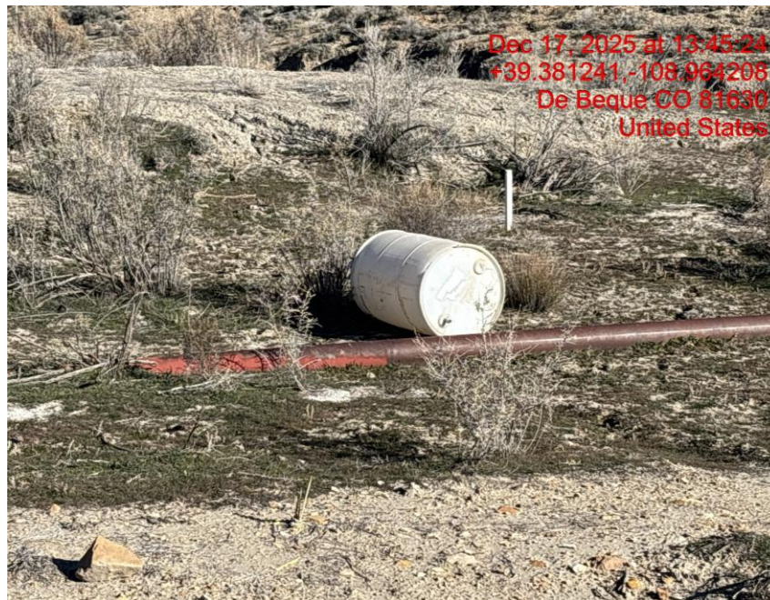
Debris/Stored Supplies – Photo #02080

Dec 17, 2025 at 13:45:24 +39.381241,-108.964208 De Beque CO 81630 United States