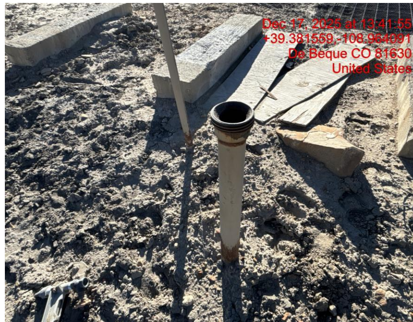
Open-Ended Line – Photo #02074