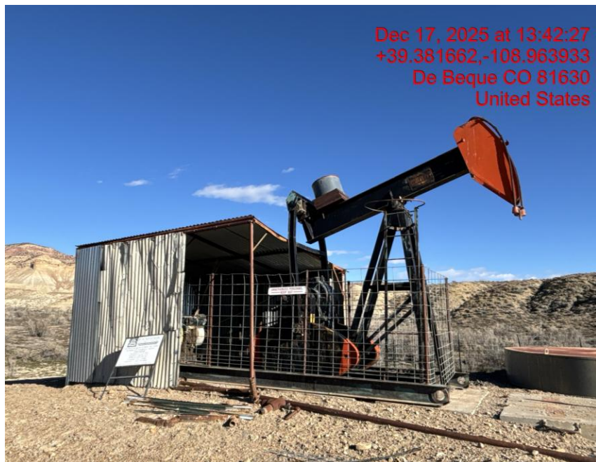
Location – Photo #02077