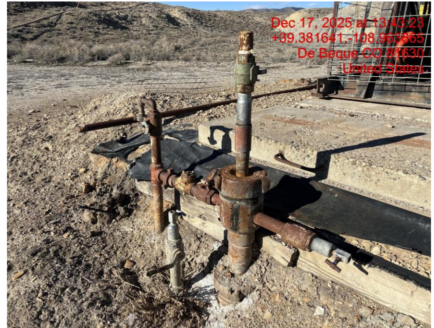
Location – Photo #02081