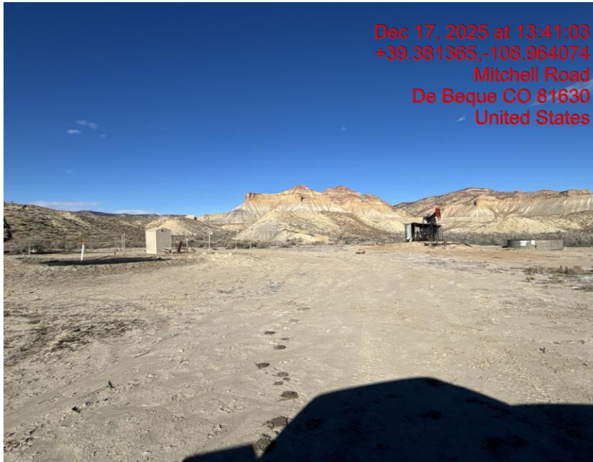
Location Overview – Photo #02071