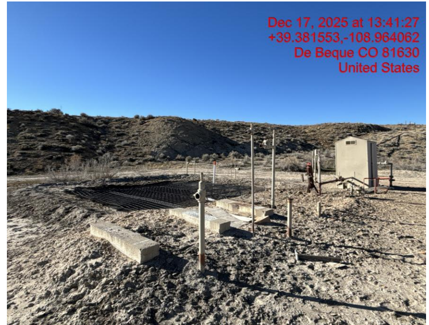
Location – Photo #02072