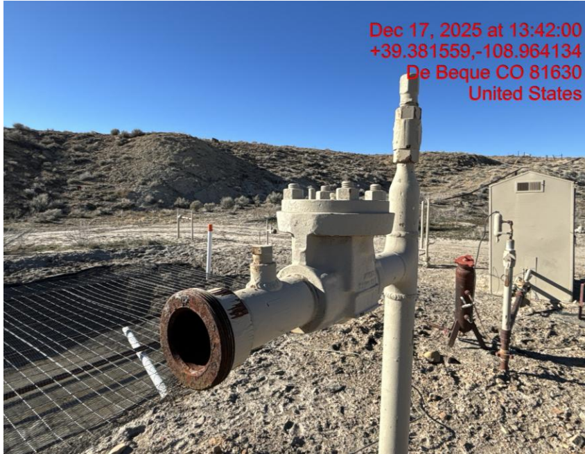
Open-Ended Line – Photo #02075