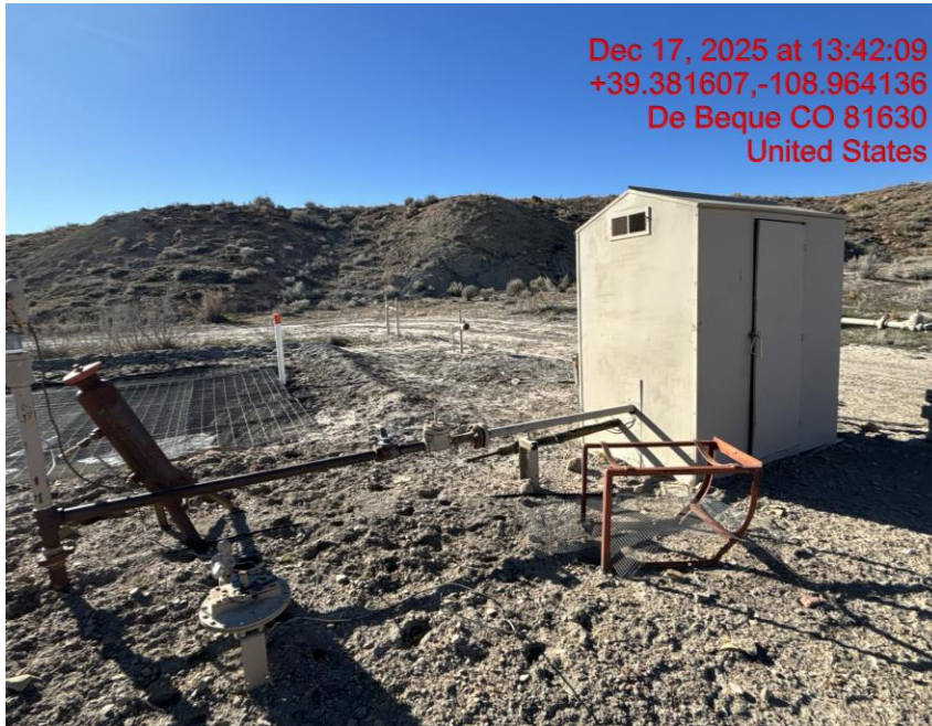
Location – Photo #02076