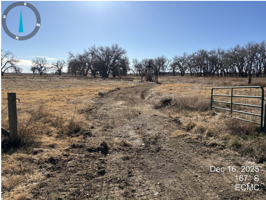
Photo 1. Looking south down the access road. Access road appears to have been recently graded.