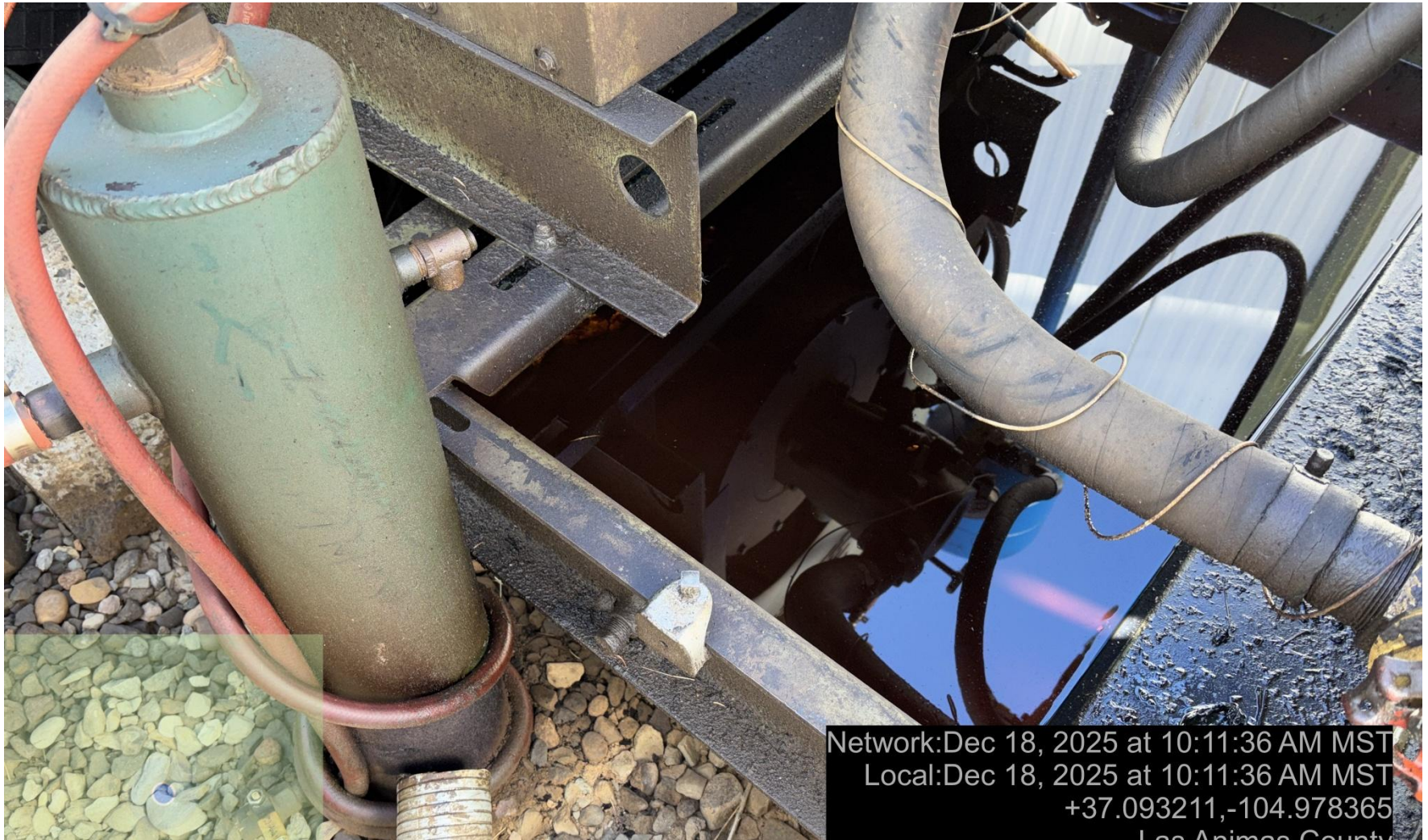
PHOTO 6: OIL IN PRIME MOVER ENGINE SKID WITHOUT WILDLIFE PROTECTION NET OR SCREEN (IT APPEARS THE ENGINE OIL HAS BEEN DRAINED DIRECTLY INTO ENGINE SKID AND LEFT, THIS PRACTICE SHOULD STOP IMMEDIATELY). DRAIN OILY WASTE REPAIR ALL LEAKS AND REMOVE IMPACTED SOIL PER RULE 1002..(2).D & 1002.f.(2)B, Comply with general provisions of the oil and gas act for wildlife protection AND SB-181. CA DATE 12-19-2025.