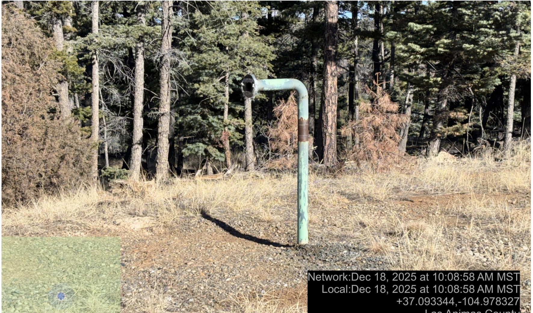
PHOTO 4: UNUSED OR UNUSEFUL EQUIPMENT (3" RISER OPEN TO ATMOSPHERE ON NORTH SIDE OF LOCATION). REMOVE UNUSED OR UNUSEFUL EQUIPMENT PER RULE 606. CA DATE 1-18-2025.