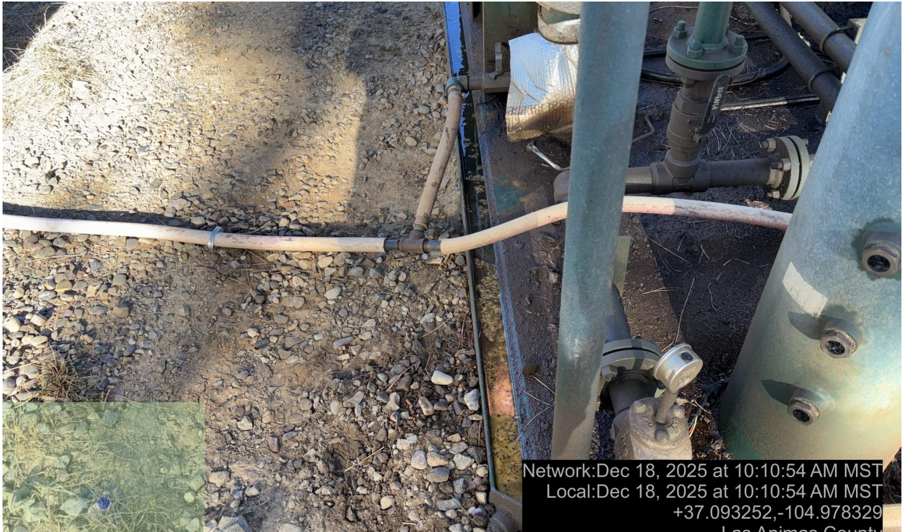
PHOTO 5: AREA OF IMPACTED SOIL NEAR COMPRESSOR. Conduct maintenance on equipment, cleanup stained material and review self inspection processes. COMPLY WITH RULE 1002,,(2).D. CA DATE 1-18-2025.