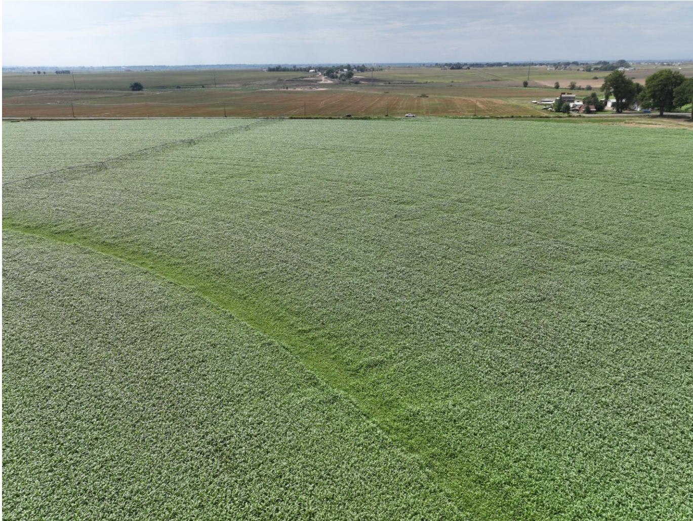
Photo 5. Drone aerial imagery taken north of well location, facing south (displaying the well).