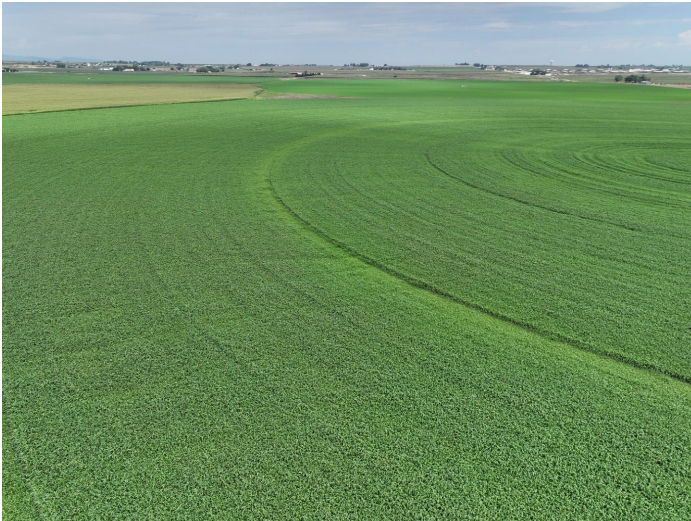
Photo 3. Drone aerial imagery taken south of well location, facing north (displaying the well).