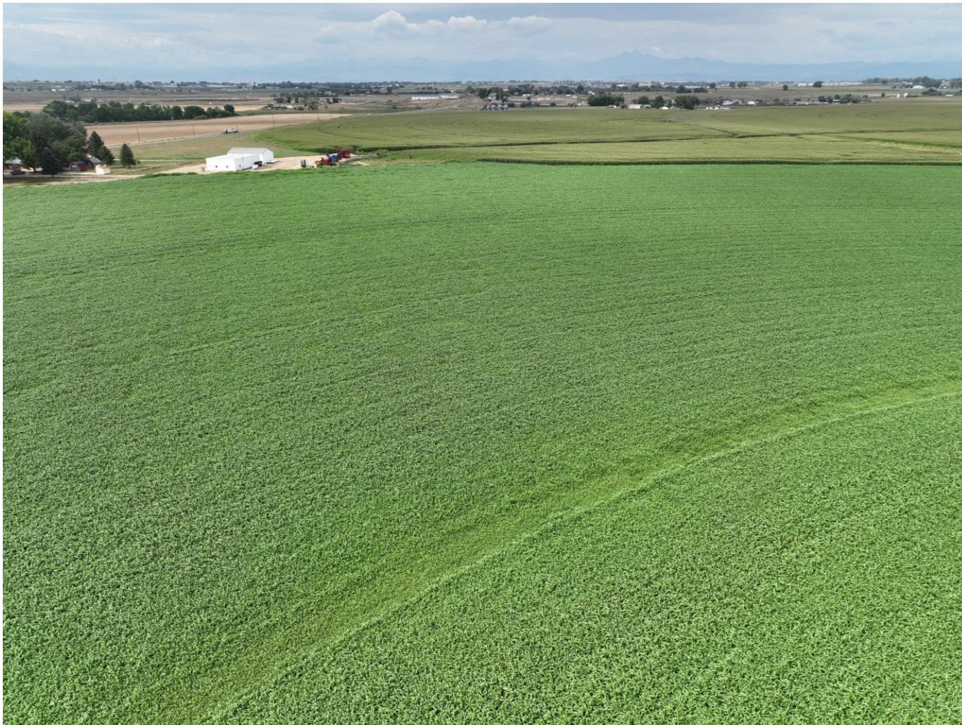
Photo 6. Drone aerial imagery taken east of well location, facing west (displaying the well).