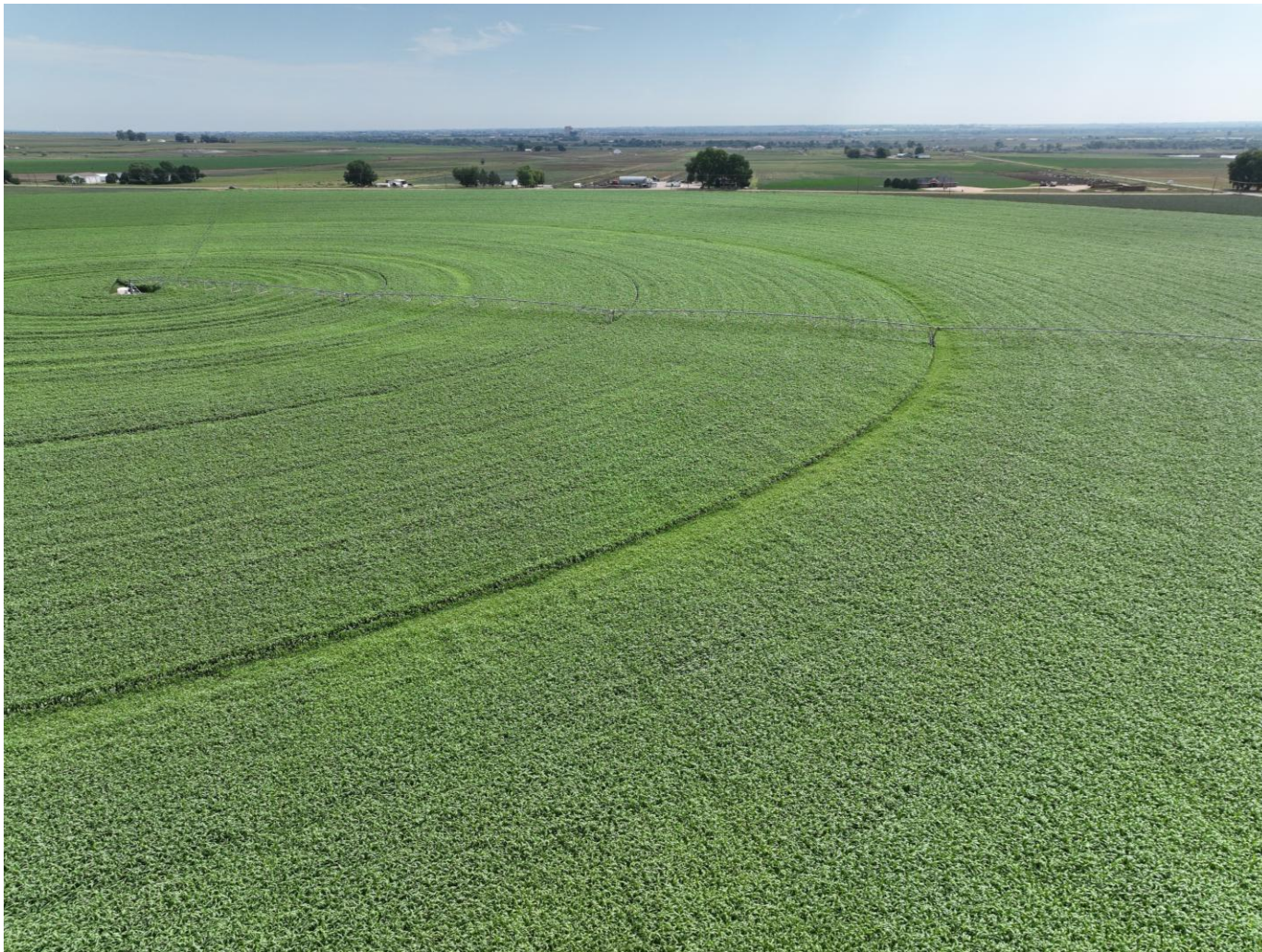
Photo 4. Drone aerial imagery taken west of well location, facing east (displaying the well, access road, presumed flowline, and TB). Crop vegetation at the well pad and access road appears consistent with adjacent reference areas.