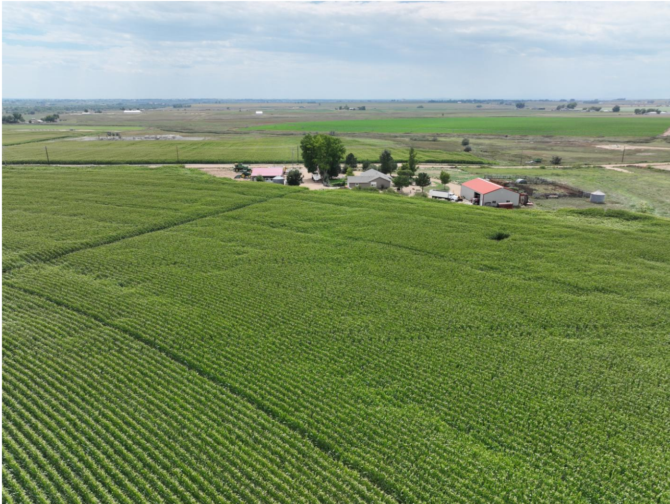
Photo 5. Drone aerial imagery taken north of well location, facing south (displaying the well, access road, and presumed flowline). Crop vegetation at the well pad and access road is consistent with adjacent reference areas.