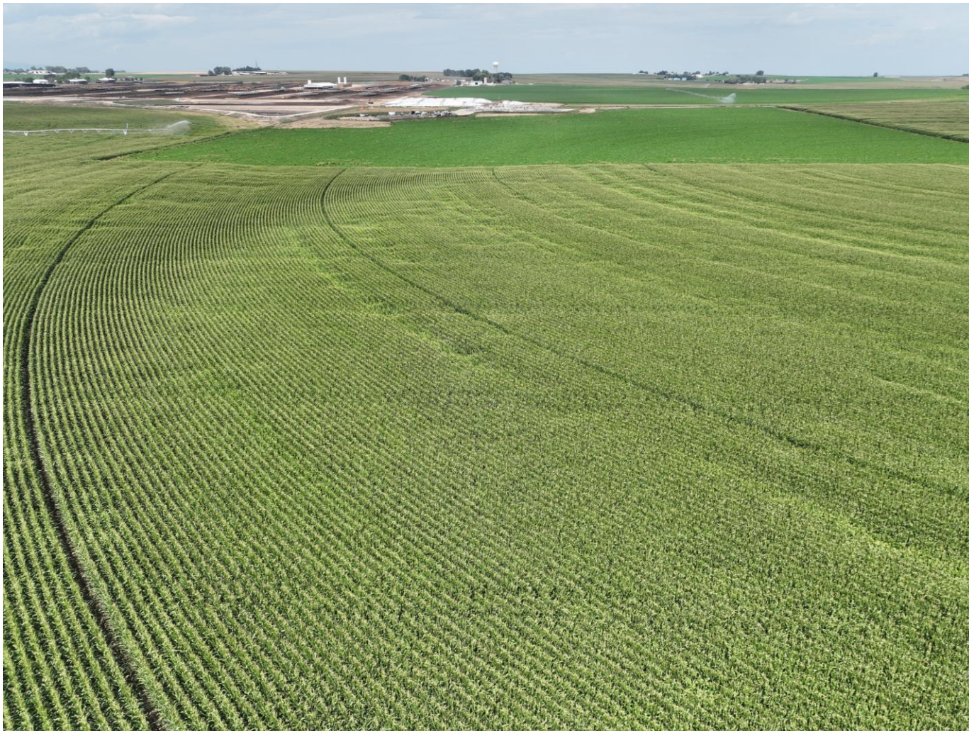
Photo 3. Drone aerial imagery taken south of well location, facing north (displaying the well).