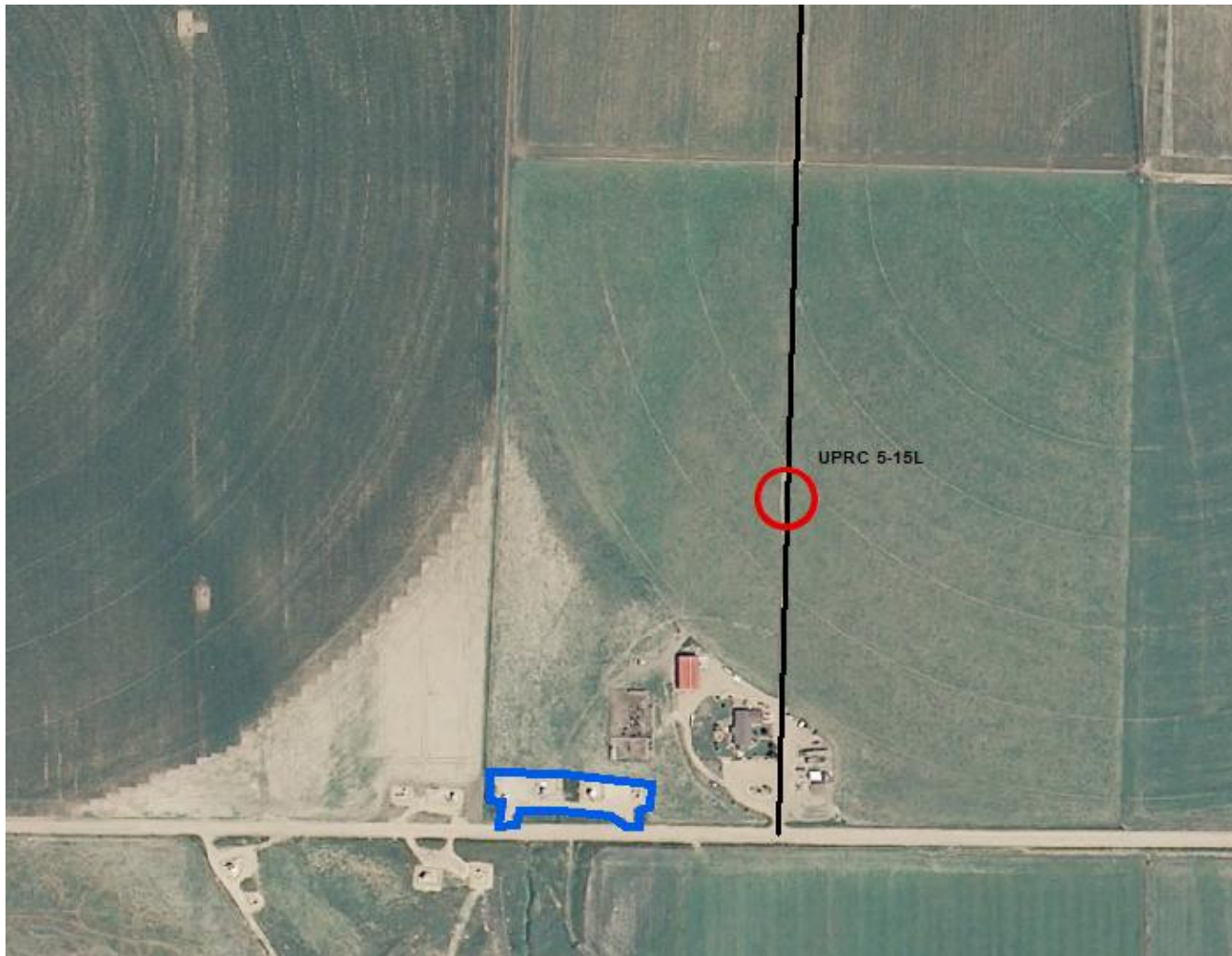
Photo 1. NAIP aerial imagery (2009) illustrating the well location (red circle), associated tank battery location (blue polygon), and well access road. The tank battery is associated with location ID #329742.