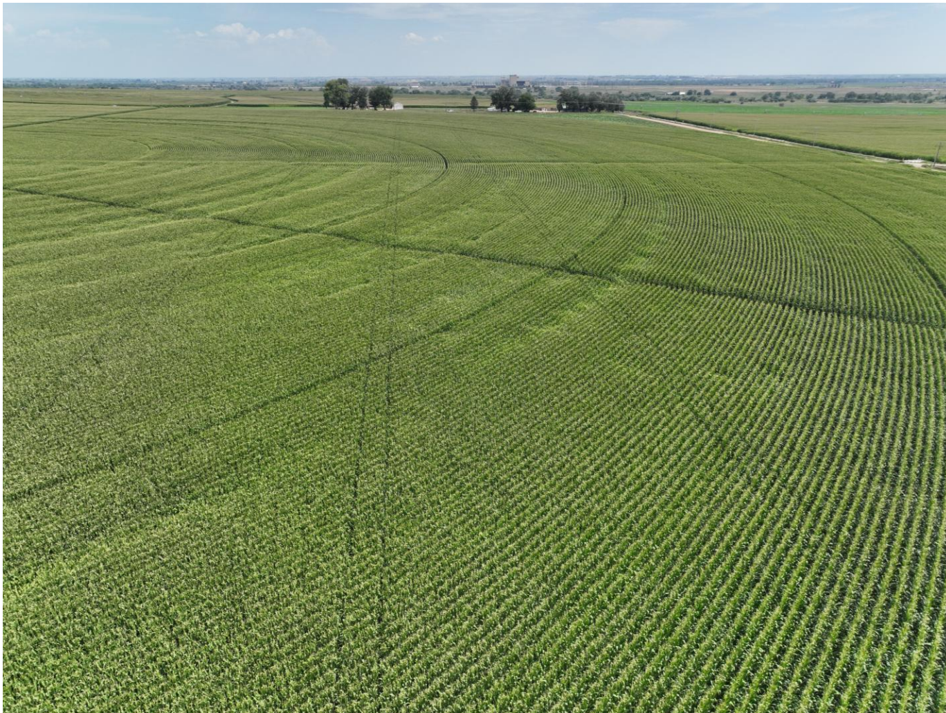
Photo 4. Drone aerial imagery taken west of well location, facing east (displaying the well).