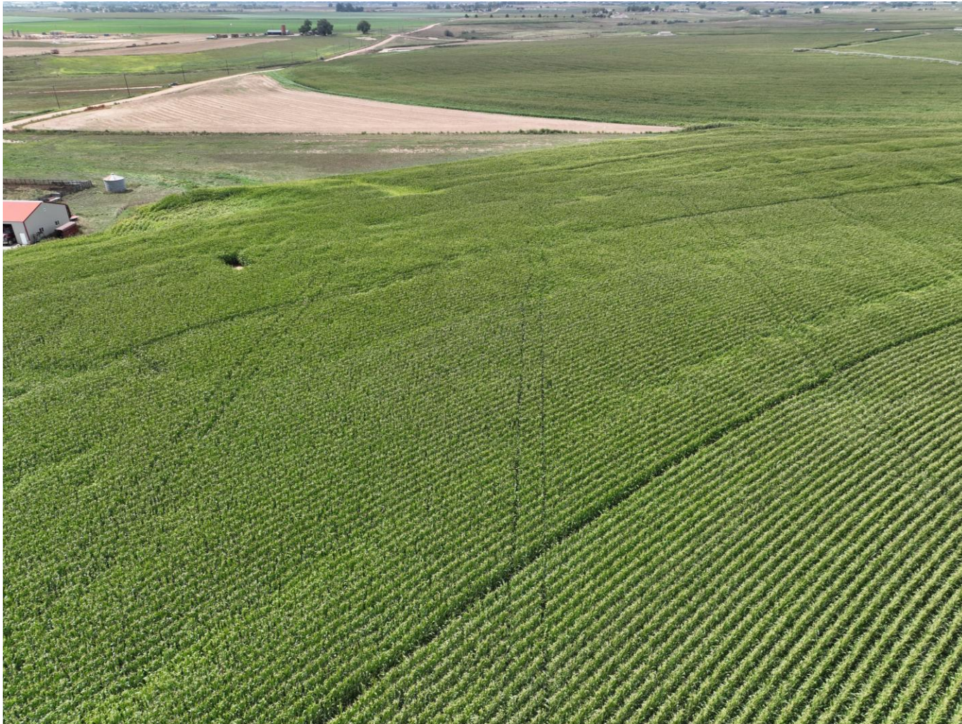
Photo 6. Drone aerial imagery taken east of well location, facing west (displaying the well).