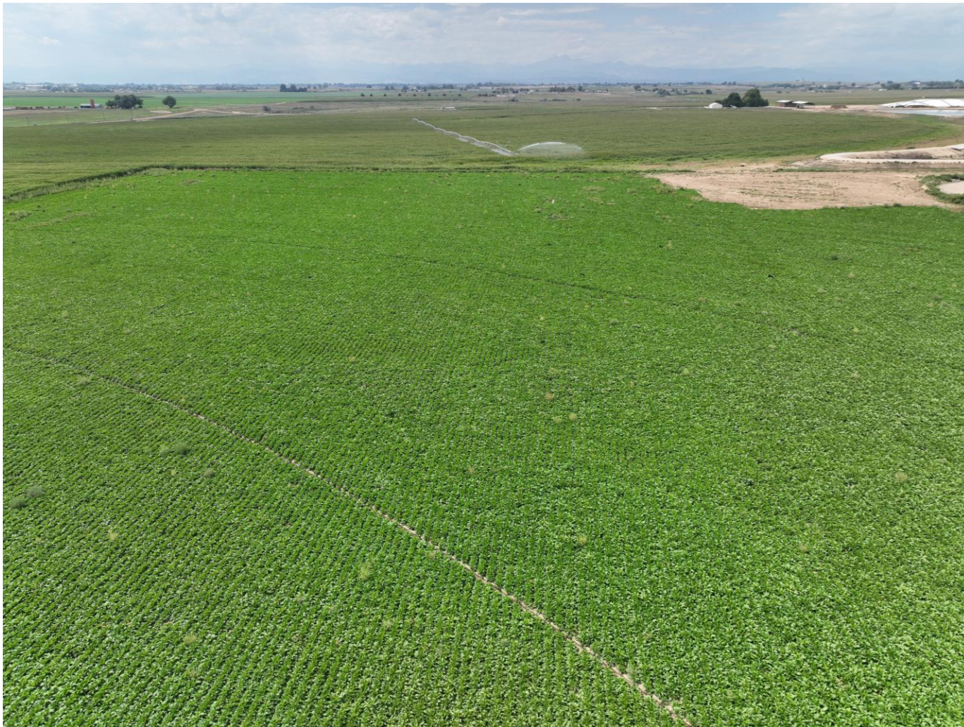
Photo 6. Drone aerial imagery taken east of well location, facing west (displaying the well).