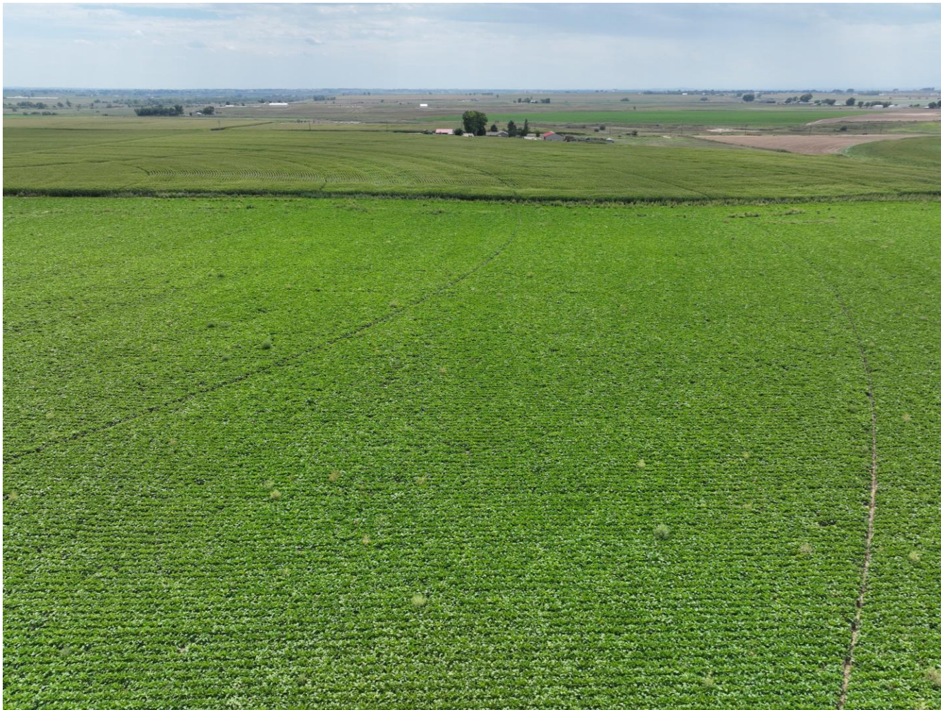
Photo 5. Drone aerial imagery taken north of well location, facing south (displaying the well, access road, and presumed flowline). Crop vegetation at the well pad and access road appears consistent with adjacent reference areas.