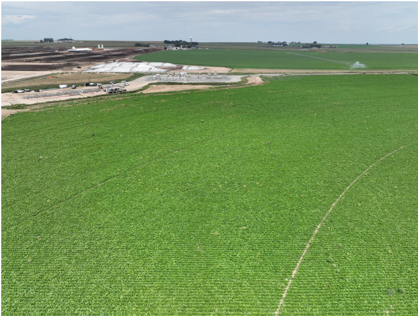
Photo 3. Drone aerial imagery taken south of well location, facing north (displaying the well).