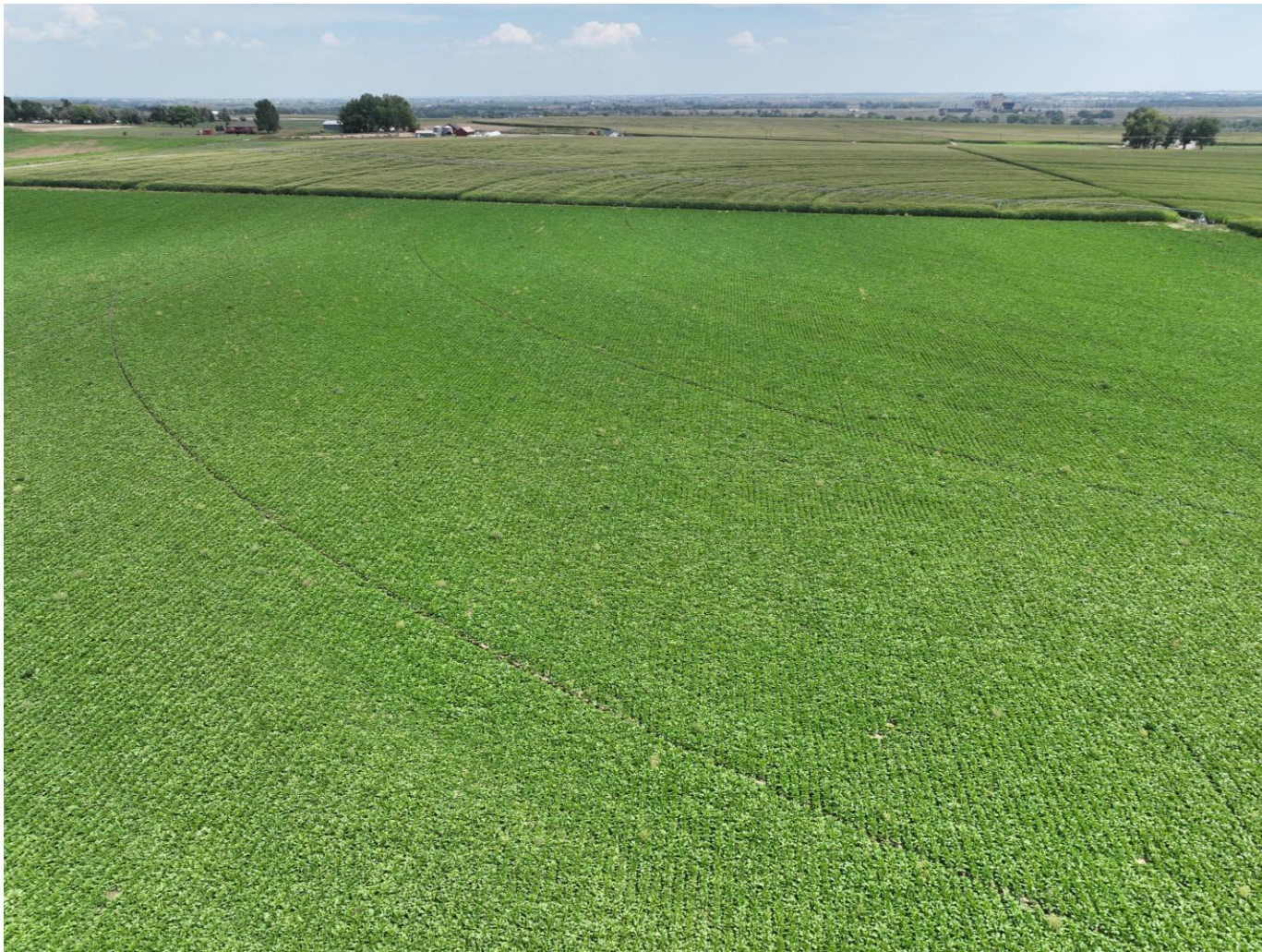
Photo 4. Drone aerial imagery taken west of well location, facing east (displaying the well).