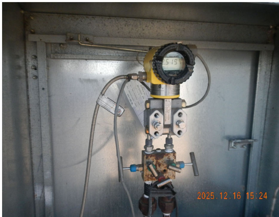
3. Gas Meter inside Flowline mounted Meter Box.