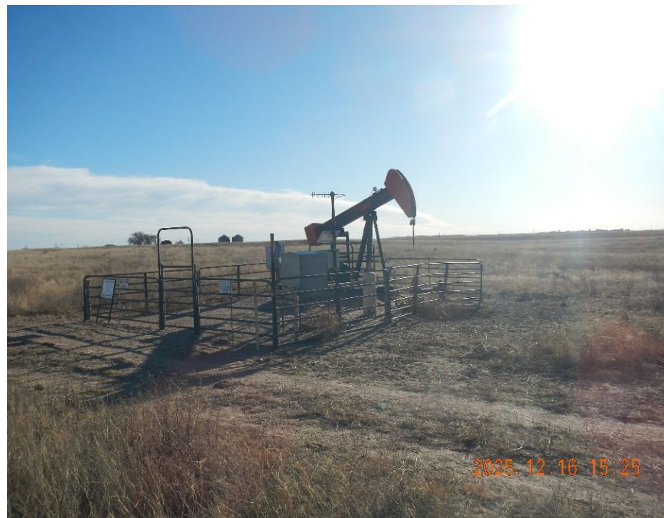
4. Well location overview.