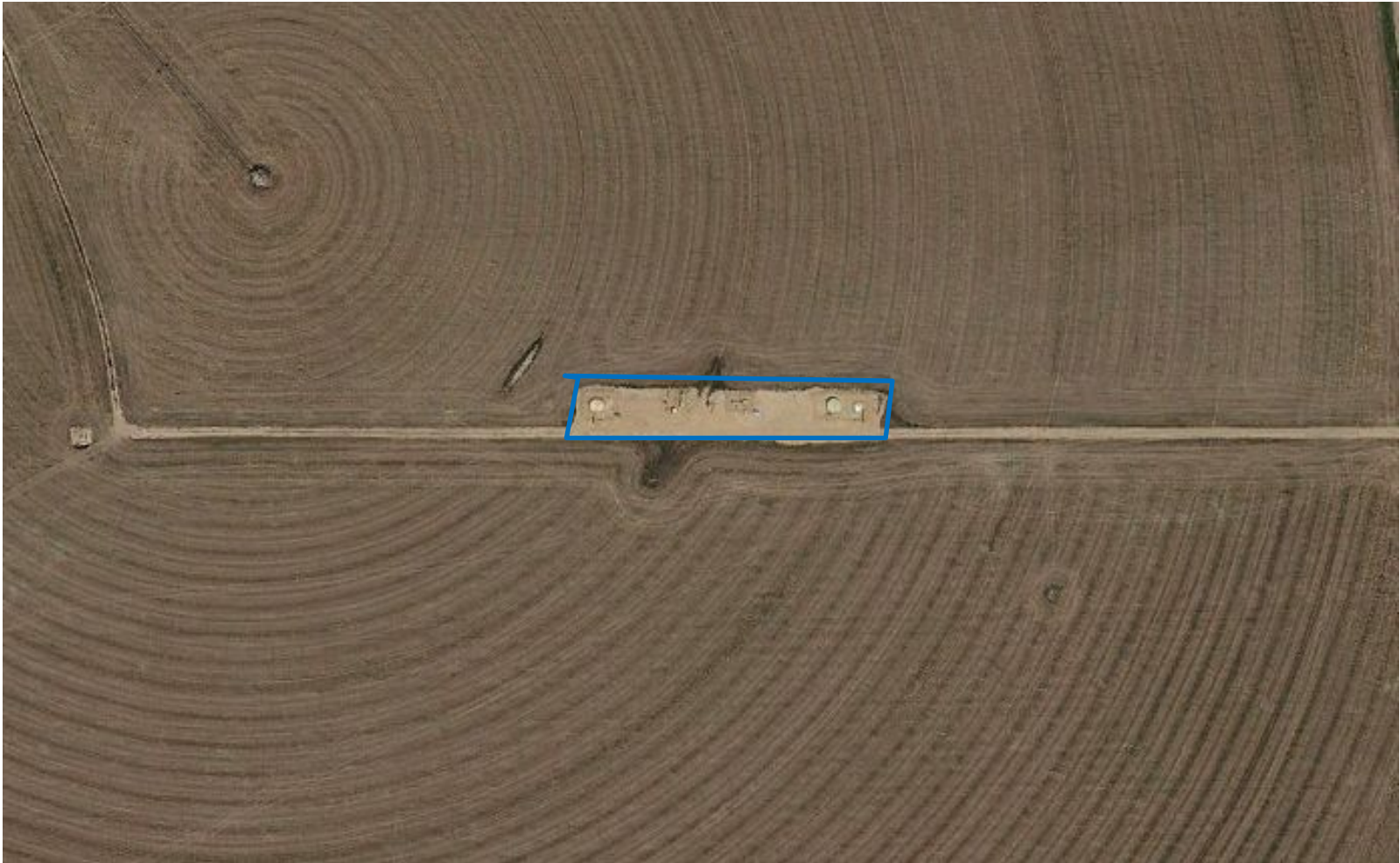
Photo 1. 2017 aerial imagery of the tank battery location (highlighted in blue).