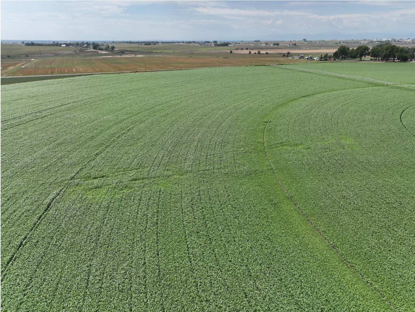
Photo 3. Drone aerial imagery taken north of TB location, facing south (displaying the TB). Crop vegetation at the tank battery appear consistent with adjacent reference areas.