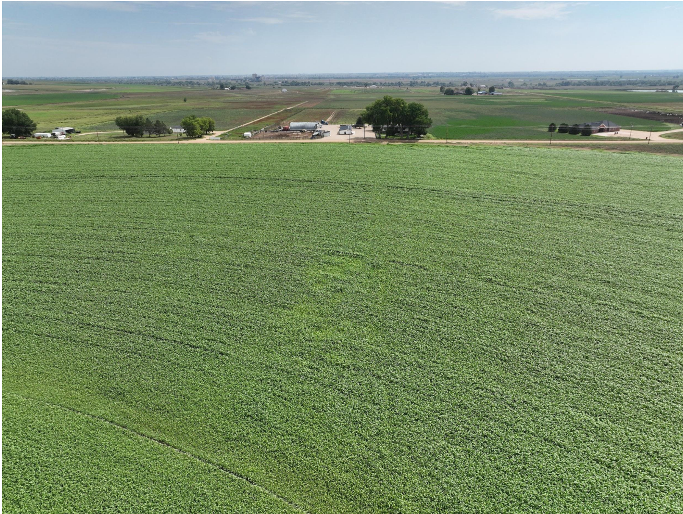
Photo 2. Drone aerial imagery taken west of TB location, facing east (displaying the TB).