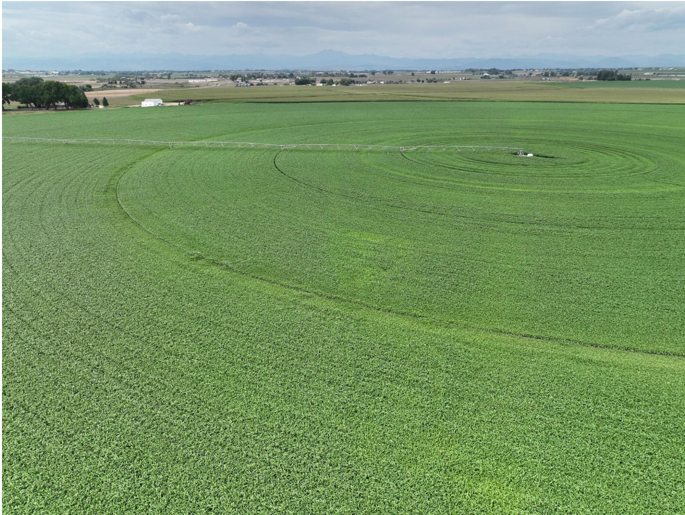
Photo 4. Drone aerial imagery taken east of TB location, facing west (displaying the TB).