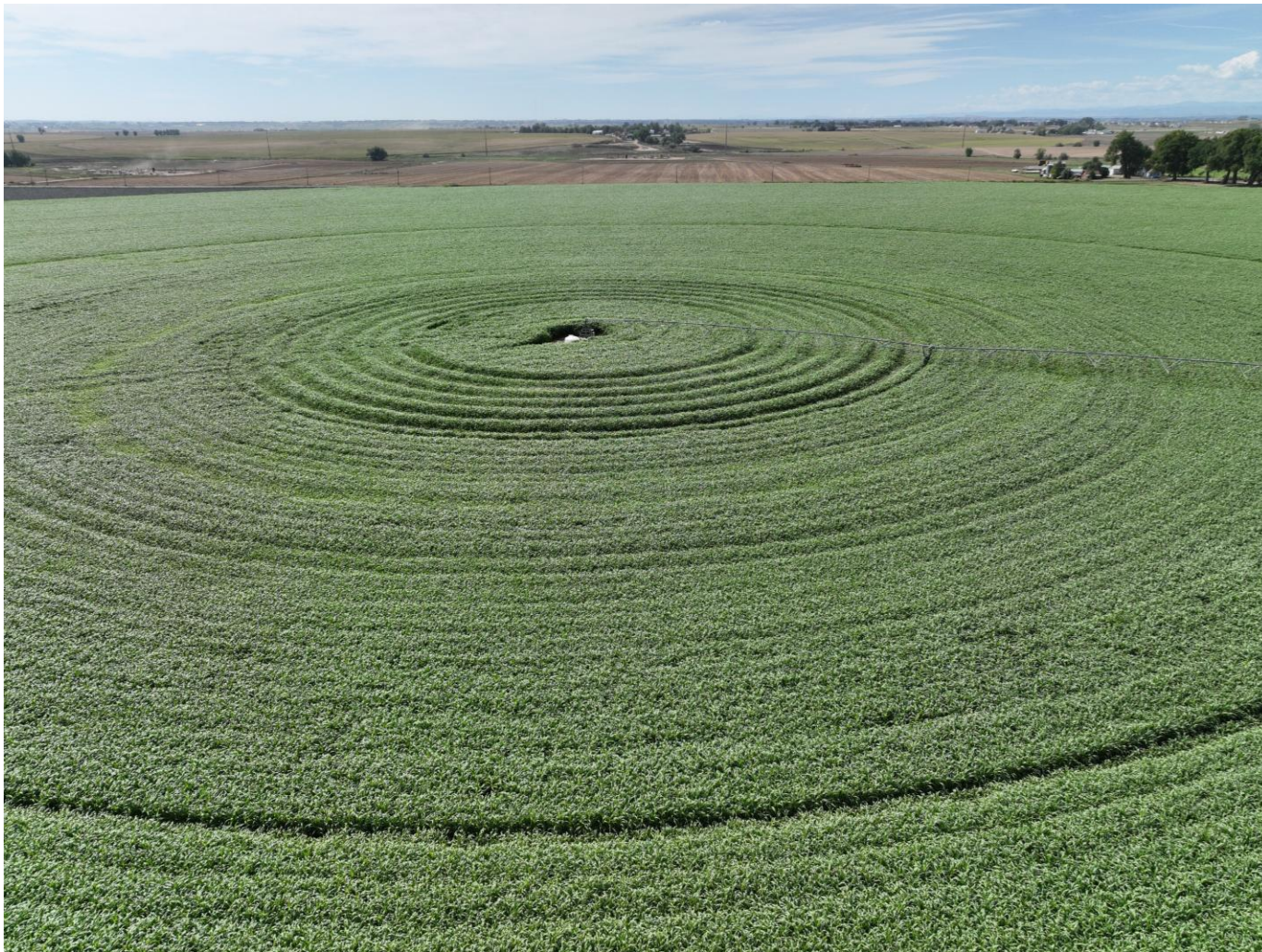
Photo 5. Drone aerial imagery taken north of well location, facing south (displaying the well).