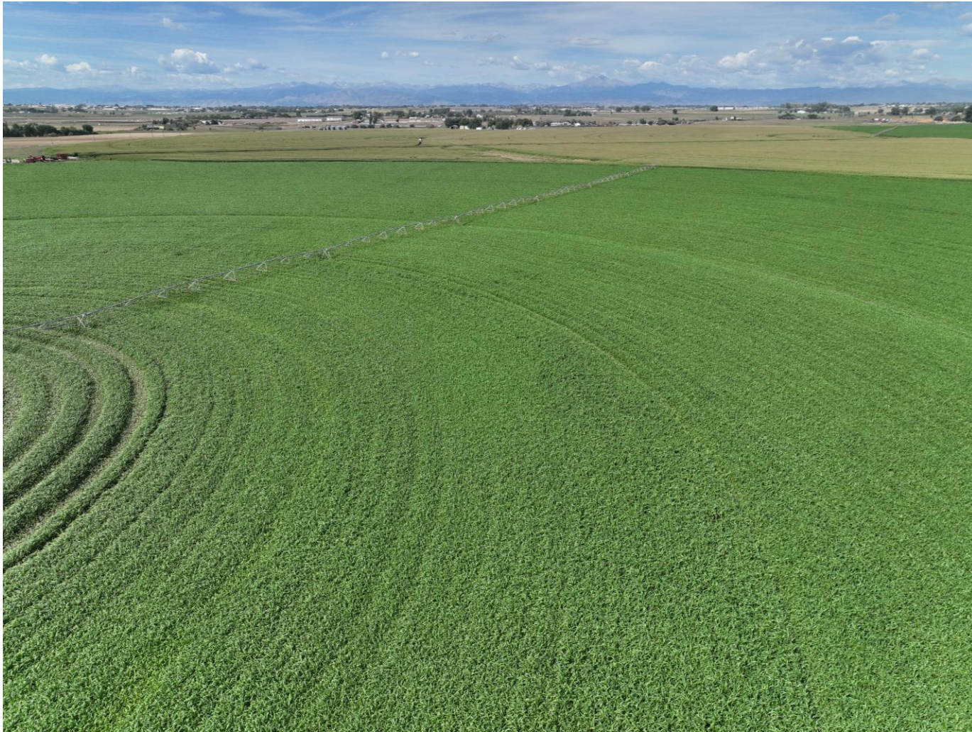
Photo 6. Drone aerial imagery taken east of well location, facing west (displaying the well).