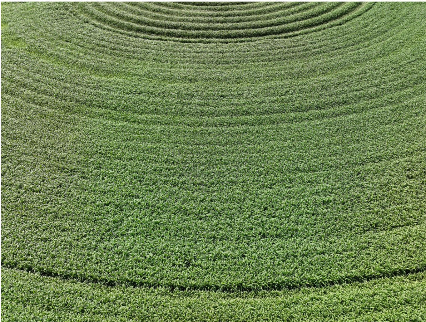
Photo 7. Drone aerial imagery above well location facing downward (displaying the well).