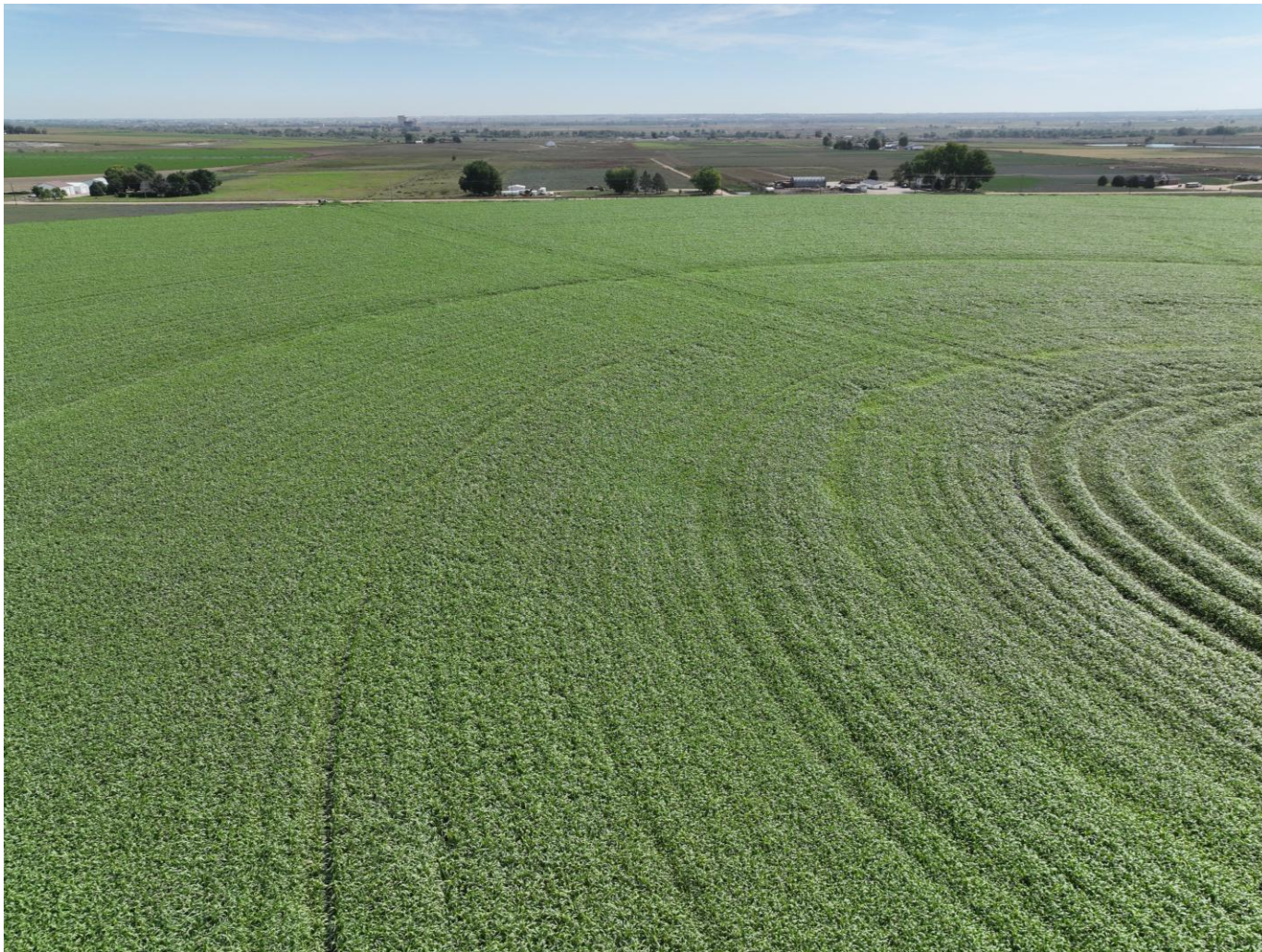
Photo 4. Drone aerial imagery taken west of well location, facing east (displaying the well, access road, presumed flowline, and TB). Crop vegetation at the well pad and access road appear consistent with adjacent reference areas.