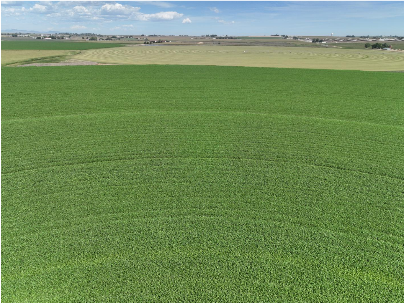
Photo 3. Drone aerial imagery taken south of well location, facing north (displaying the well).