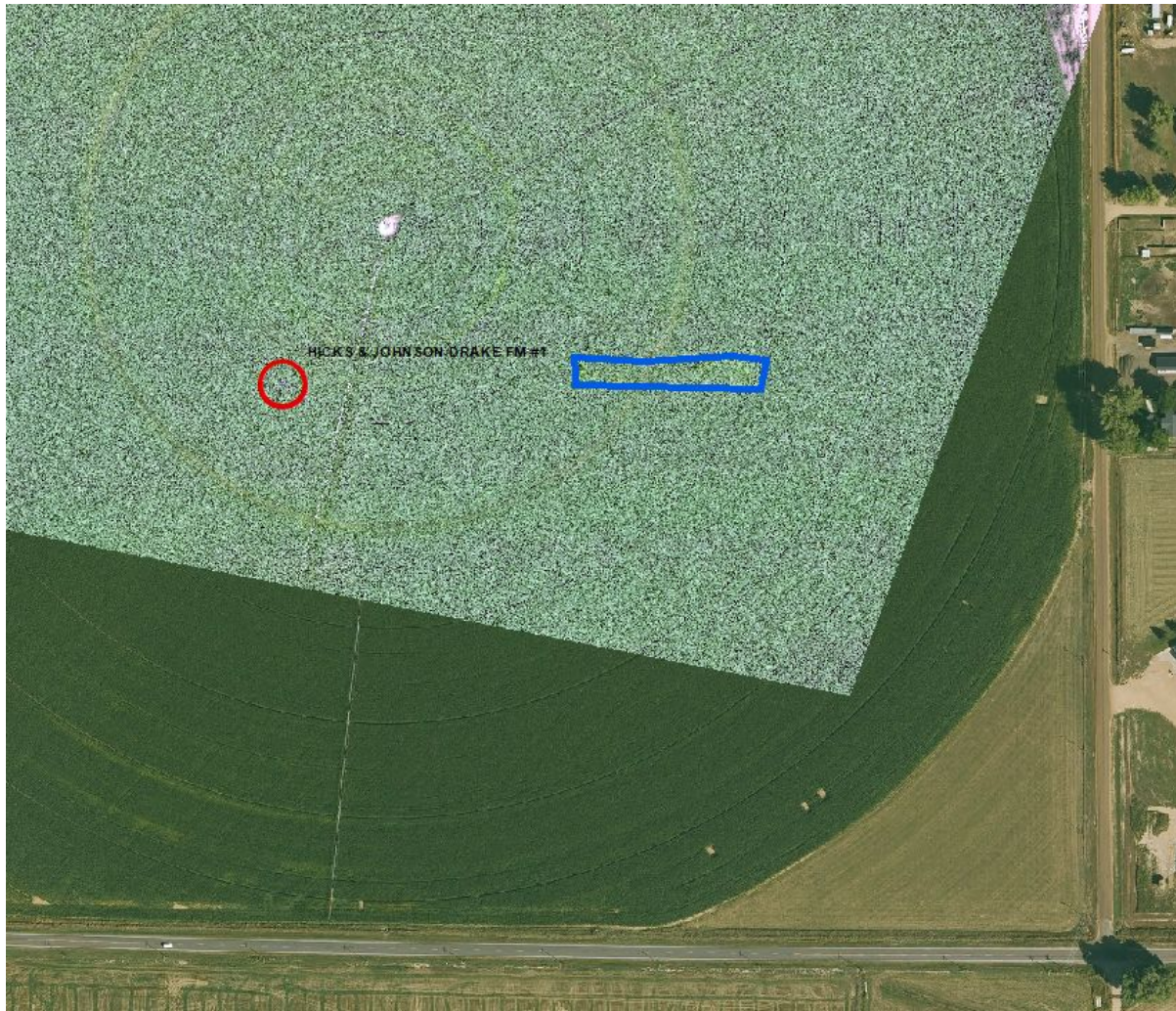
Photo 2. Orthomosaic (drone) imagery taken 8/29/2025 and NAIP aerial imagery (2023) illustrating the well location (red circle) and associated tank battery (blue polygon).