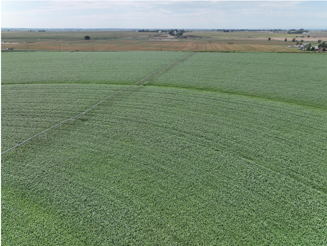
Photo 5. Drone aerial imagery taken north of well location, facing south (displaying the well).