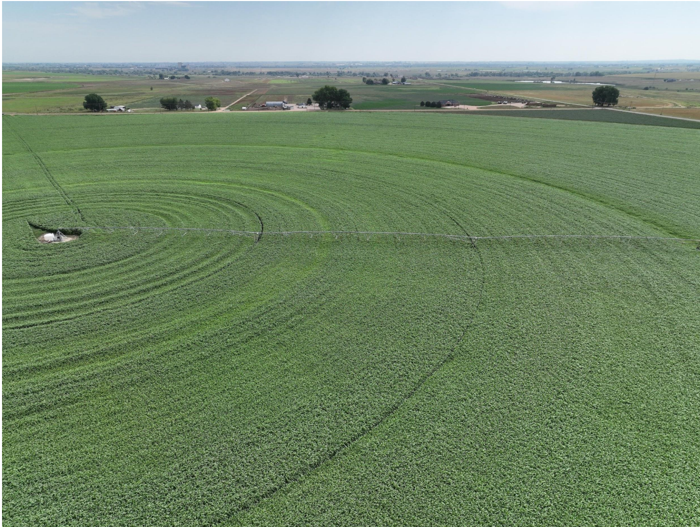
Photo 4. Drone aerial imagery taken west of well location, facing east (displaying the well, access road, presumed flowline, and TB). Crop vegetation at the well pad and access road appear consistent with adjacent reference areas.