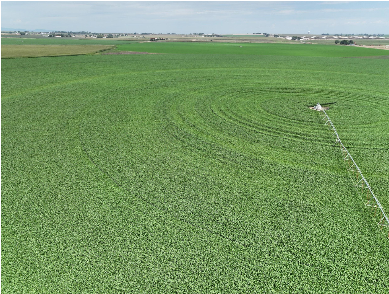
Photo 3. Drone aerial imagery taken south of well location, facing north (displaying the well).