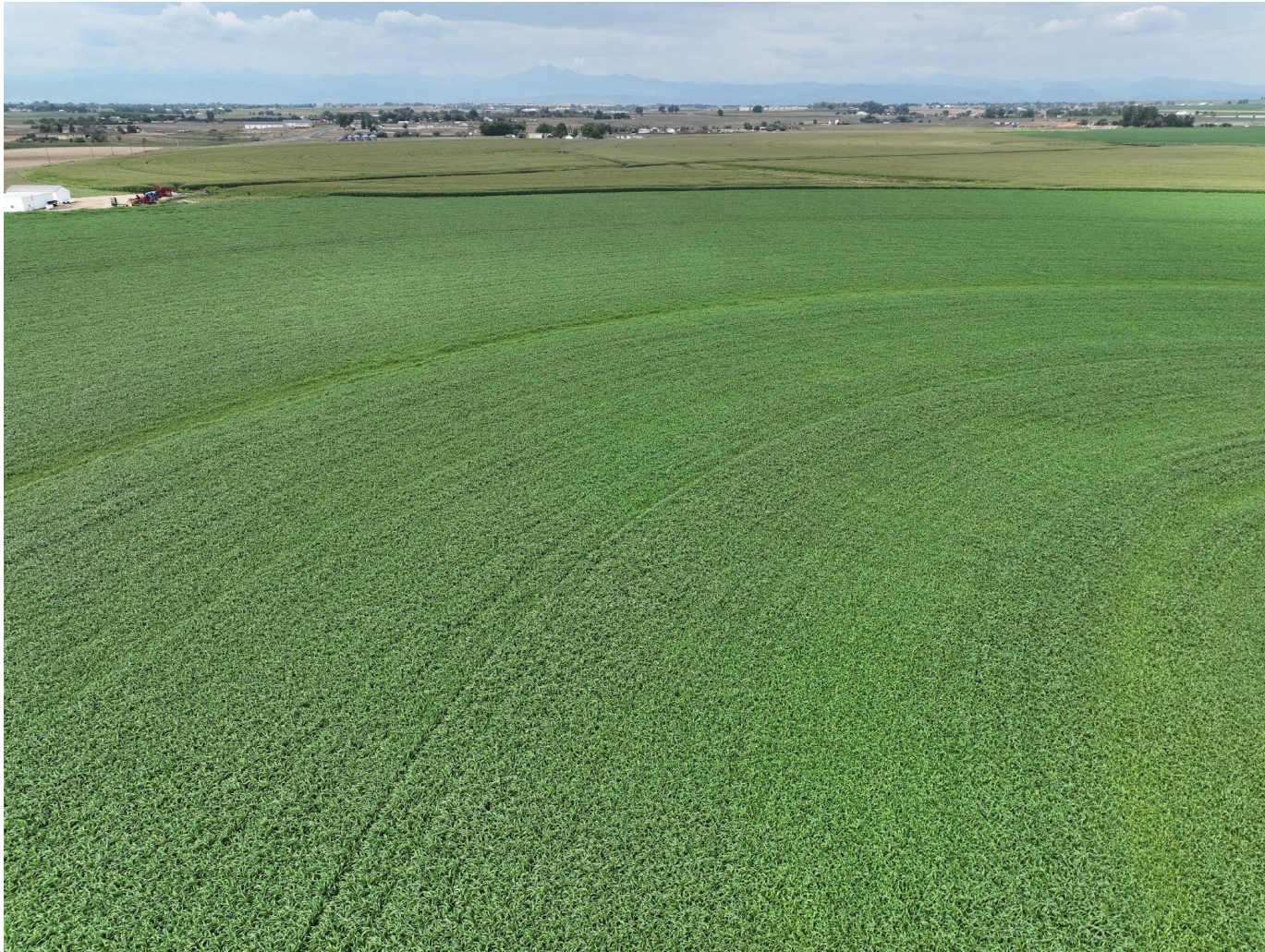
Photo 6. Drone aerial imagery taken east of well location, facing west (displaying the well).