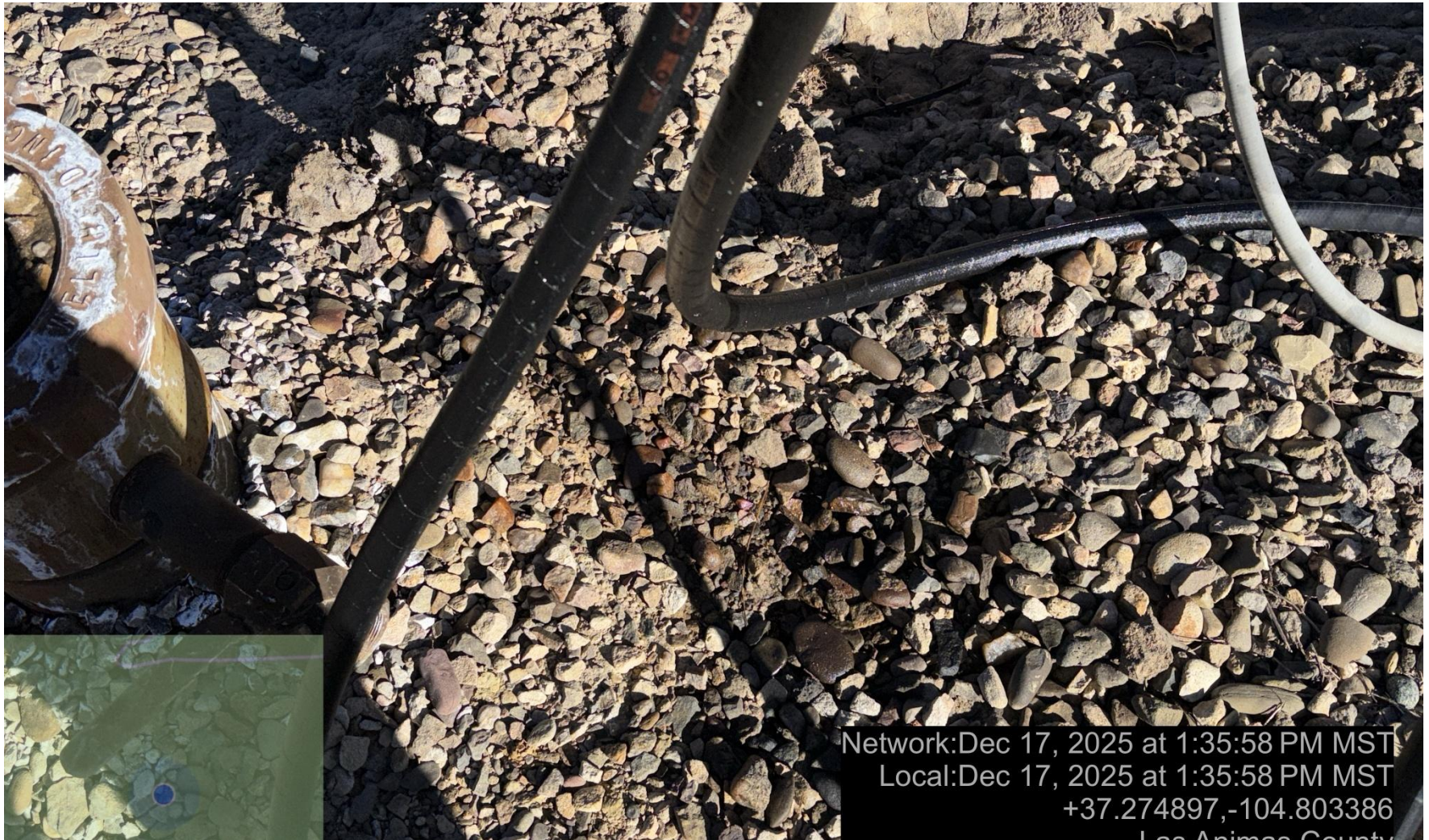
PHOTO 4: AREA OF IMPACTED SOIL UNDER A LEAK ON DRIVEHEAD. Conduct maintenance on equipment, cleanup stained material and review self inspection processes. COMPLY WITH RULE 1002,.(2).D. 1-1-2026. CA DATE 1-1-2026.