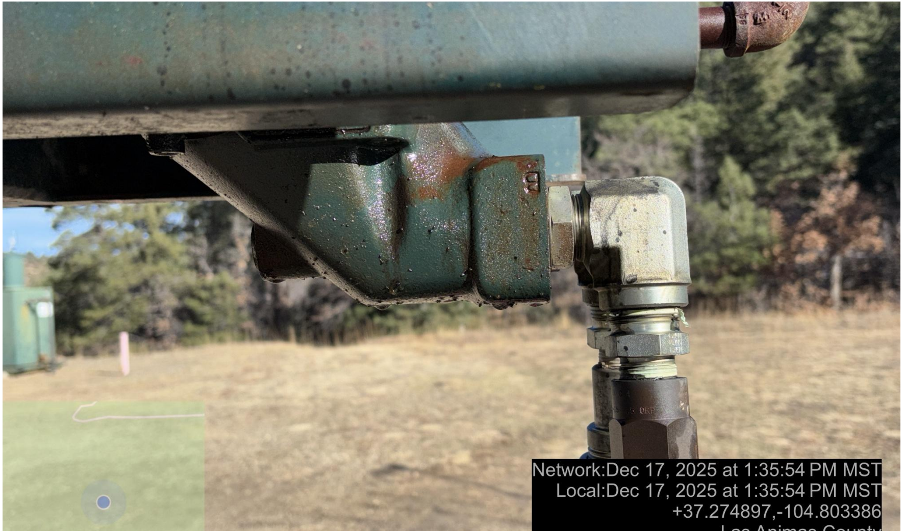
PHOTO 6: DRIVEHEAD IS LEAKING HYDRAULIC FLUID. Securely fasten all valves, pipes, fittings, and Production Facilities to ensure good mechanical condition, inspect at regular intervals and maintain in good mechanical condition. Engineer, operate, and maintain equipment within the manufacturer's recommended specifications per Rule 608.e. CA DATE 1/1/2026.