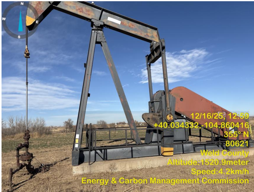
Photo 5 Wellsite.