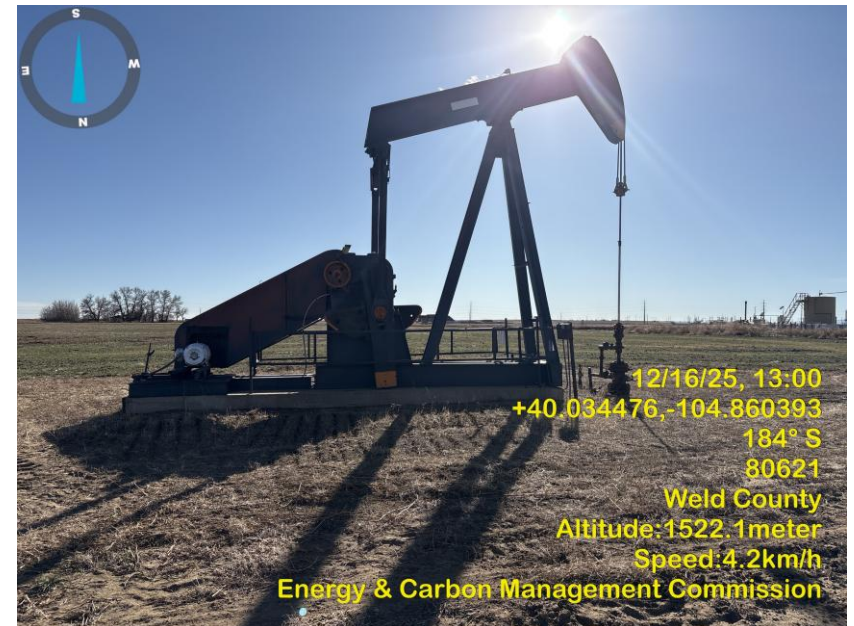
Photo 6 Wellsite.