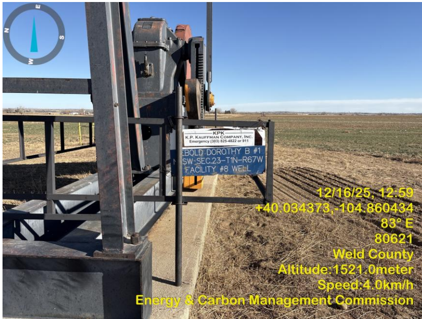
Photo 3 Wellsite sign.