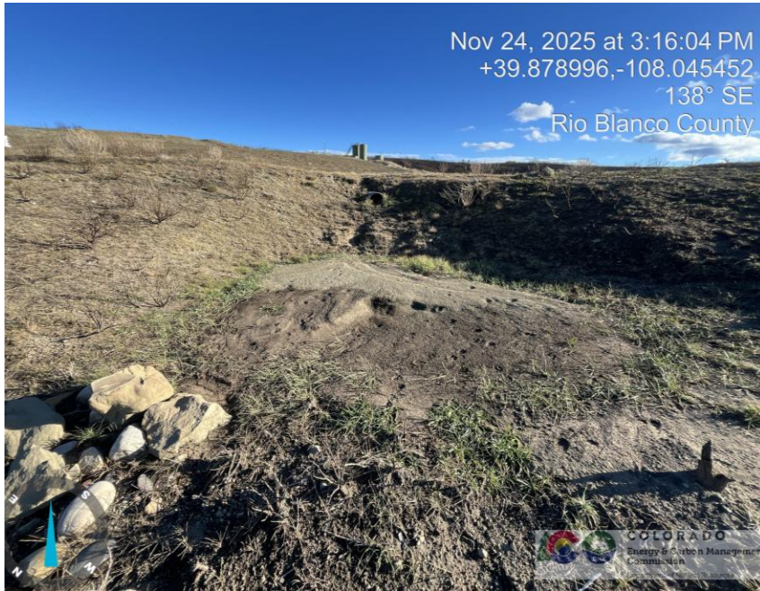
Photo # 4497 Sediment migrating off location and choking off vegetation/insufficient BMP's