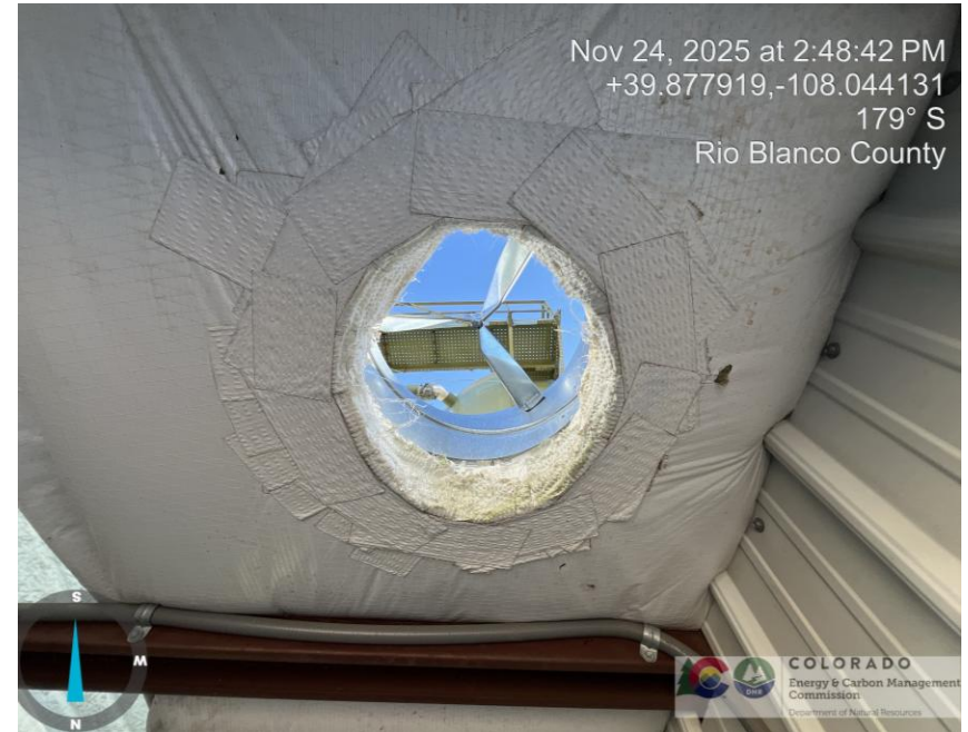
Photo # 4471 Vent in pump house open to wildlife/available for entry by wildlife