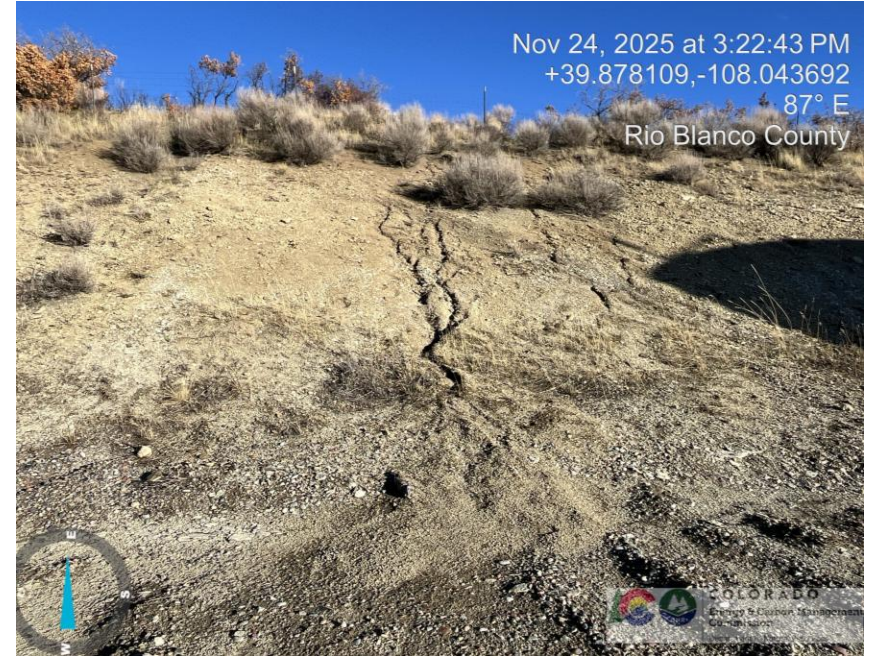
Photo # 4503 Rill erosion & transport of sediment on cut slope/sediment migrating onto location/insufficient BMP's