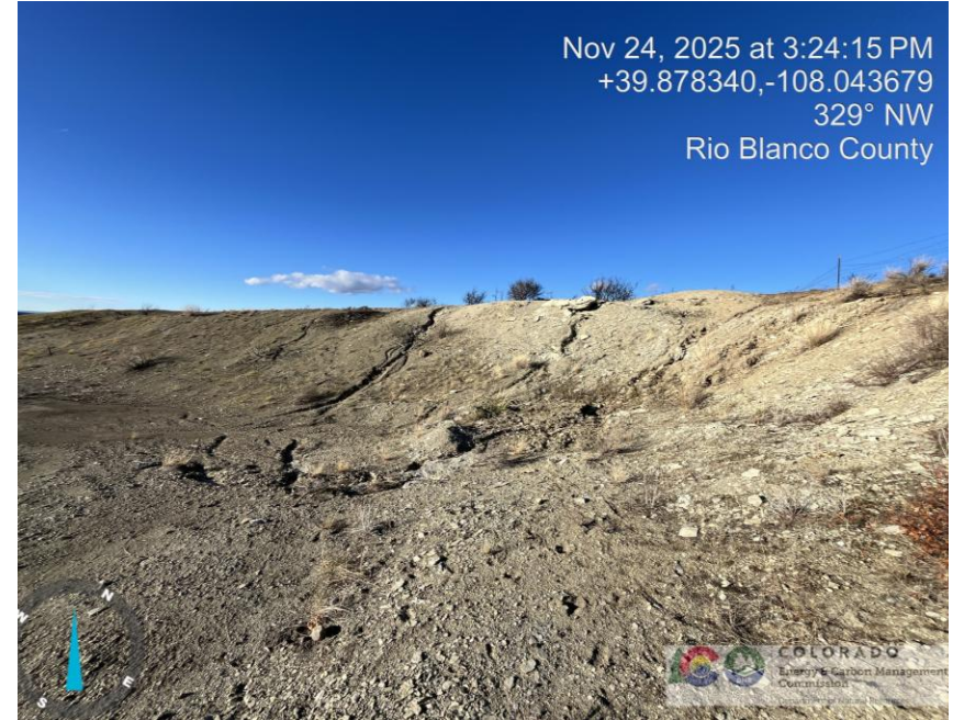
Photo # 4505 Rill erosion & transport of sediment on cut slope/sediment migrating onto location/insufficient BMP's