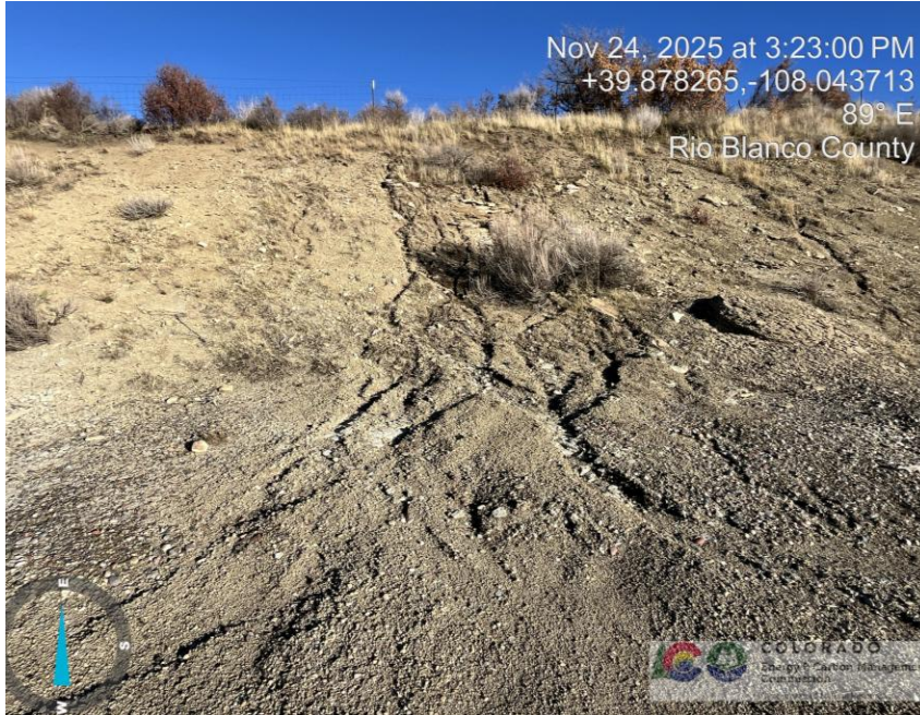
Photo # 4504 Rill erosion & transport of sediment on cut slope/sediment migrating onto location/insufficient BMP's