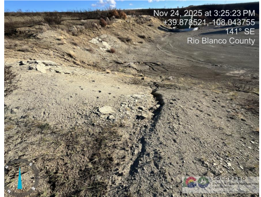
Photo # 4506 Rill erosion & transport of sediment on cut slope/sediment migrating onto location/insufficient BMP's