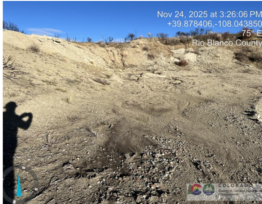
Photo # 4508 Rill erosion & transport of sediment on cut slope/sediment migrating onto location/insufficient BMP's