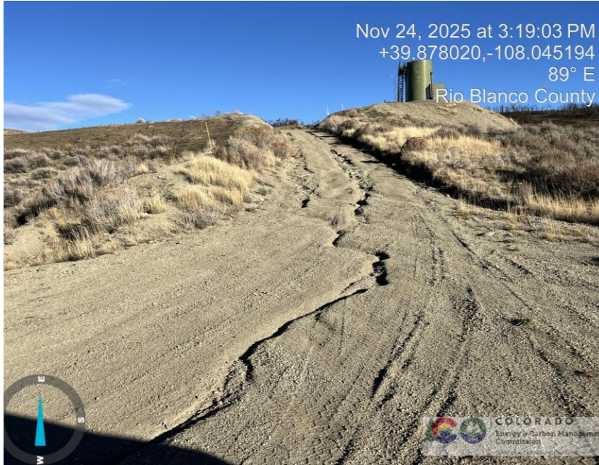
Photo # 4501 Insufficient erosion control on lease road; rill erosion cutting down lease road/insufficient BMP's