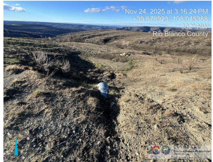
Photo # 4498 Sediment migrating off location and choking off vegetation/insufficient BMP's