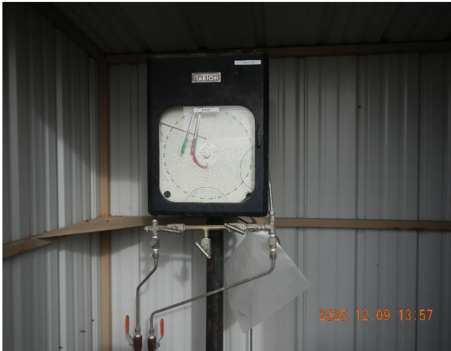
5. Gas Meter inside Meter Shed.