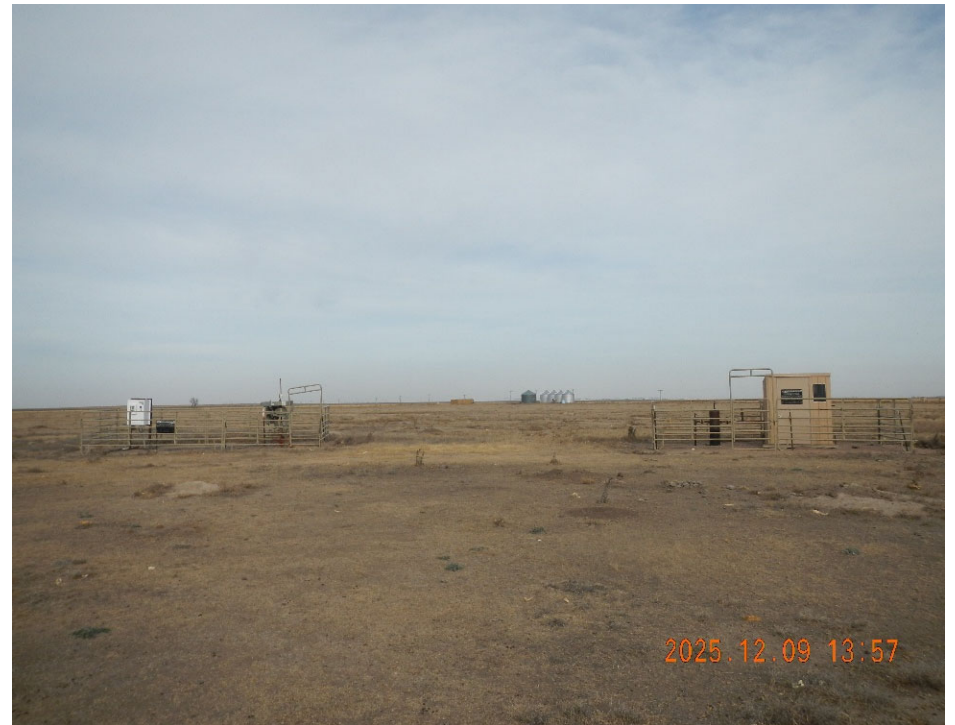
6. Well location overview.