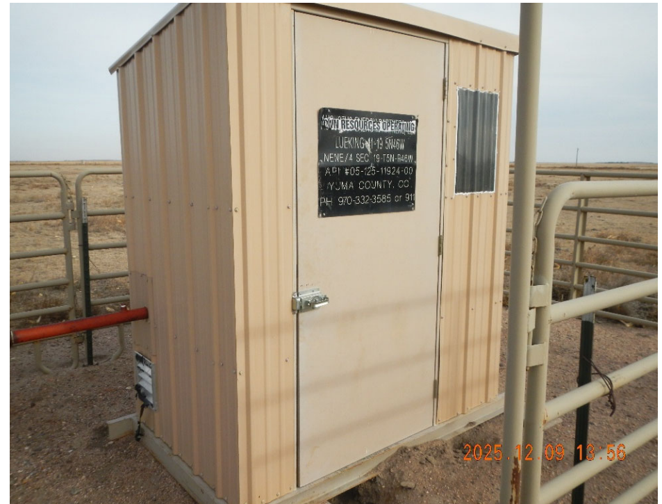
4. Lease sign and gas meter shed at gathering location.