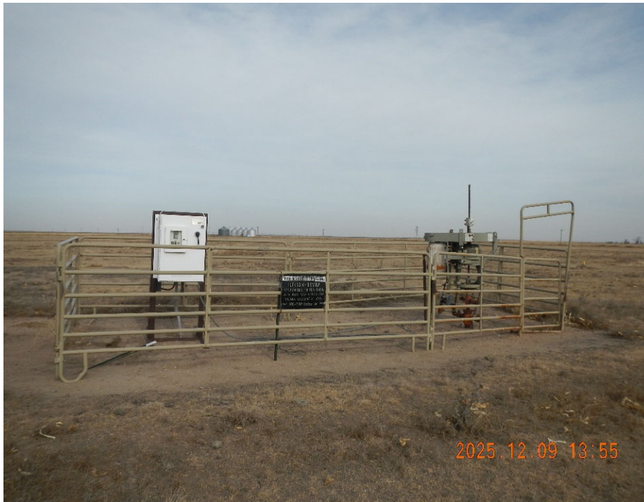
3. Well location overview.