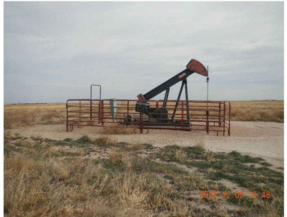
4. Well location overview.