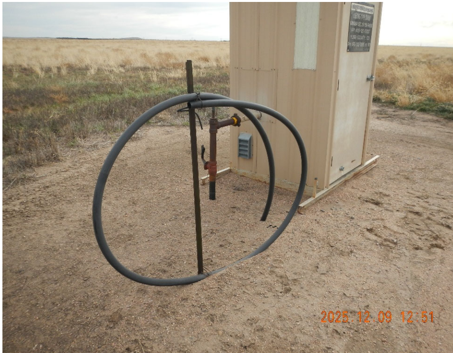
7. View of black poly line stubbed up at remote gathering location.