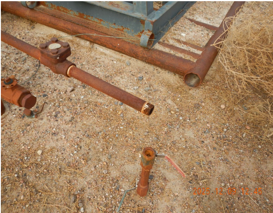
3. View of open-ended flowline and riser at wellhead location.