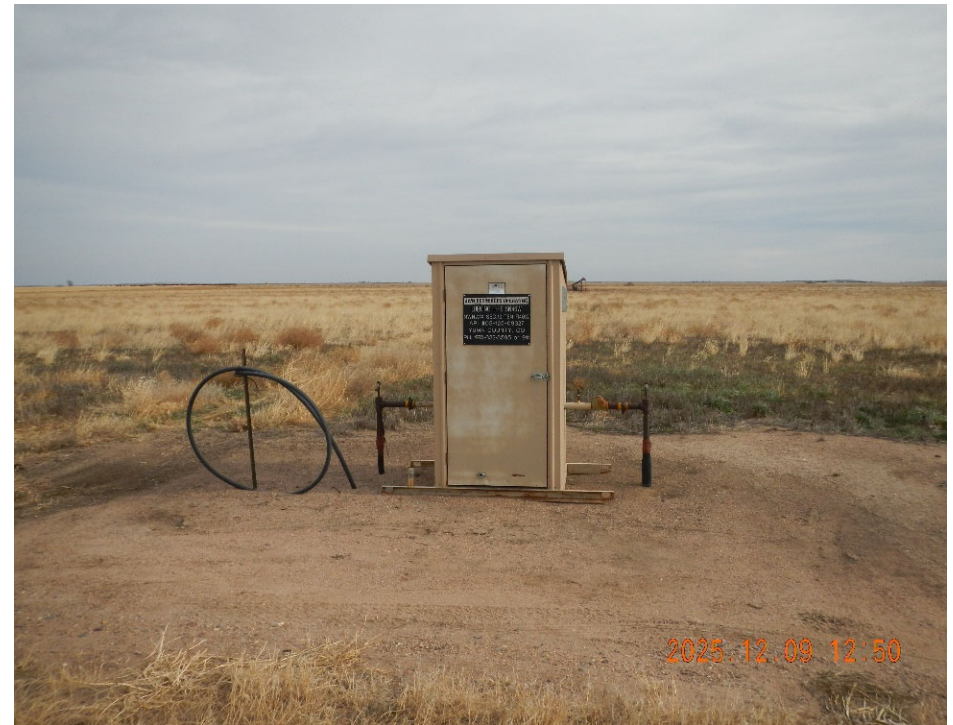
8. Gathering location overview.